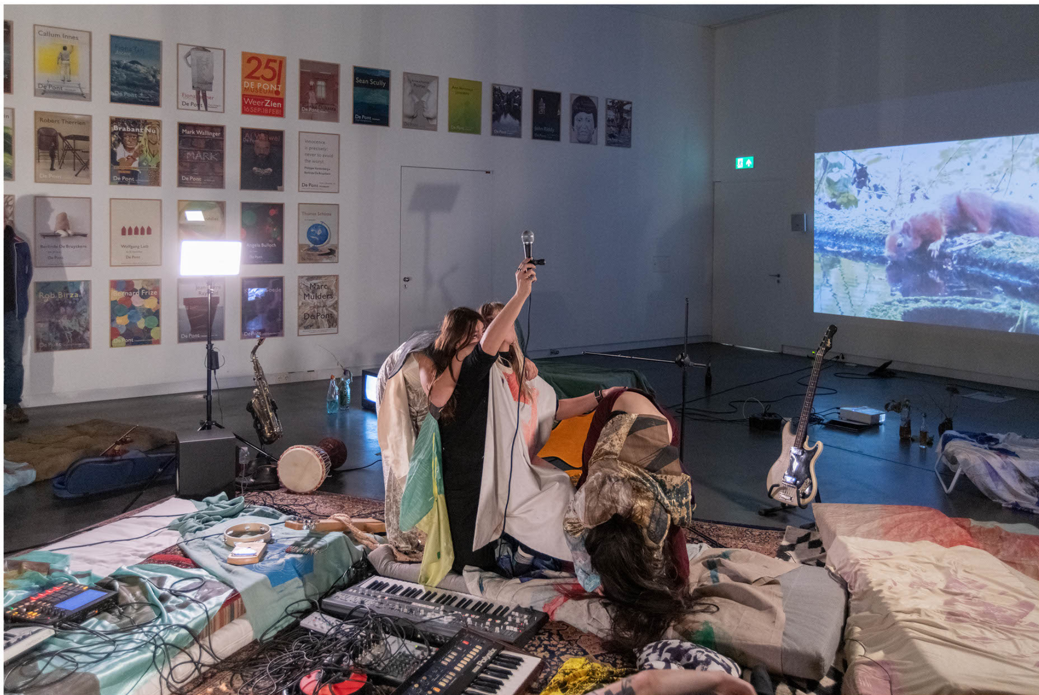
It is part XXXII of an ensemble, and this ensemble is no longer necessarily ceremonial (like ducks in a pond, breaking bad, naipatta), 2022 installation view Museum De Pont, Tilburg