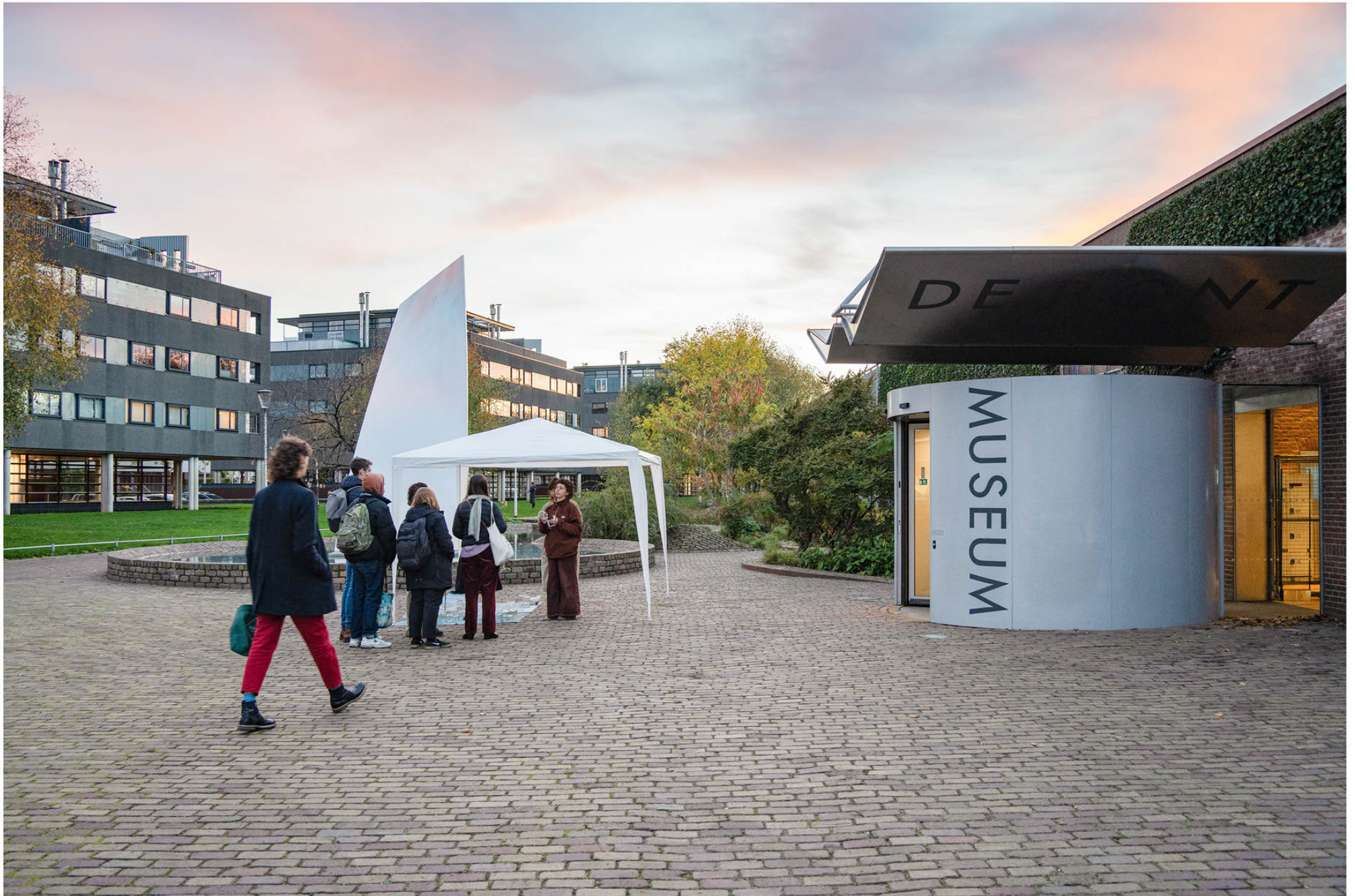
It is part XXXII of an ensemble, and this ensemble is no longer necessarily ceremonial (like ducks in a pond, breaking bad, naipatta), 2022 installation view Museum De Pont, Tilburg