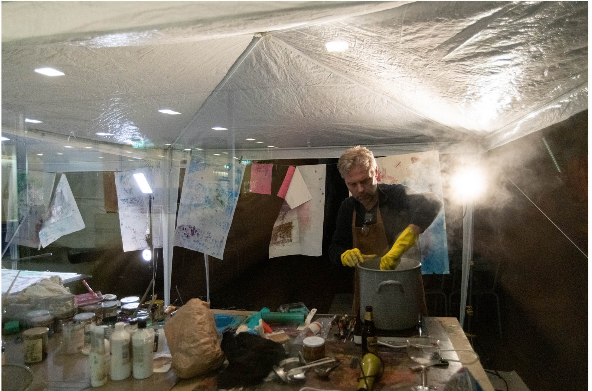
It is part XXXII of an ensemble, and this ensemble is no longer necessarily ceremonial (like ducks in a pond, breaking bad, naipatta), 2022 installation view Museum De Pont, Tilburg