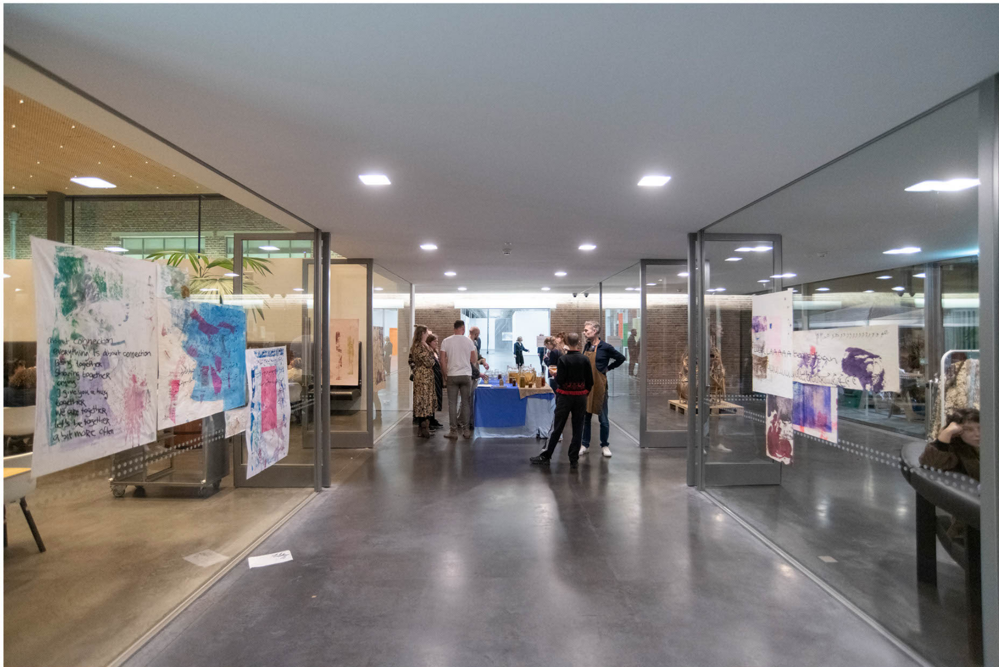
It is part XXXII of an ensemble, and this ensemble is no longer necessarily ceremonial (like ducks in a pond, breaking bad, naipatta), 2022 installation view Museum De Pont, Tilburg