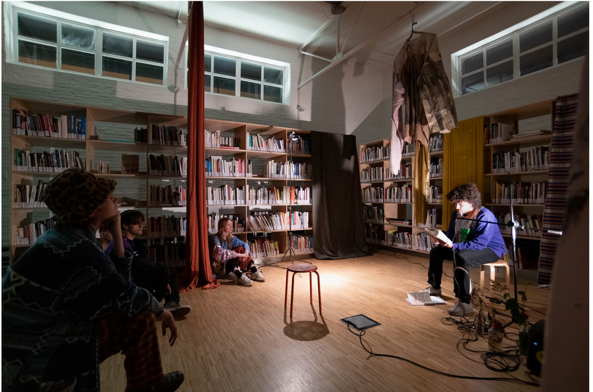
It is part XXXII of an ensemble, and this ensemble is no longer necessarily ceremonial (like ducks in a pond, breaking bad, naipatta), 2022 installation view Museum De Pont, Tilburg