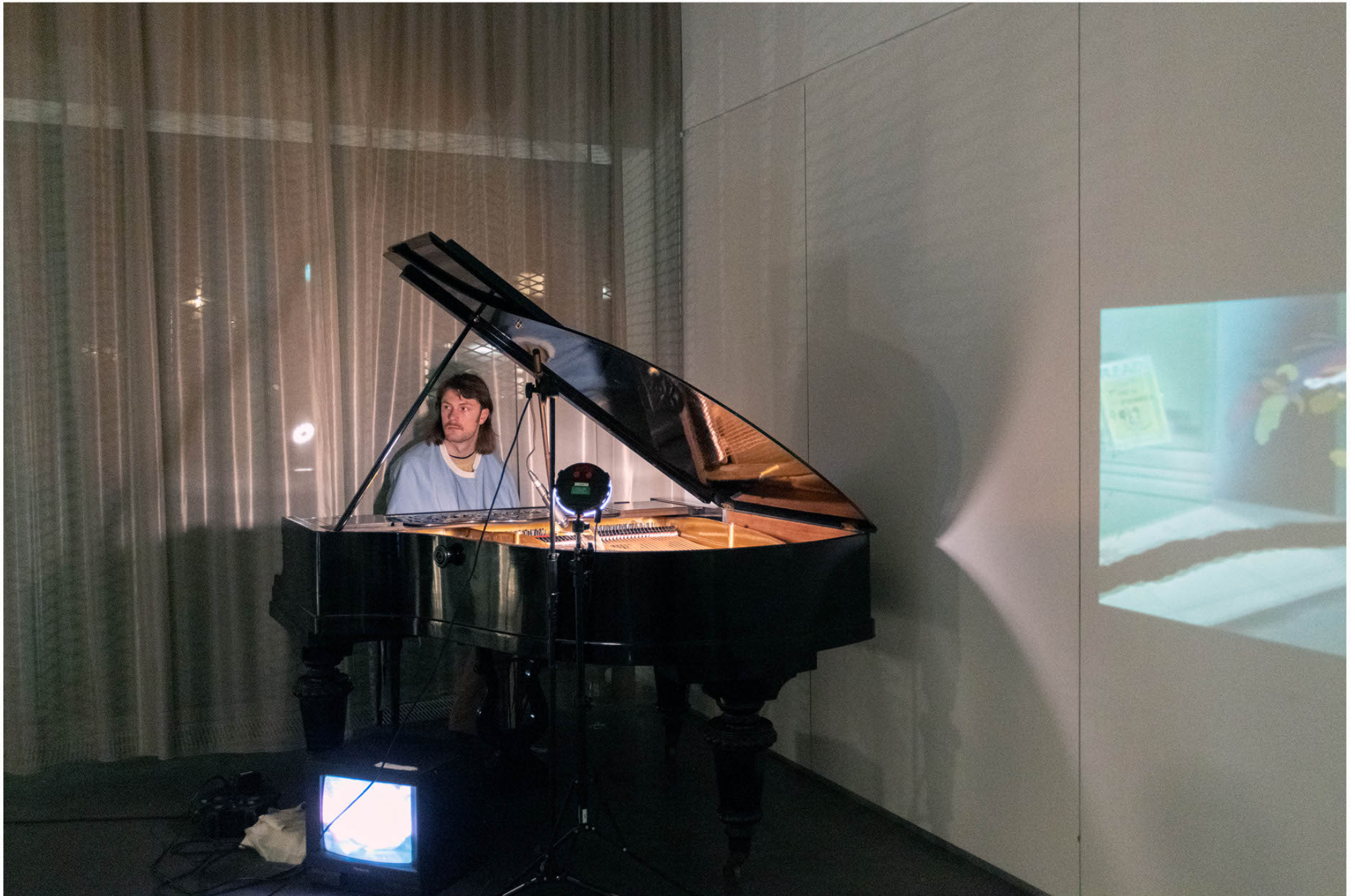
It is part XXXII of an ensemble, and this ensemble is no longer necessarily ceremonial (like ducks in a pond, breaking bad, naipatta), 2022 installation view Museum De Pont, Tilburg