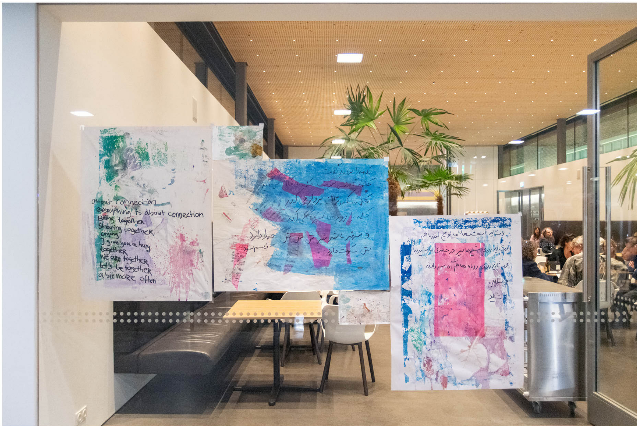
It is part XXXII of an ensemble, and this ensemble is no longer necessarily ceremonial (like ducks in a pond, breaking bad, naipatta), 2022 installation view Museum De Pont, Tilburg