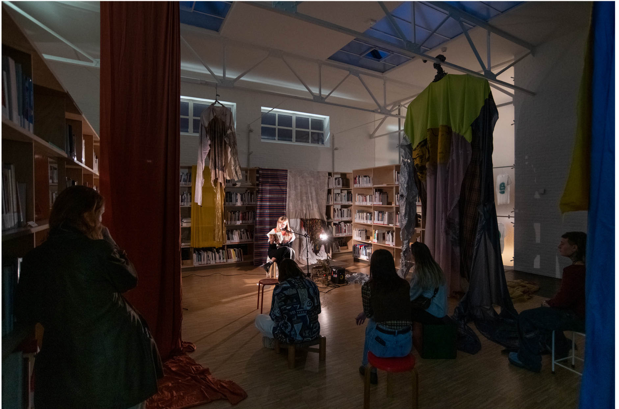
It is part XXXII of an ensemble, and this ensemble is no longer necessarily ceremonial (like ducks in a pond, breaking bad, naipatta), 2022 installation view Museum De Pont, Tilburg