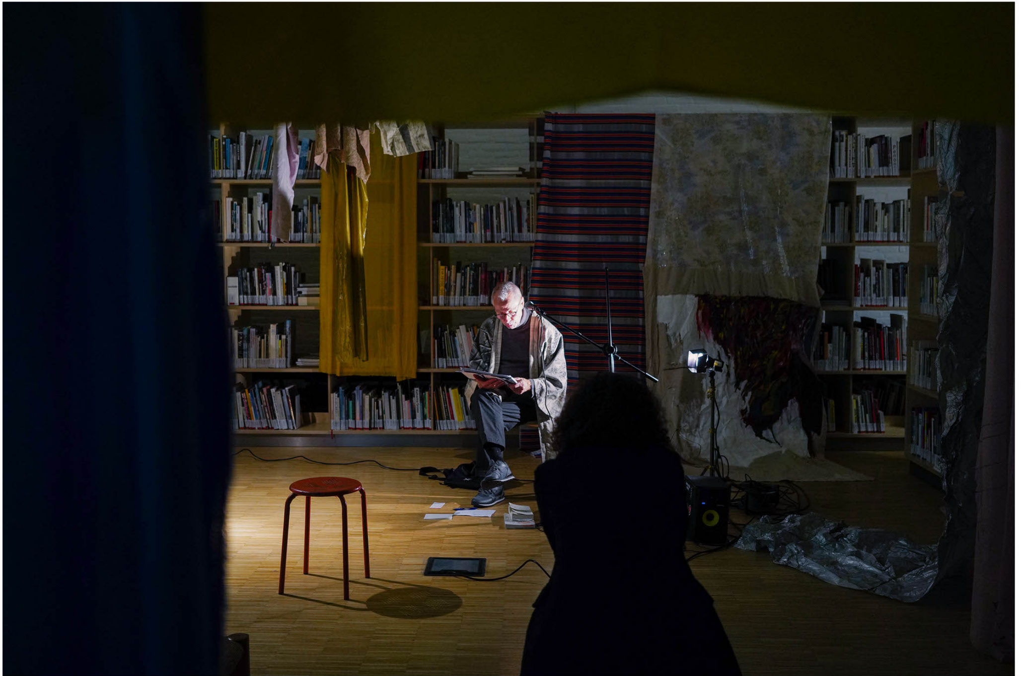
It is part XXXII of an ensemble, and this ensemble is no longer necessarily ceremonial (like ducks in a pond, breaking bad, naipatta), 2022 installation view Museum De Pont, Tilburg