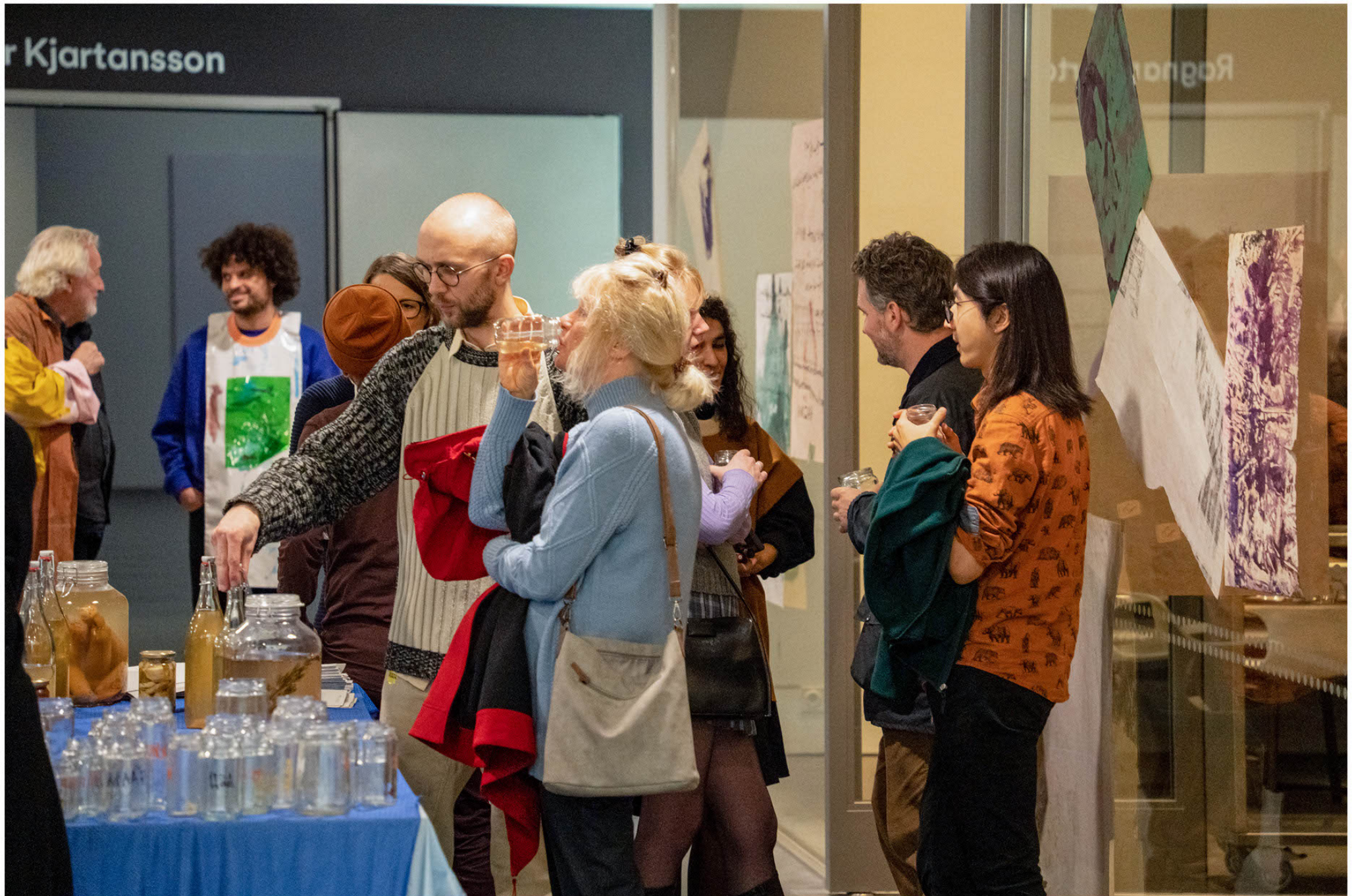
It is part XXXII of an ensemble, and this ensemble is no longer necessarily ceremonial (like ducks in a pond, breaking bad, naipatta), 2022 installation view Museum De Pont, Tilburg