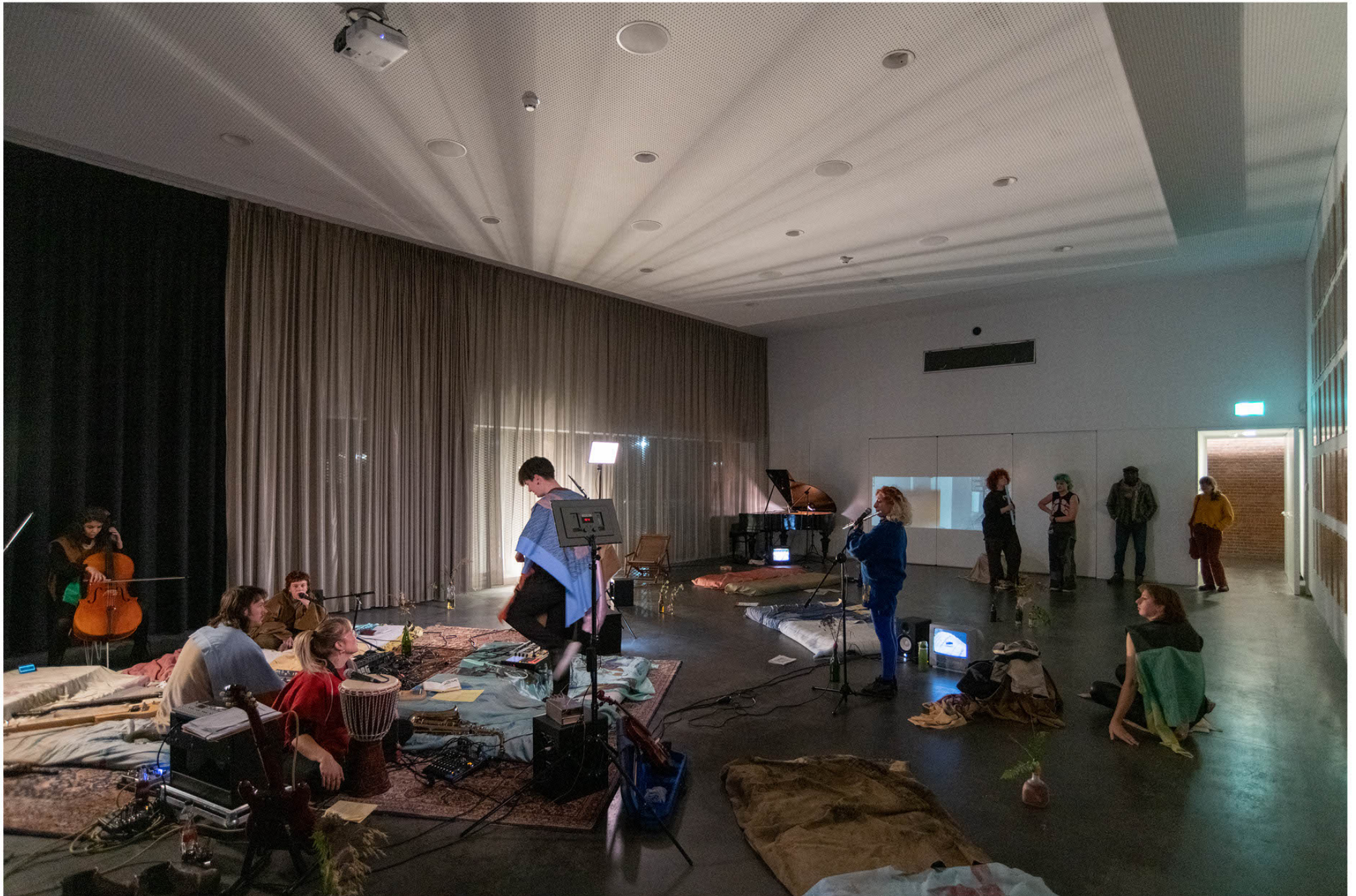
It is part XXXII of an ensemble, and this ensemble is no longer necessarily ceremonial (like ducks in a pond, breaking bad, naipatta), 2022 installation view Museum De Pont, Tilburg