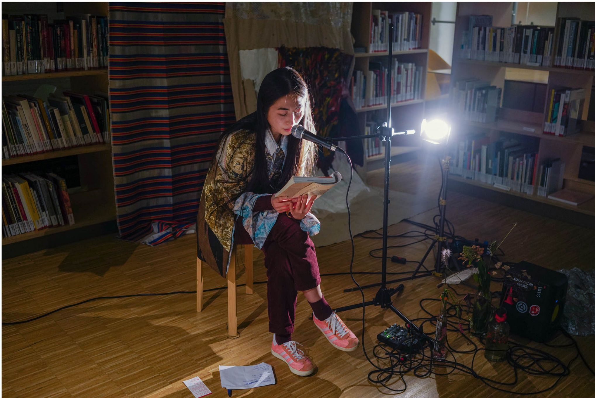
It is part XXXII of an ensemble, and this ensemble is no longer necessarily ceremonial (like ducks in a pond, breaking bad, naipatta), 2022 installation view Museum De Pont, Tilburg