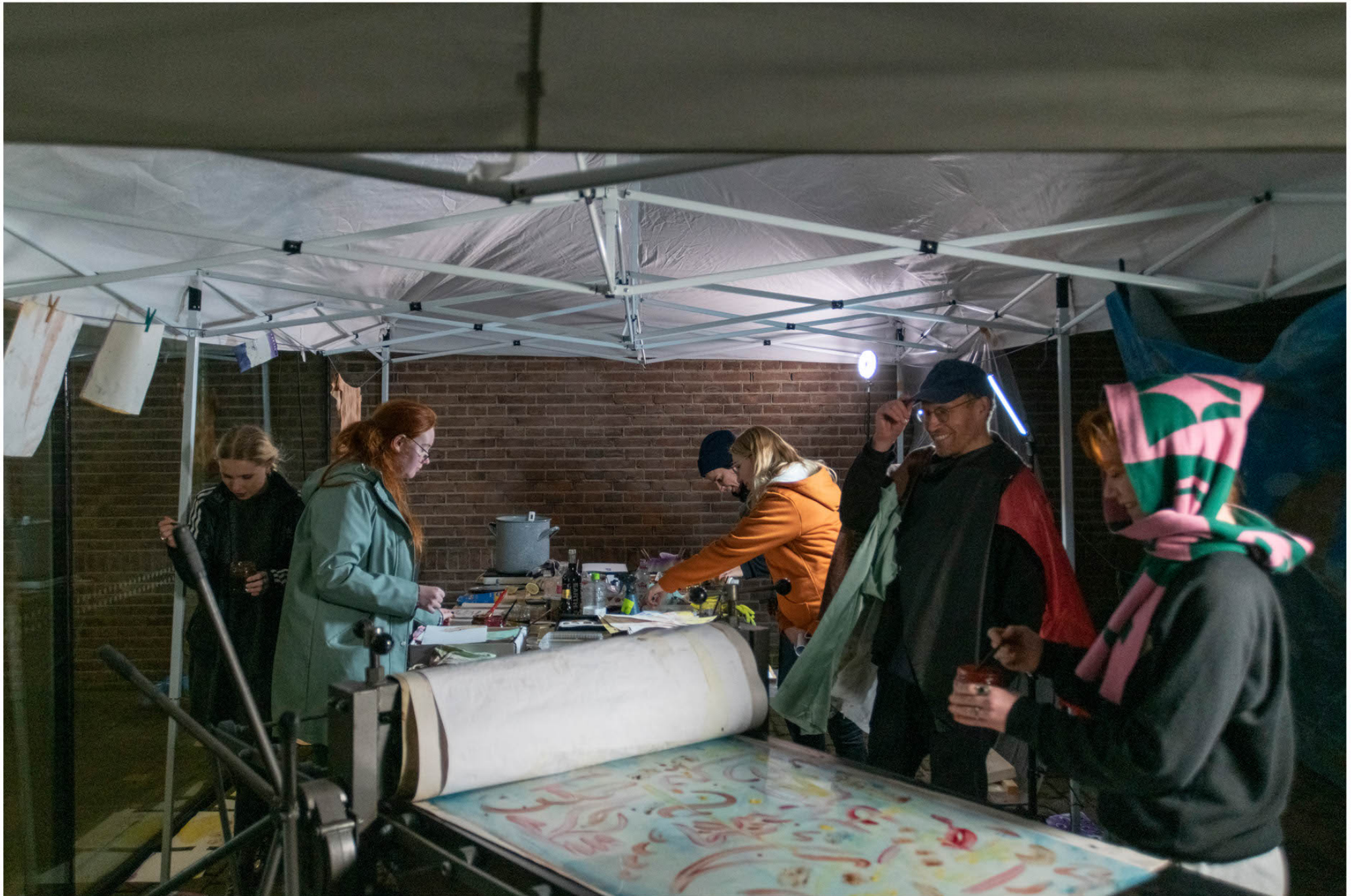
It is part XXXII of an ensemble, and this ensemble is no longer necessarily ceremonial (like ducks in a pond, breaking bad, naipatta), 2022 installation view Museum De Pont, Tilburg