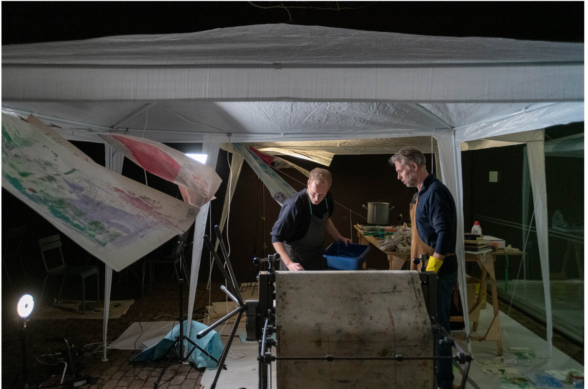
It is part XXXII of an ensemble, and this ensemble is no longer necessarily ceremonial (like ducks in a pond, breaking bad, naipatta), 2022 installation view Museum De Pont, Tilburg