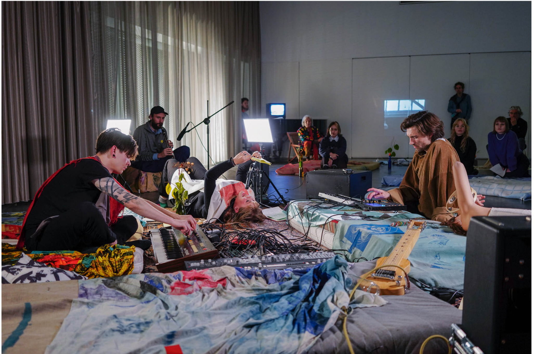
It is part XXXII of an ensemble, and this ensemble is no longer necessarily ceremonial (like ducks in a pond, breaking bad, naipatta), 2022 installation view Museum De Pont, Tilburg