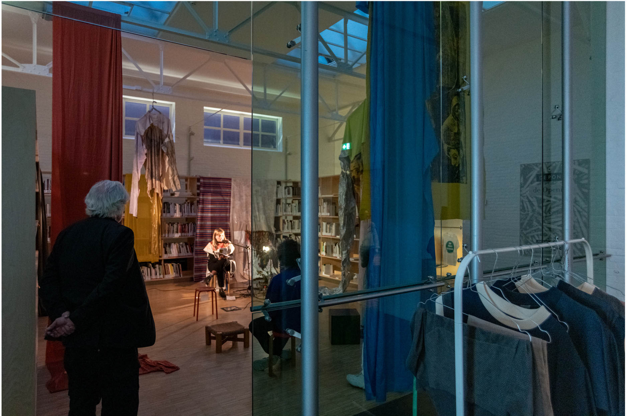
It is part XXXII of an ensemble, and this ensemble is no longer necessarily ceremonial (like ducks in a pond, breaking bad, naipatta), 2022 installation view Museum De Pont, Tilburg