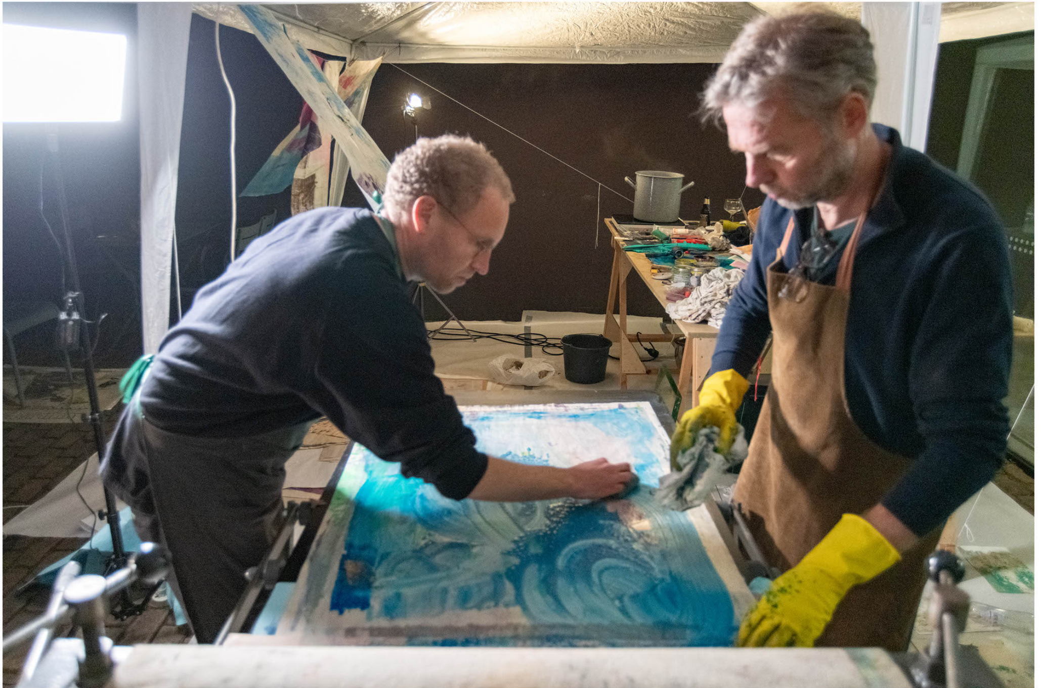
It is part XXXII of an ensemble, and this ensemble is no longer necessarily ceremonial (like ducks in a pond, breaking bad, naipatta), 2022 installation view Museum De Pont, Tilburg