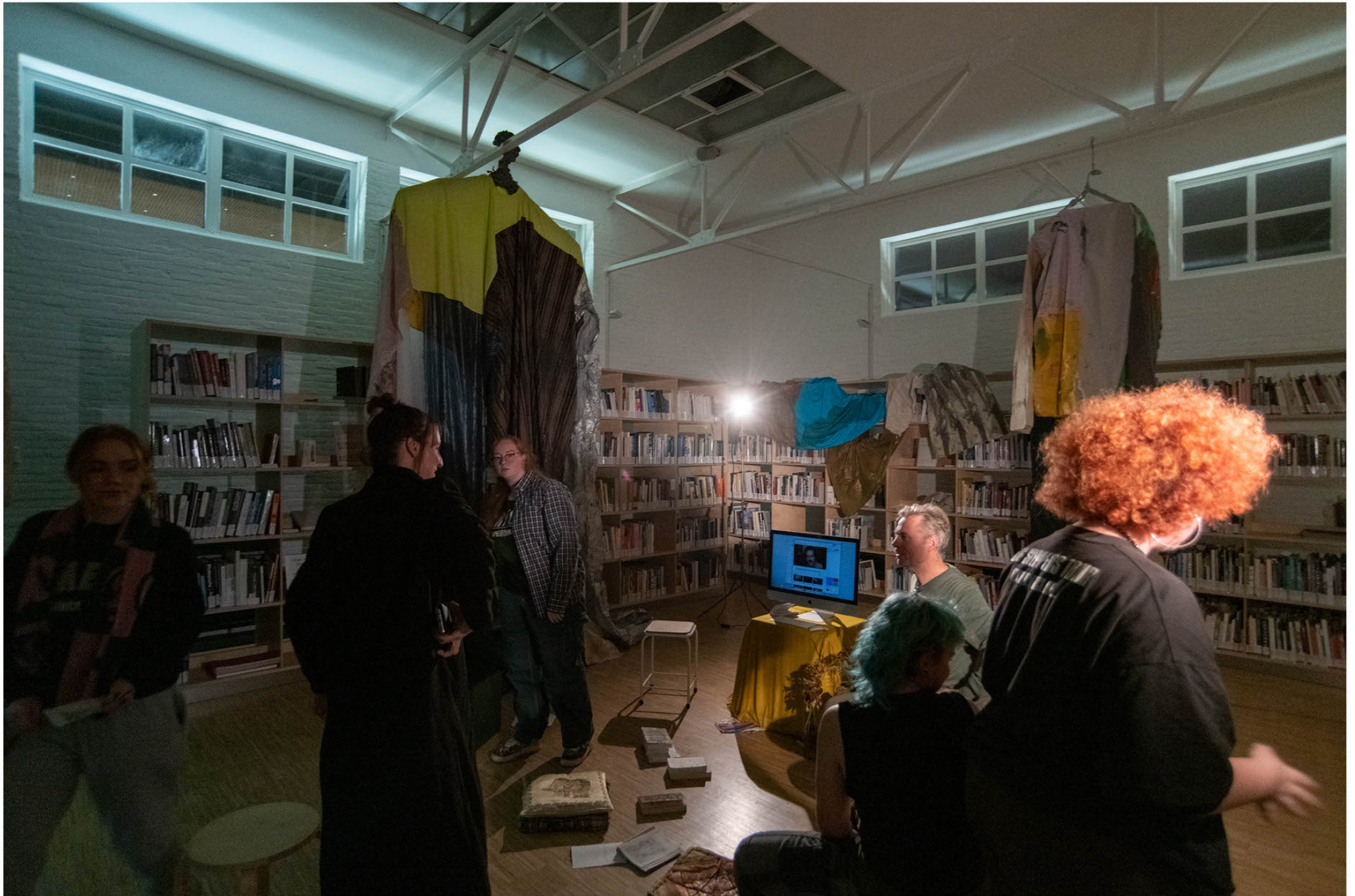
It is part XXXII of an ensemble, and this ensemble is no longer necessarily ceremonial (like ducks in a pond, breaking bad, naipatta), 2022 installation view Museum De Pont, Tilburg