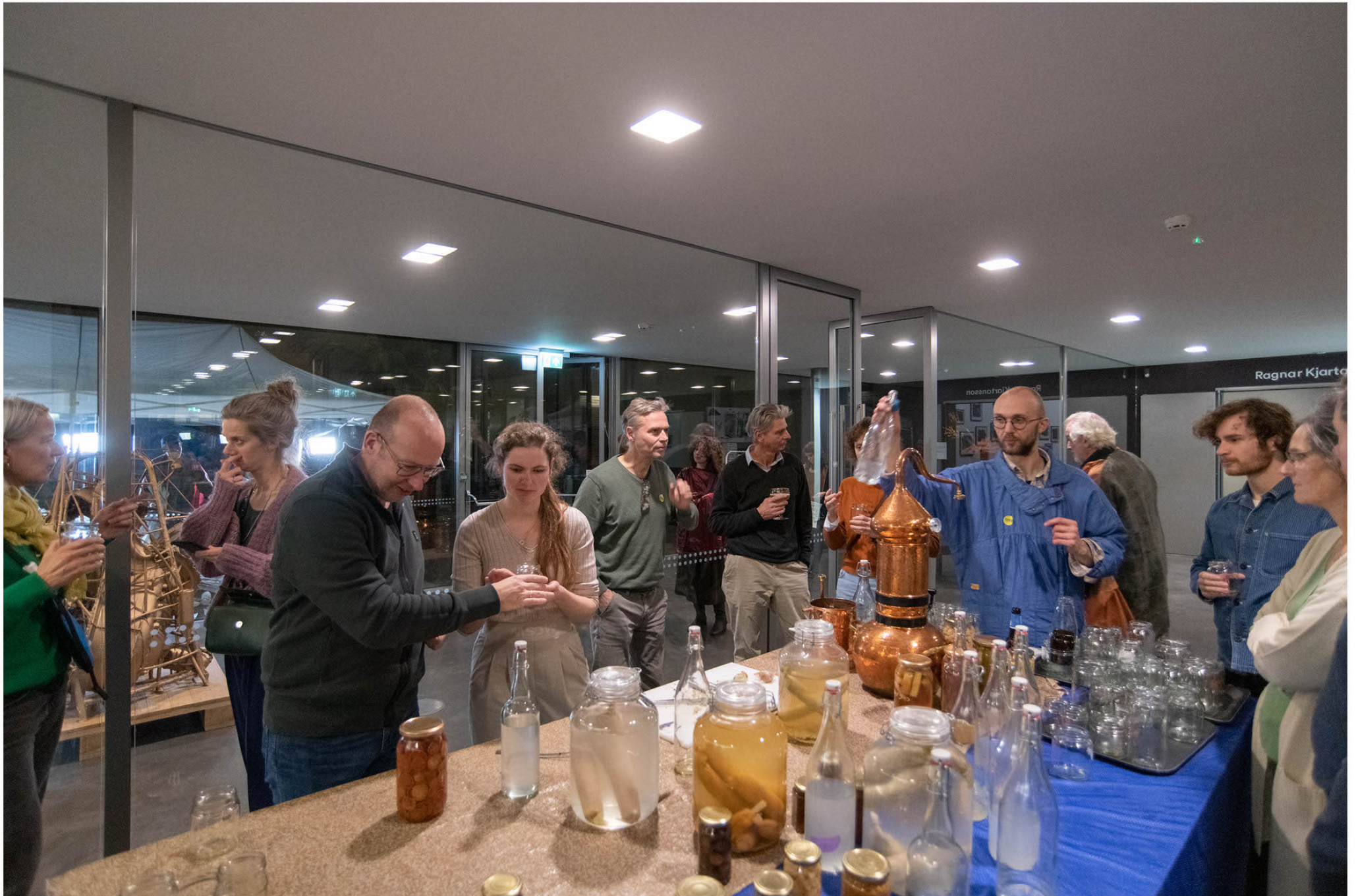
It is part XXXII of an ensemble, and this ensemble is no longer necessarily ceremonial (like ducks in a pond, breaking bad, naipatta), 2022 installation view Museum De Pont, Tilburg