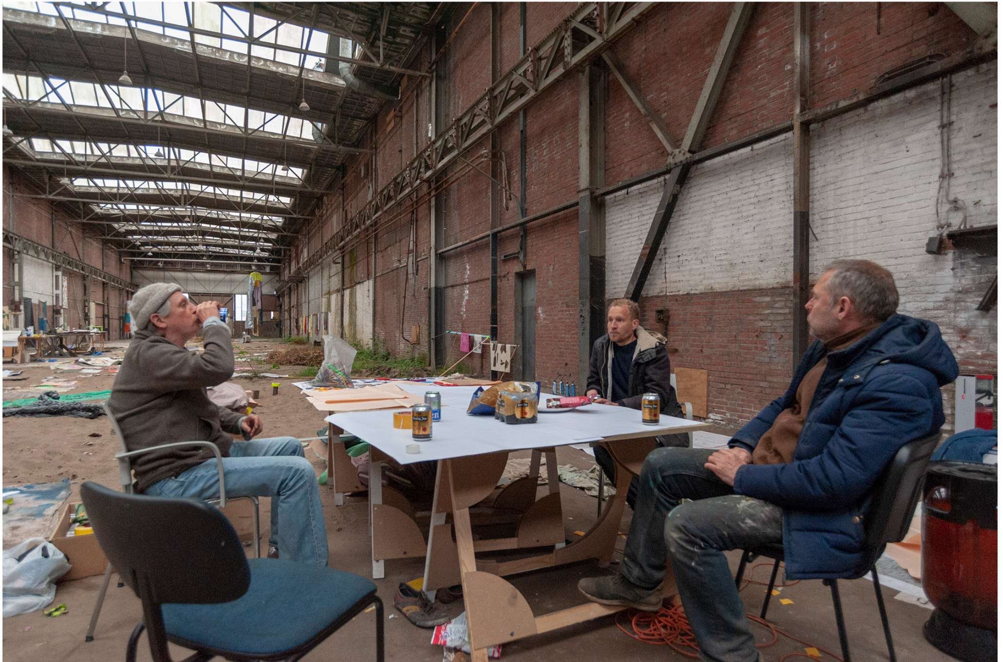
It is part XXI of an ensemble, and this ensemble is no longer necessarily ceremonial, 2021 Backer en Rueb studio