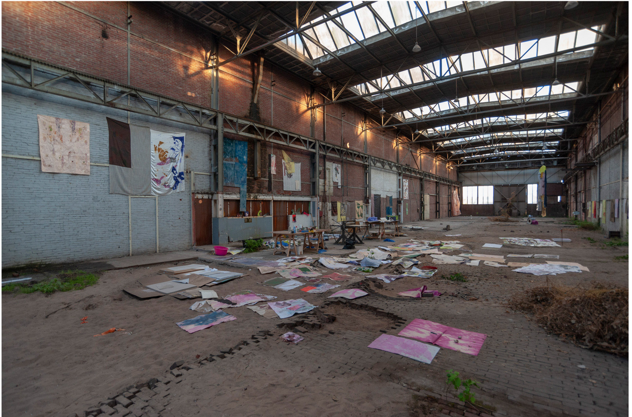
It is part XXI of an ensemble, and this ensemble is no longer necessarily ceremonial, 2021 Backer en Rueb studio