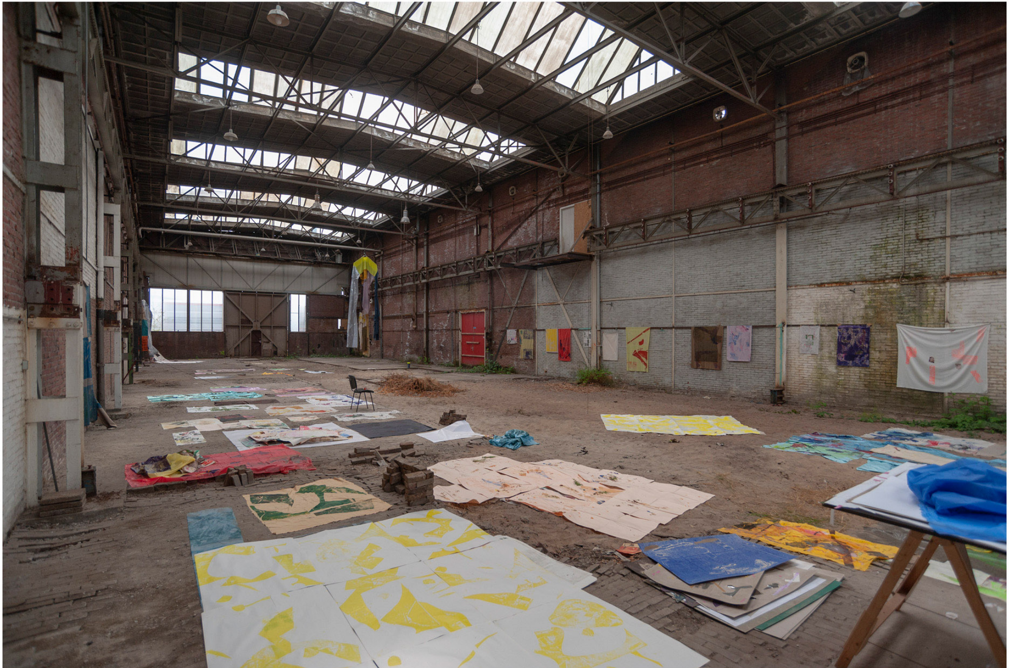
It is part XXI of an ensemble, and this ensemble is no longer necessarily ceremonial, 2021 Backer en Rueb studio