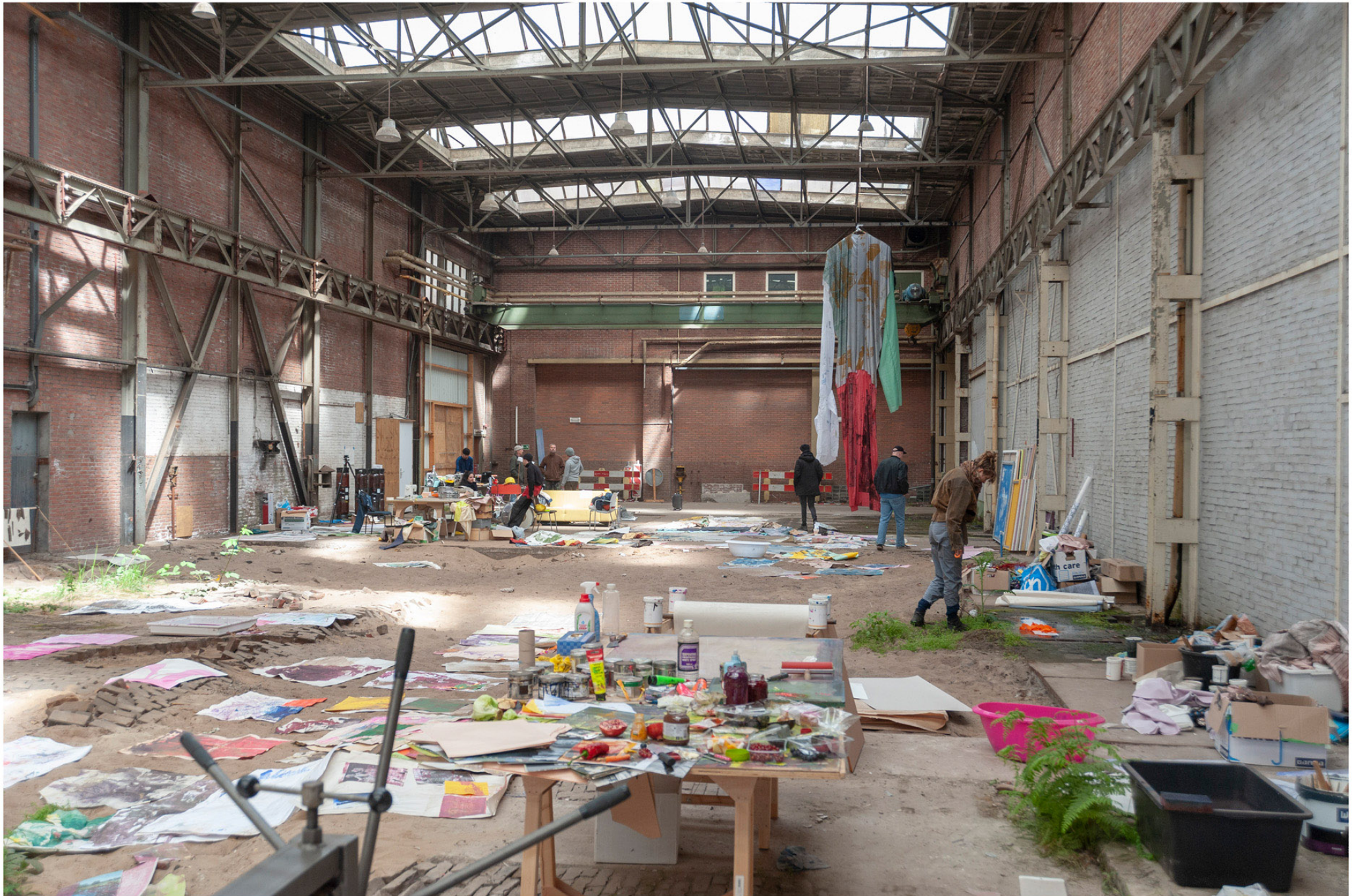
It is part XXI of an ensemble, and this ensemble is no longer necessarily ceremonial, 2021 Backer en Rueb studio