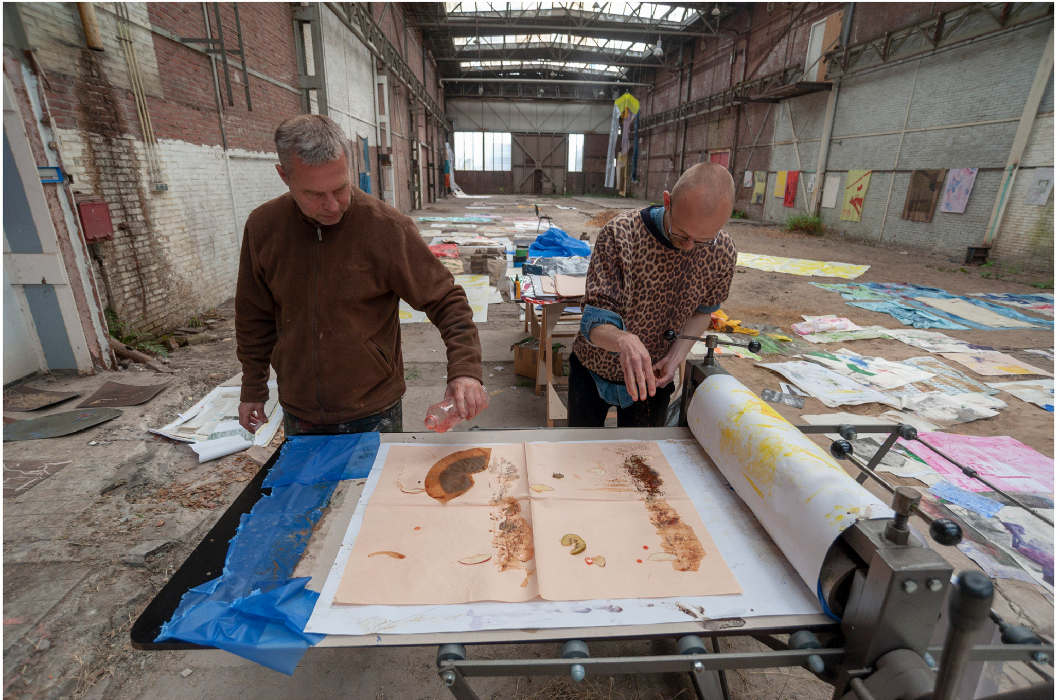
It is part XXI of an ensemble, and this ensemble is no longer necessarily ceremonial, 2021 Backer en Rueb studio