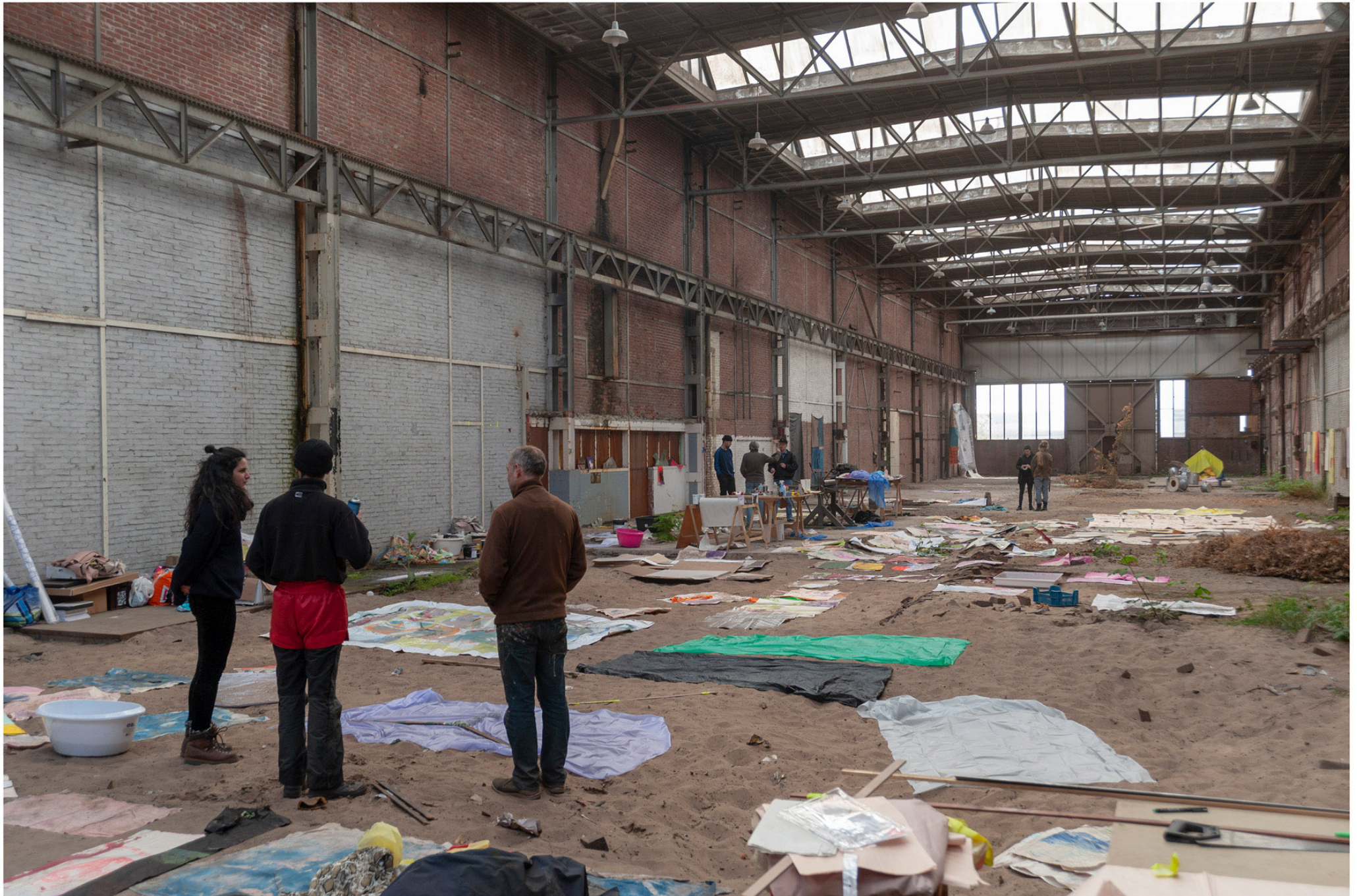
It is part XXI of an ensemble, and this ensemble is no longer necessarily ceremonial, 2021 Backer en Rueb studio