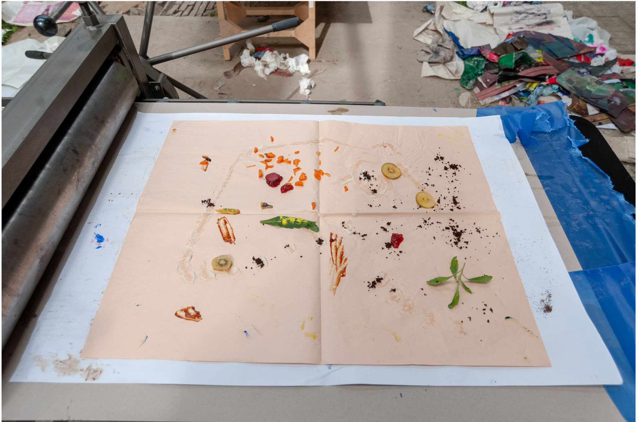
It is part XXI of an ensemble, and this ensemble is no longer necessarily ceremonial, 2021 Backer en Rueb studio