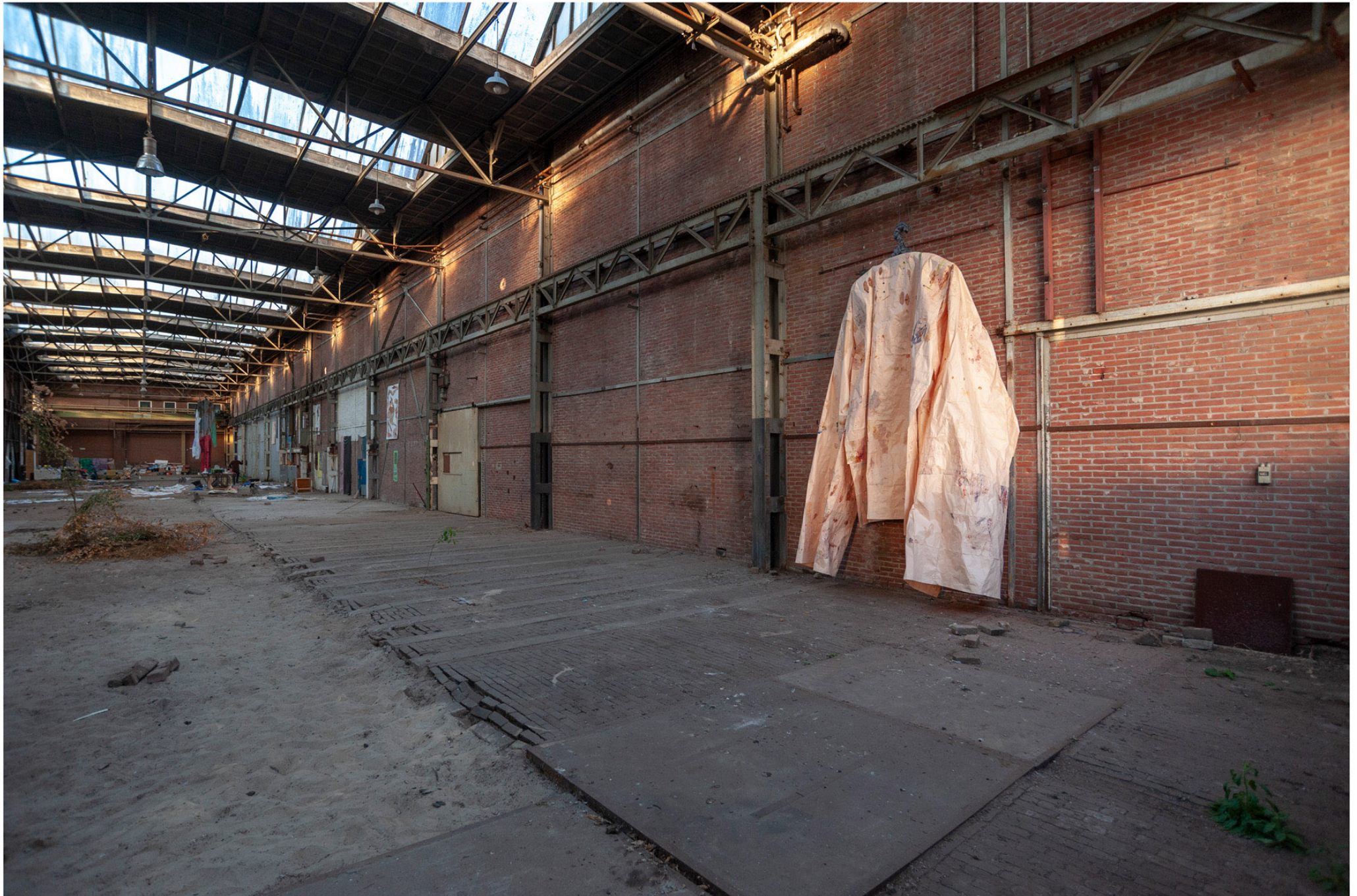
It is part XXI of an ensemble, and this ensemble is no longer necessarily ceremonial, 2021 Backer en Rueb studio