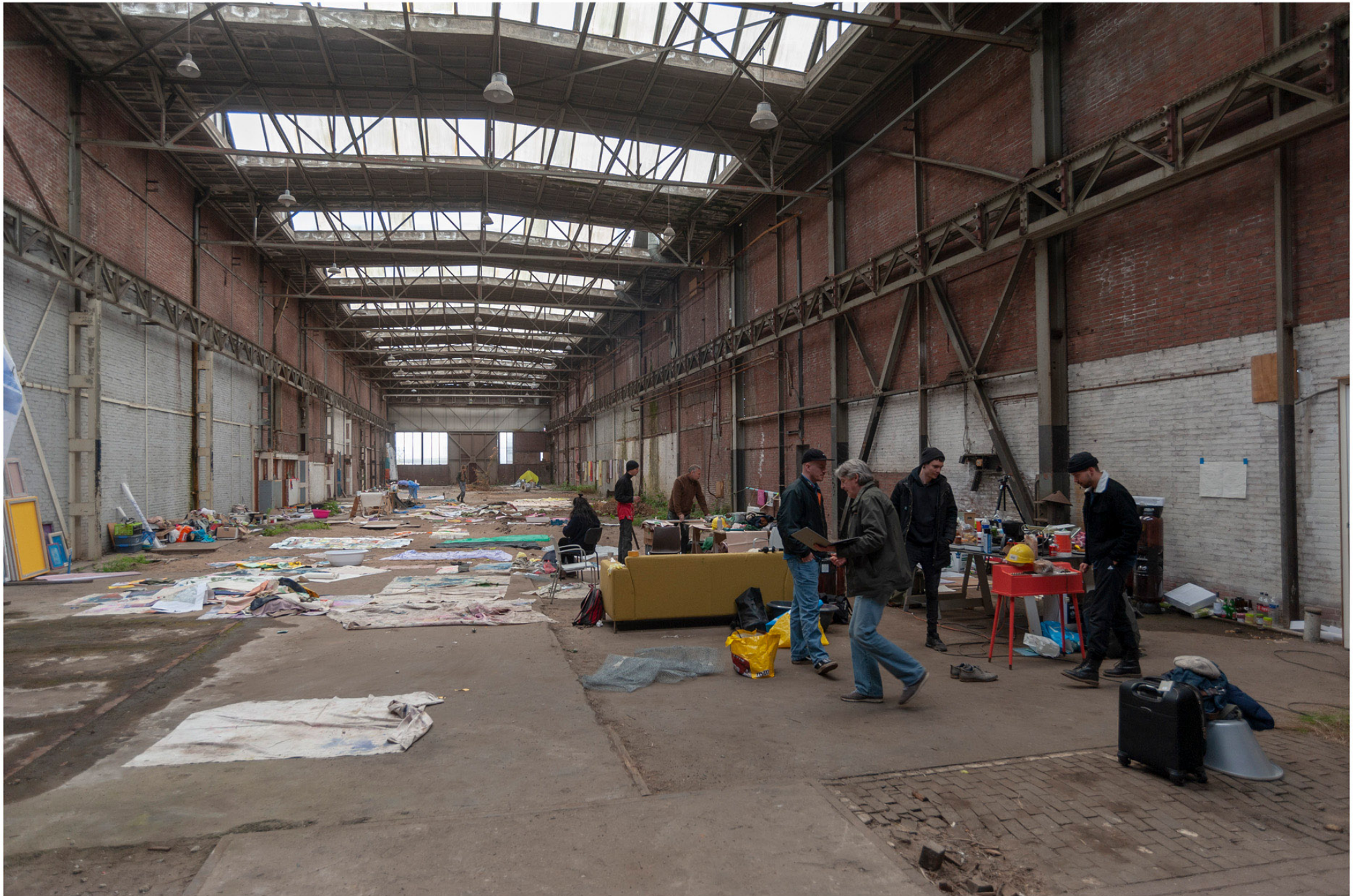
It is part XXI of an ensemble, and this ensemble is no longer necessarily ceremonial, 2021 Backer en Rueb studio