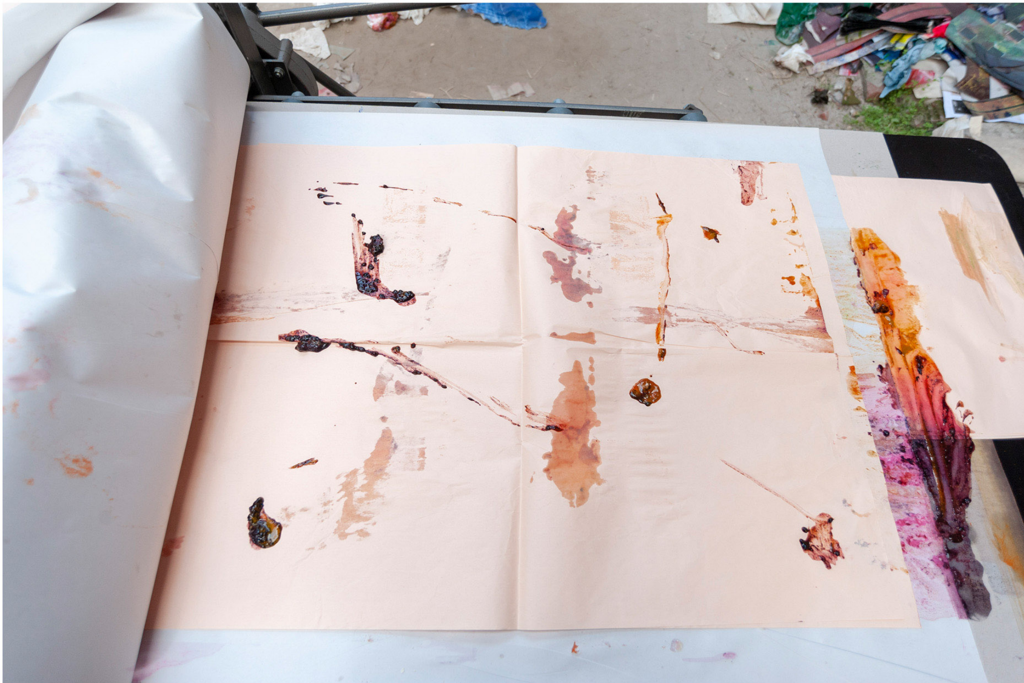
It is part XXI of an ensemble, and this ensemble is no longer necessarily ceremonial, 2021 Backer en Rueb studio