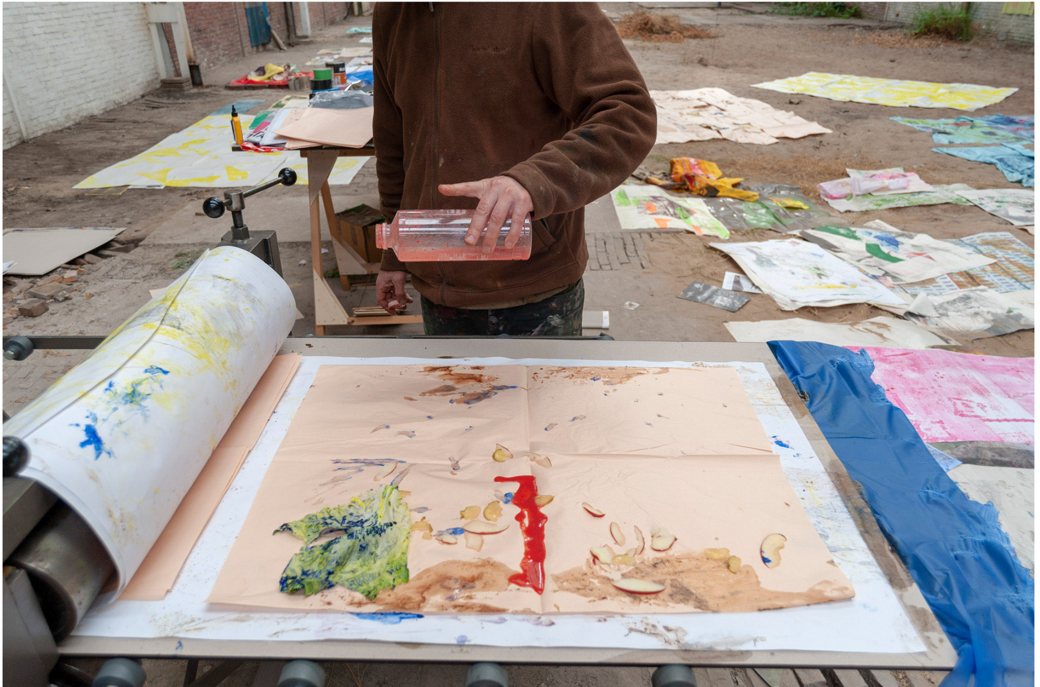
It is part XXI of an ensemble, and this ensemble is no longer necessarily ceremonial, 2021 Backer en Rueb studio