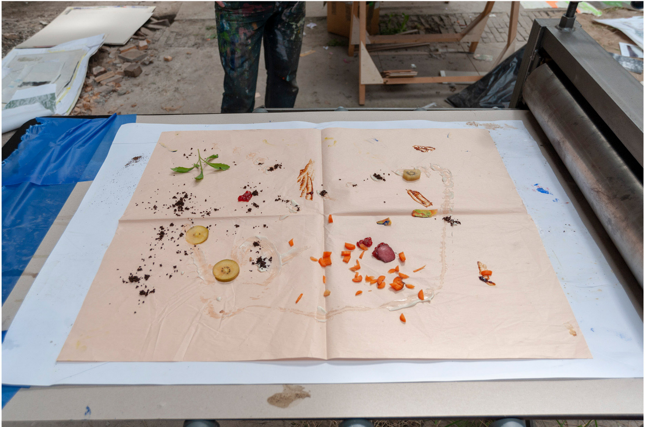
It is part XXI of an ensemble, and this ensemble is no longer necessarily ceremonial, 2021 Backer en Rueb studio