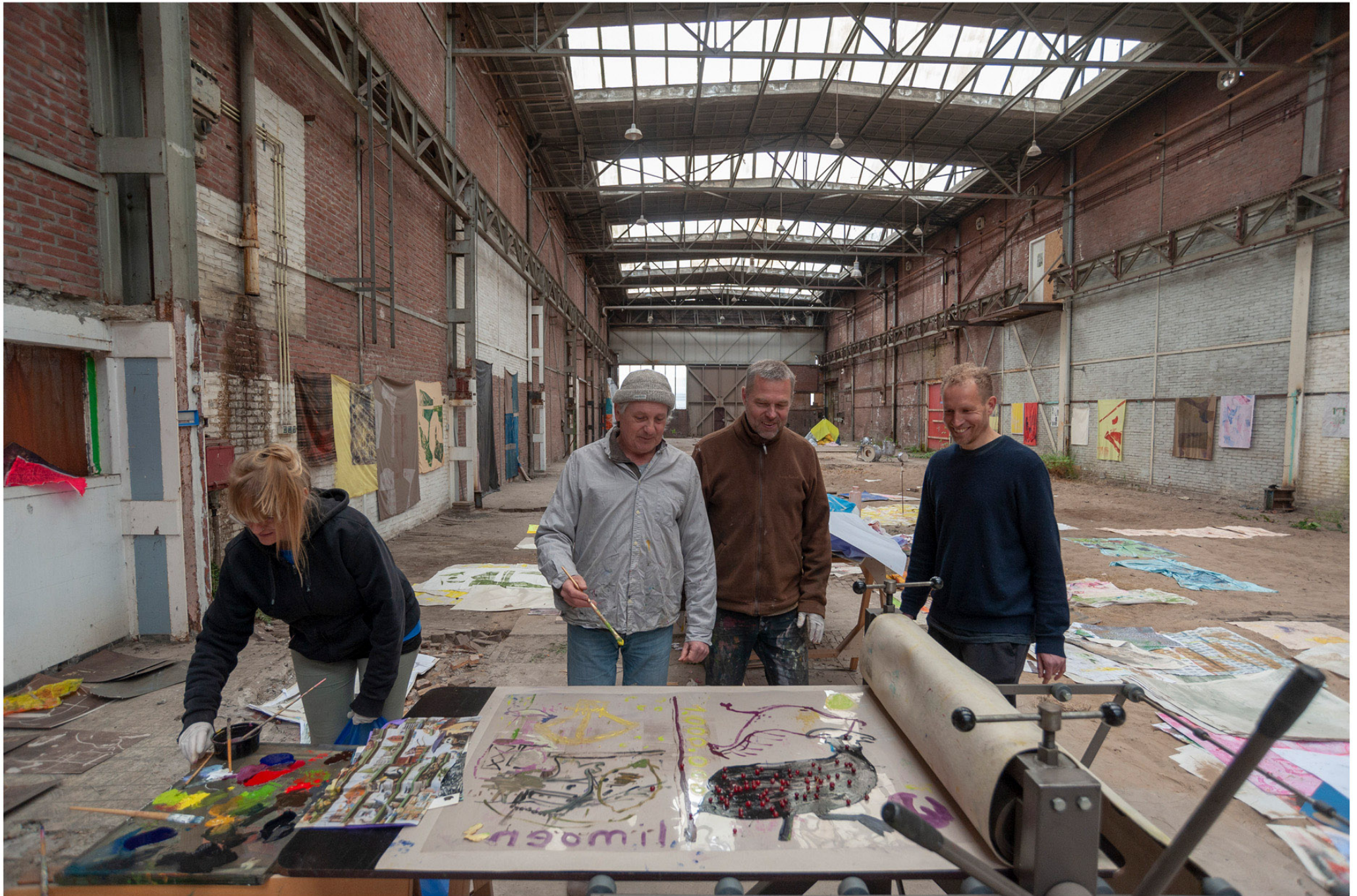
It is part XXI of an ensemble, and this ensemble is no longer necessarily ceremonial, 2021 Backer en Rueb studio