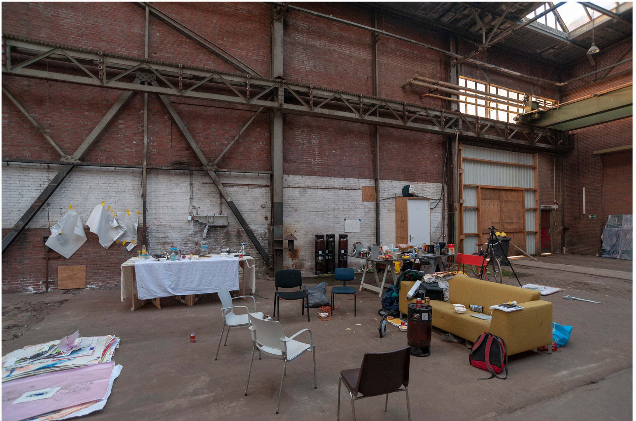
It is part XXI of an ensemble, and this ensemble is no longer necessarily ceremonial, 2021 Backer en Rueb studio