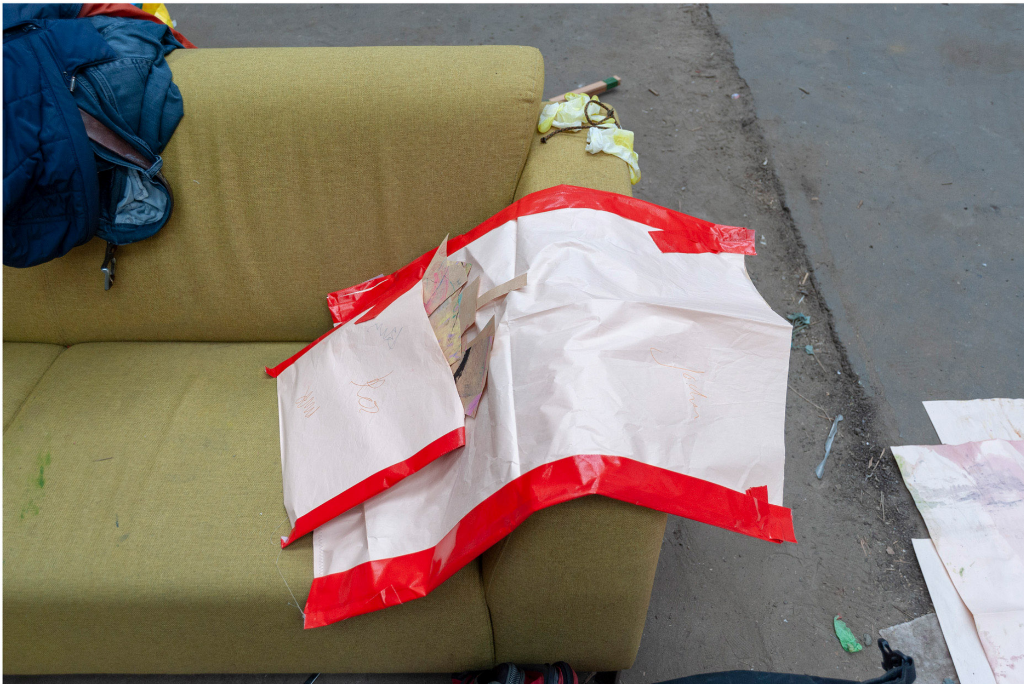
It is part XXI of an ensemble, and this ensemble is no longer necessarily ceremonial, 2021 Backer en Rueb studio