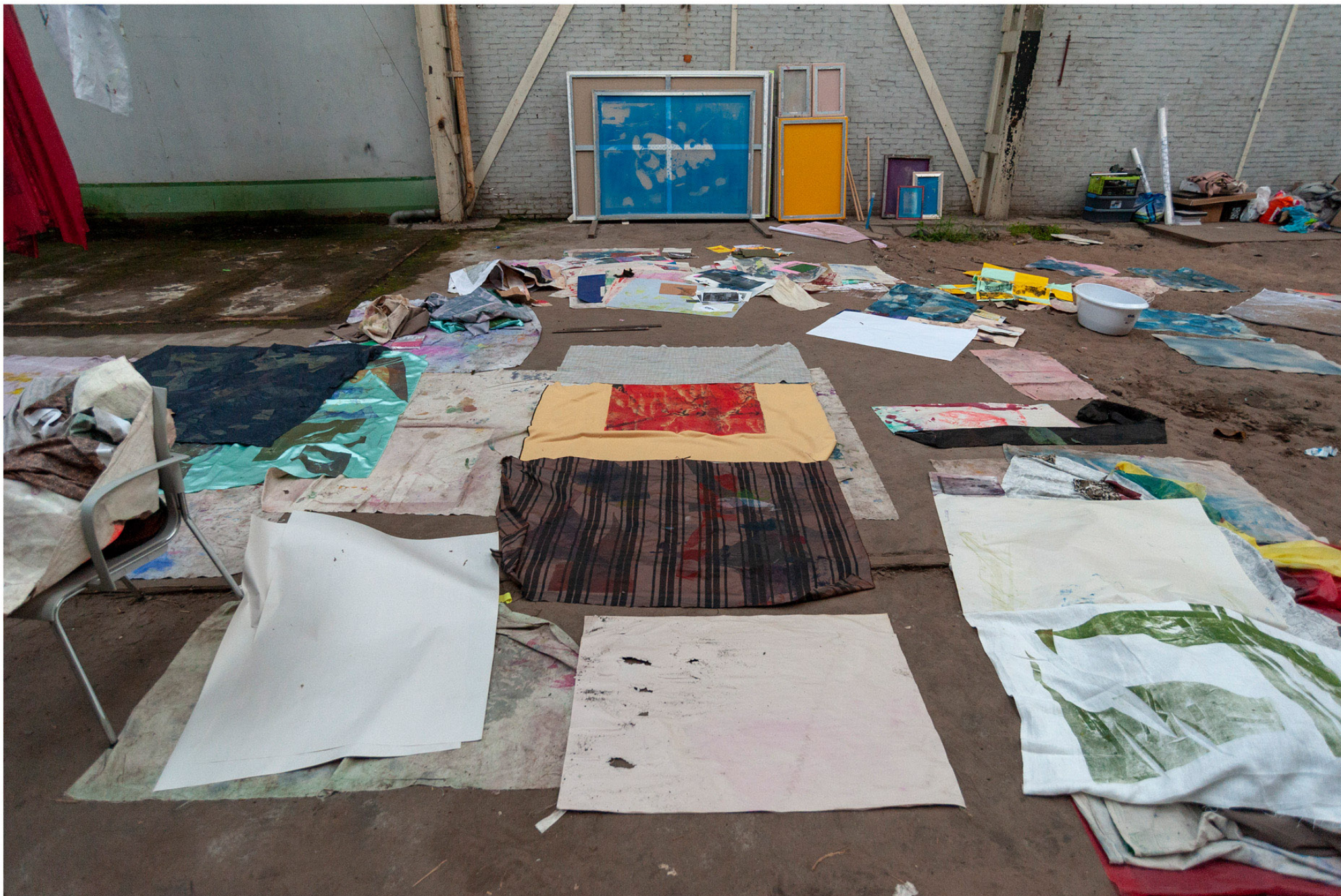
It is part XXI of an ensemble, and this ensemble is no longer necessarily ceremonial, 2021 Backer en Rueb studio