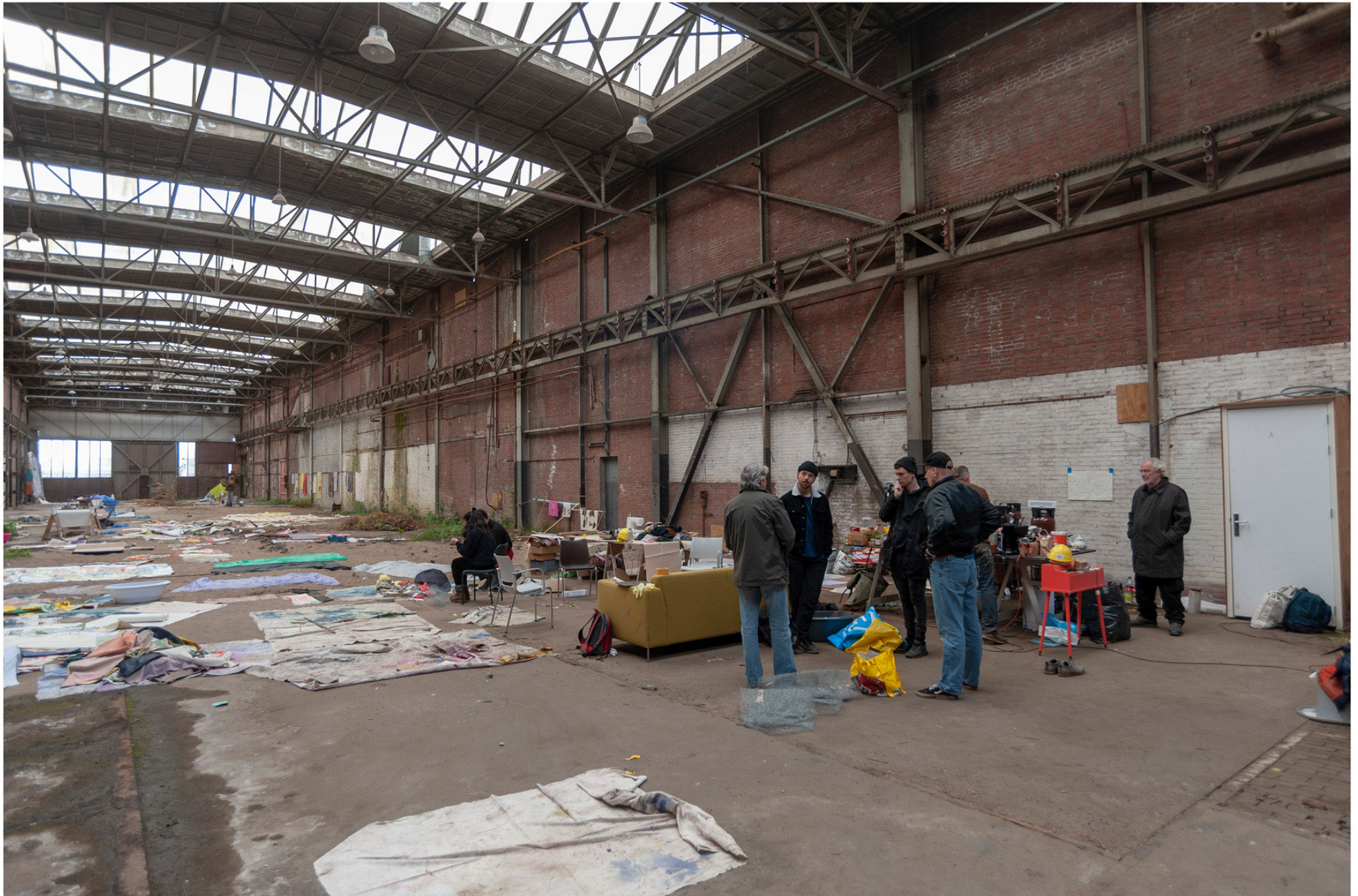
It is part XXI of an ensemble, and this ensemble is no longer necessarily ceremonial, 2021 Backer en Rueb studio