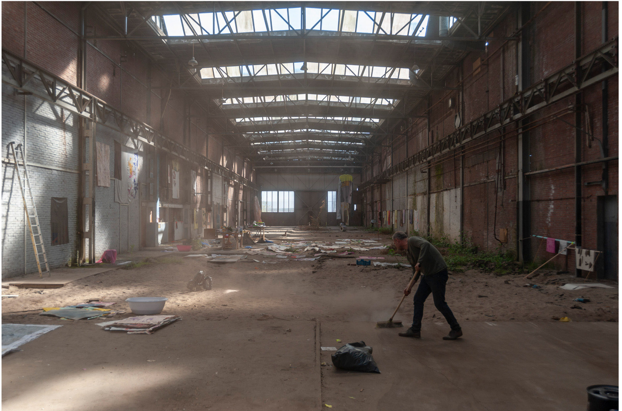
It is part XXI of an ensemble, and this ensemble is no longer necessarily ceremonial, 2021 Backer en Rueb studio