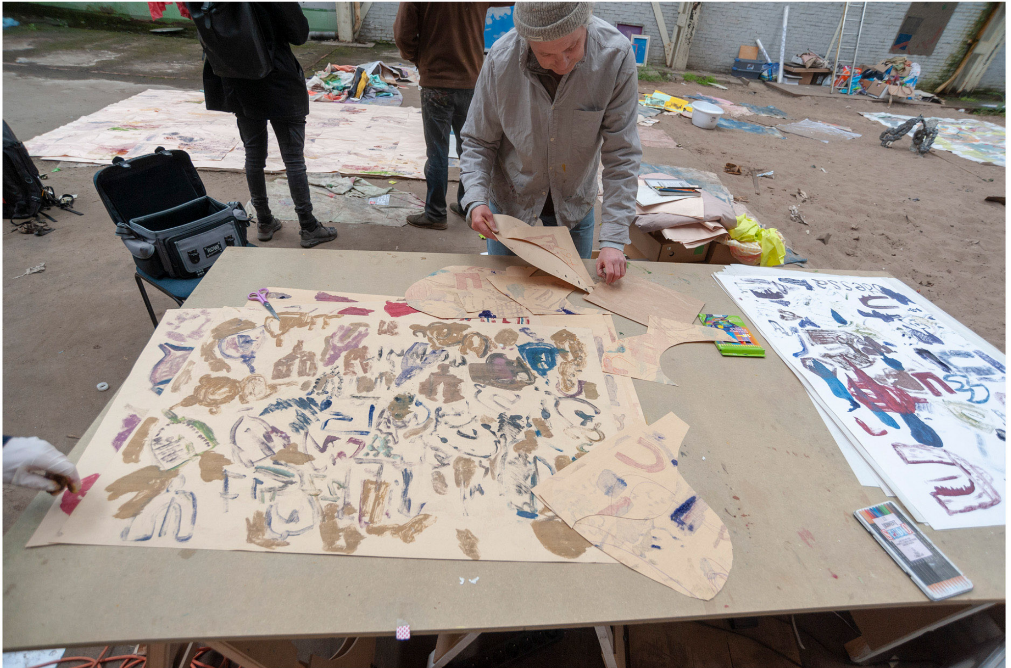
It is part XXI of an ensemble, and this ensemble is no longer necessarily ceremonial, 2021 Backer en Rueb studio