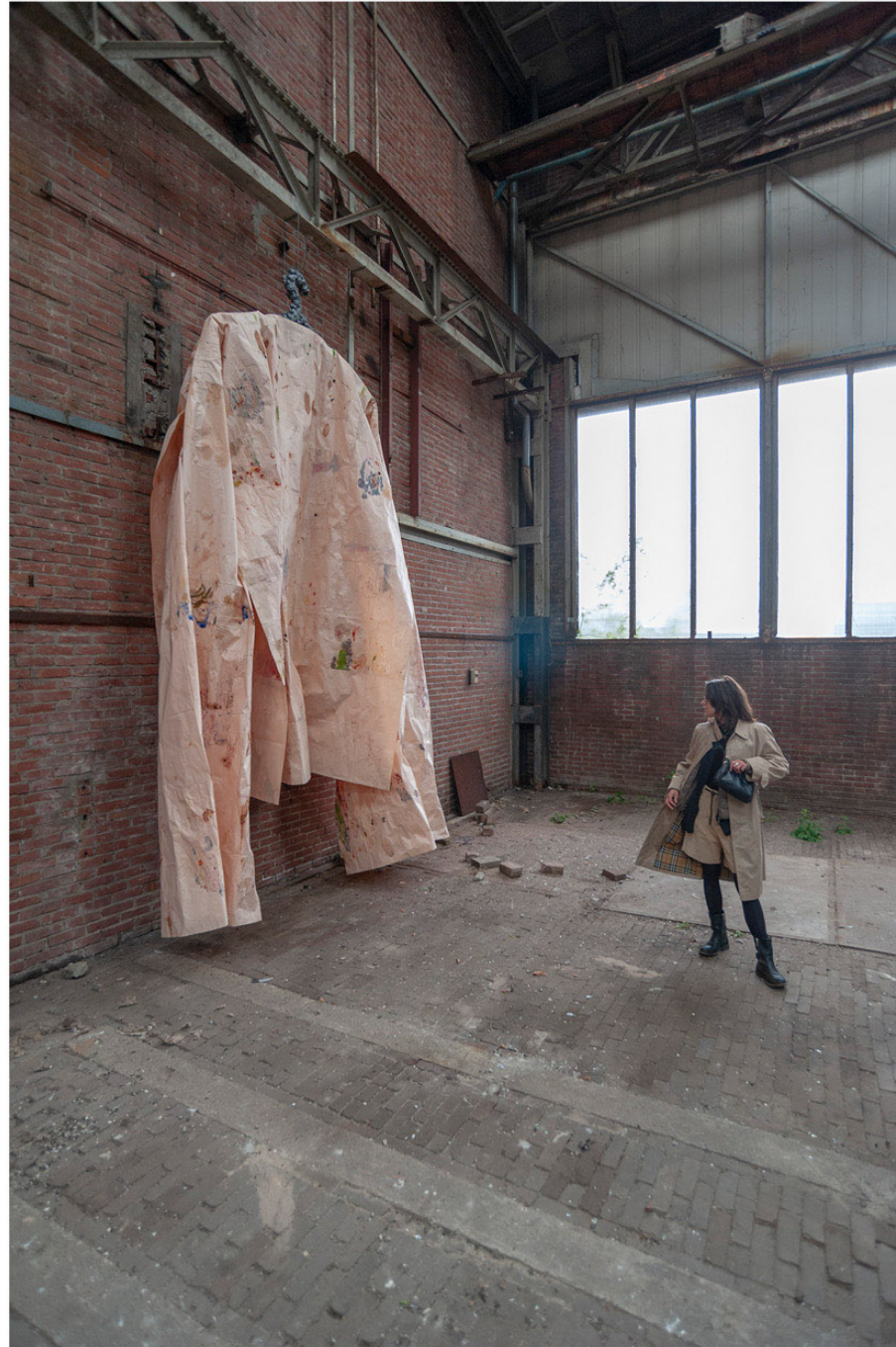
It is part XXI of an ensemble, and this ensemble is no longer necessarily ceremonial, 2021 Backer en Rueb studio