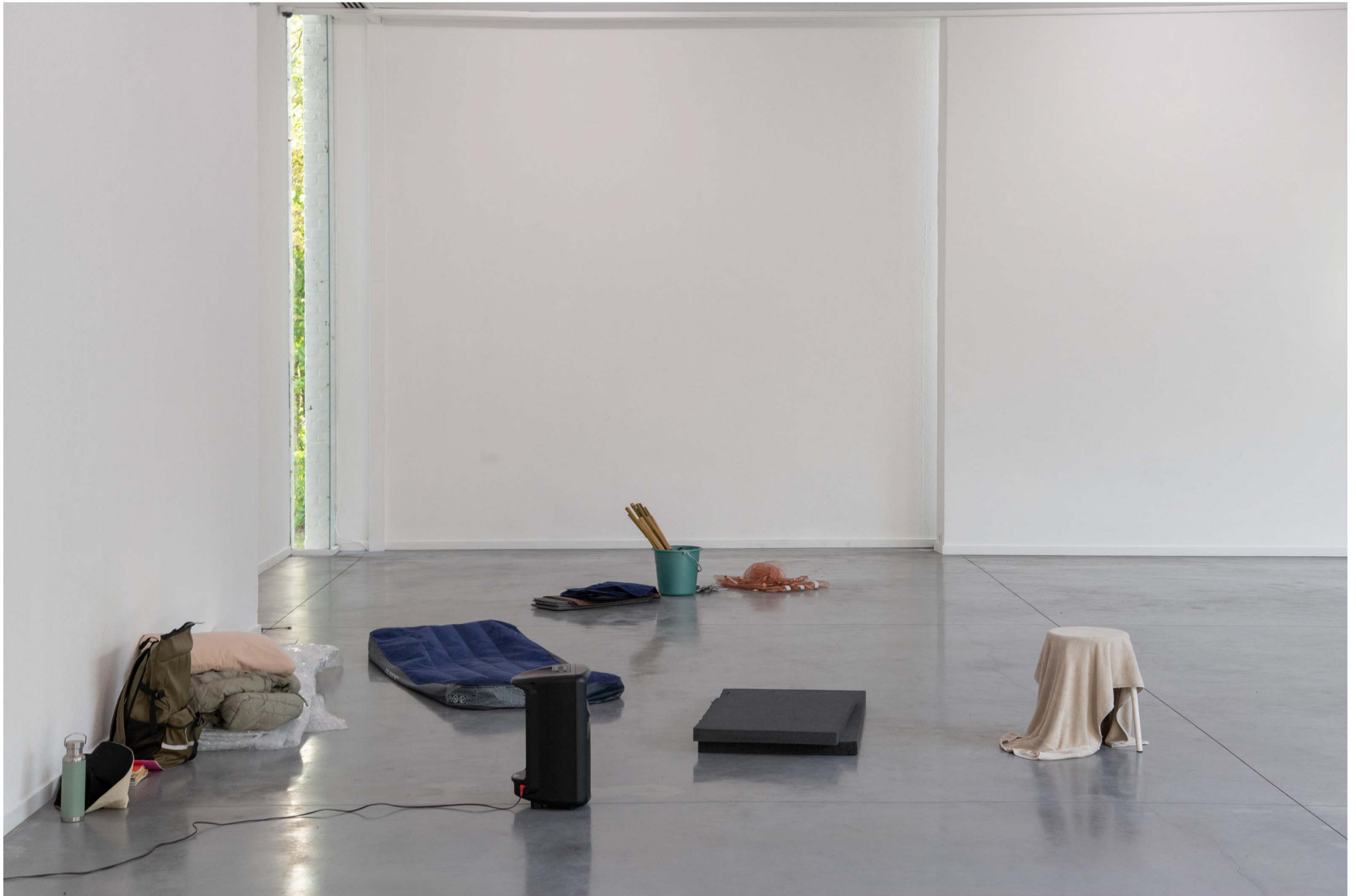
it is part XLII of an assemblage or: the art of noticing, 2023 presentation of 'autumn academy', Museum Dhondt-Dhaenens, Sint-Martens Latem