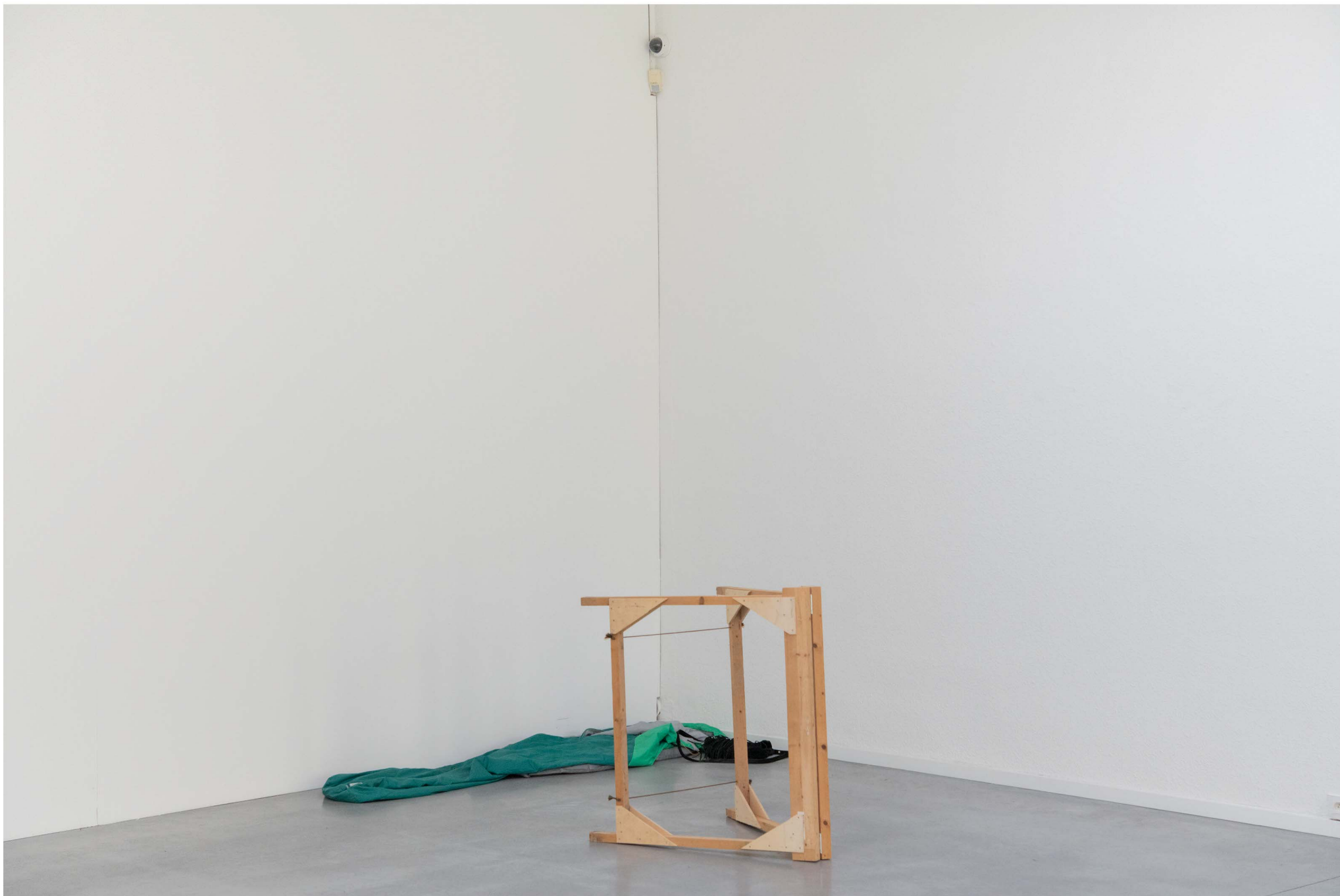
it is part XLII of an assemblage or: the art of noticing, 2023 presentation of 'autumn academy', Museum Dhondt-Dhaenens, Sint-Martens Latem