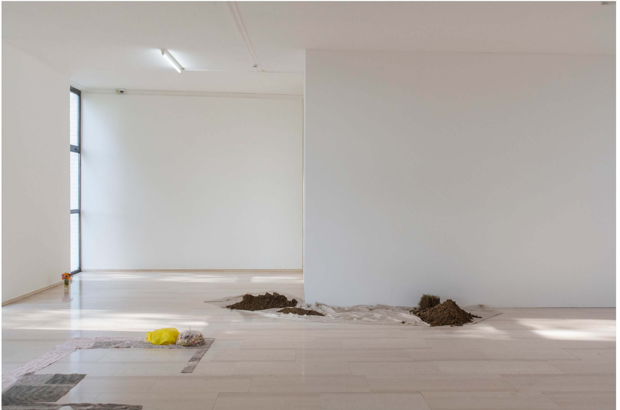
it is part XLII of an assemblage or: the art of noticing, 2023 presentation of 'autumn academy', Museum Dhondt-Dhaenens, Sint-Martens Latem