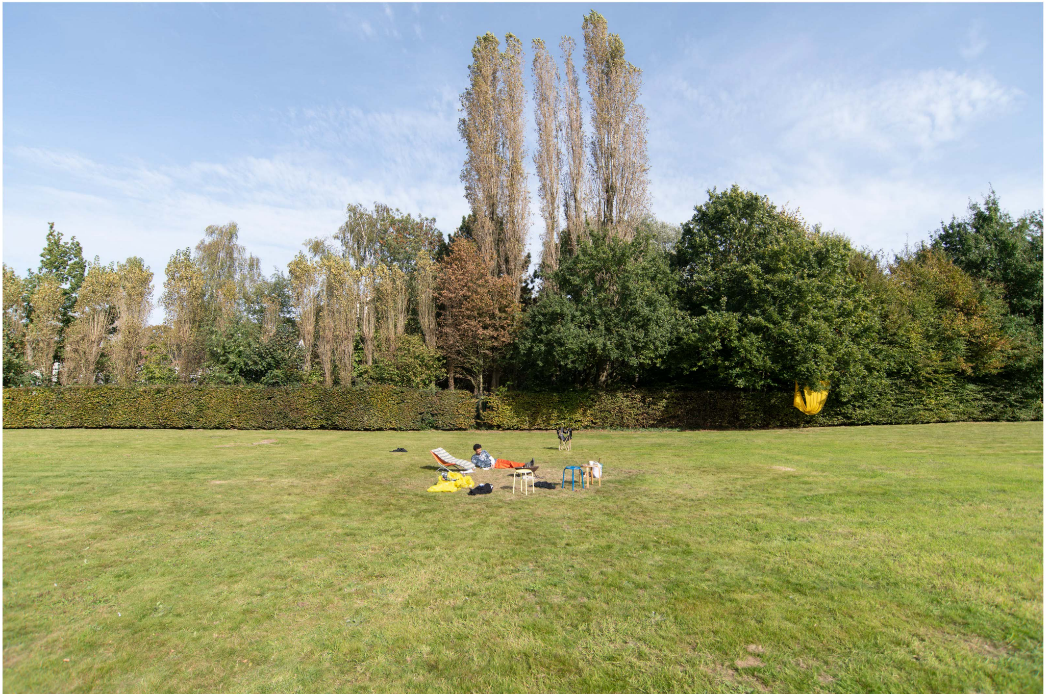
it is part XLII of an assemblage or: the art of noticing, 2023 presentation of 'autumn academy', Museum Dhondt-Dhaenens, Sint-Martens Latem