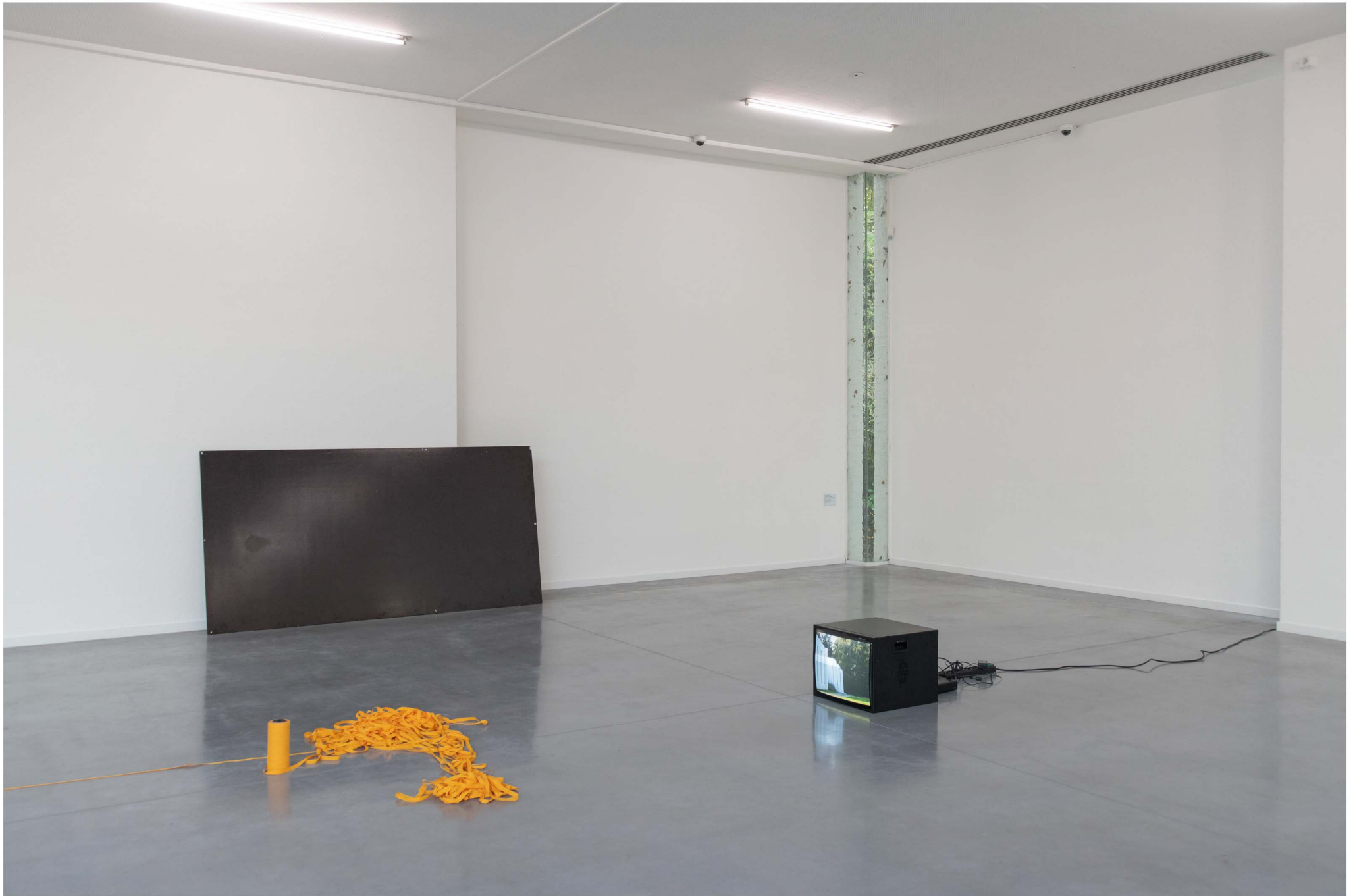
it is part XLII of an assemblage or: the art of noticing, 2023 presentation of 'autumn academy', Museum Dhondt-Dhaenens, Sint-Martens Latem