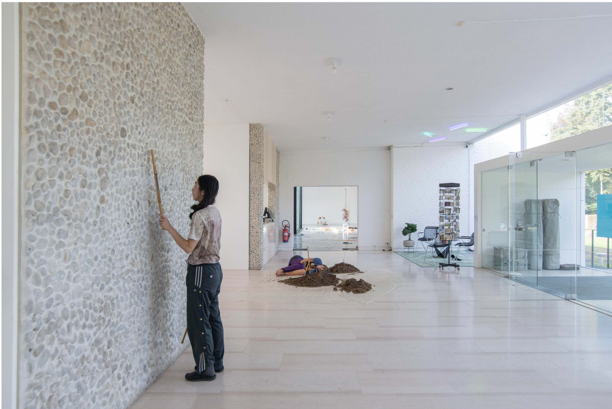
it is part XLII of an assemblage or: the art of noticing, 2023 presentation of 'autumn academy', Museum Dhondt-Dhaenens, Sint-Martens Latem