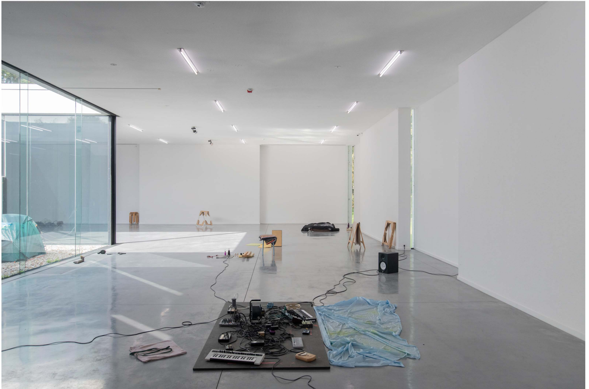
it is part XLII of an assemblage or: the art of noticing, 2023 presentation of 'autumn academy', Museum Dhondt-Dhaenens, Sint-Martens Latem