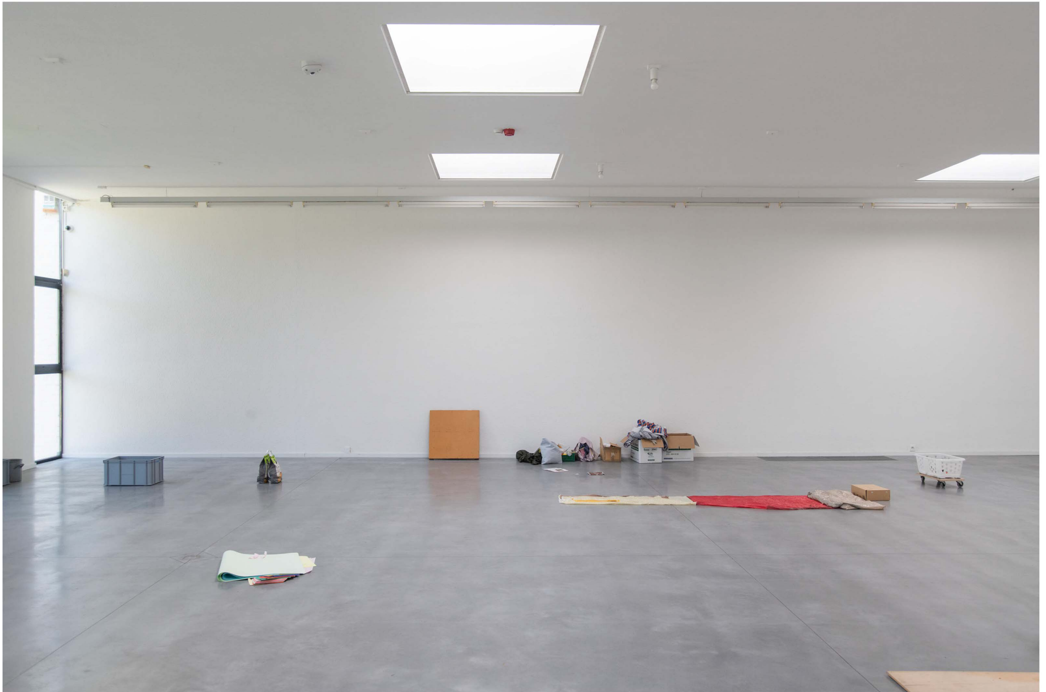
it is part XLII of an assemblage or: the art of noticing, 2023 presentation of 'autumn academy', Museum Dhondt-Dhaenens, Sint-Martens Latem