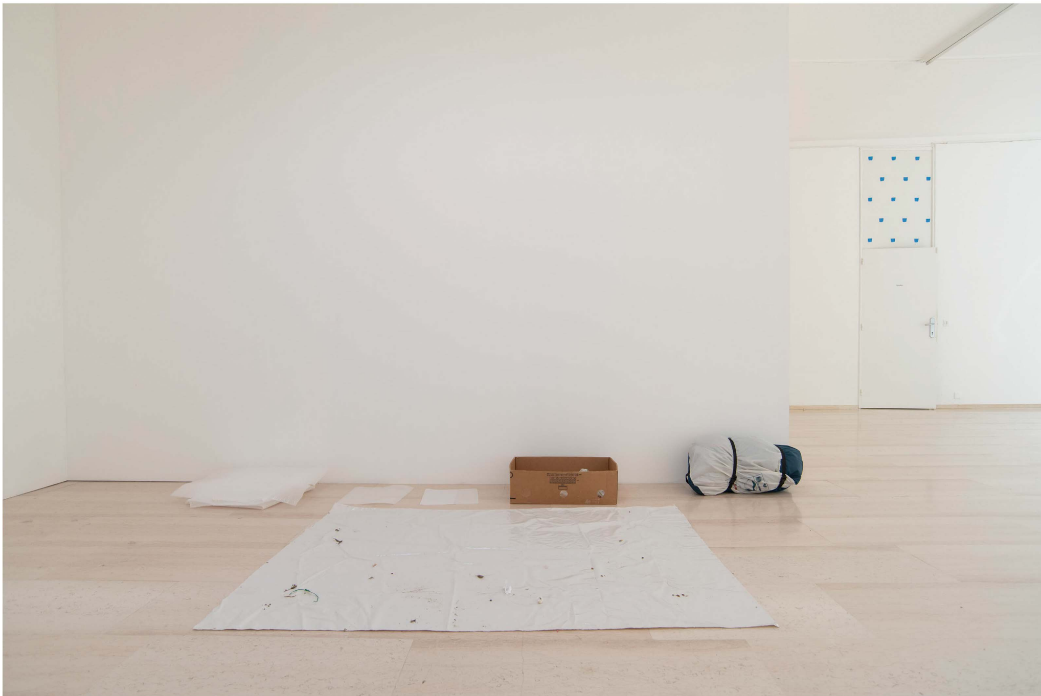
it is part XLII of an assemblage or: the art of noticing, 2023 presentation of 'autumn academy', Museum Dhondt-Dhaenens, Sint-Martens Latem