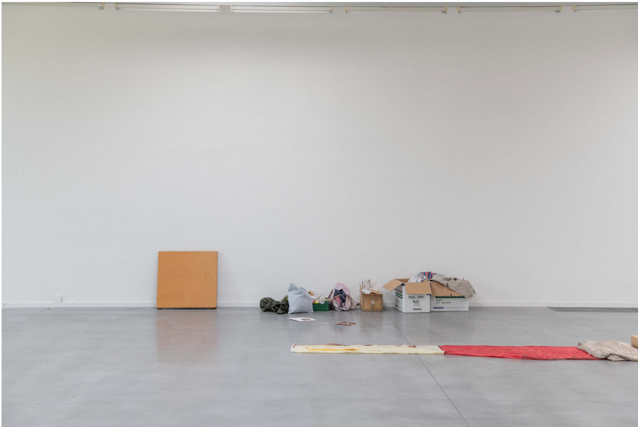
it is part XLII of an assemblage or: the art of noticing, 2023 presentation of 'autumn academy', Museum Dhondt-Dhaenens, Sint-Martens Latem