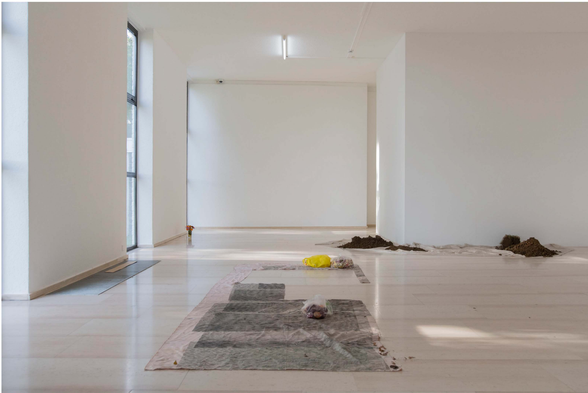
it is part XLII of an assemblage or: the art of noticing, 2023 presentation of 'autumn academy', Museum Dhondt-Dhaenens, Sint-Martens Latem