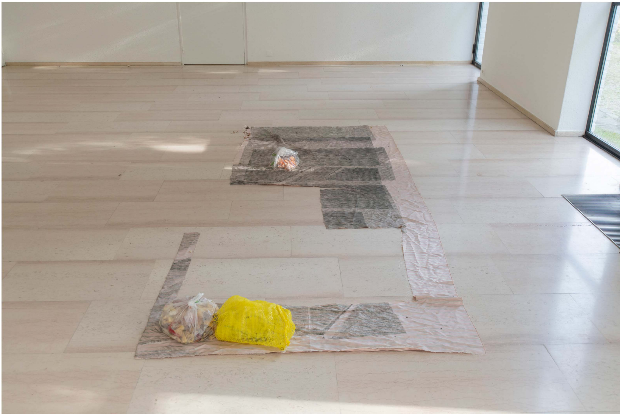
it is part XLII of an assemblage or: the art of noticing, 2023 presentation of 'autumn academy', Museum Dhondt-Dhaenens, Sint-Martens Latem