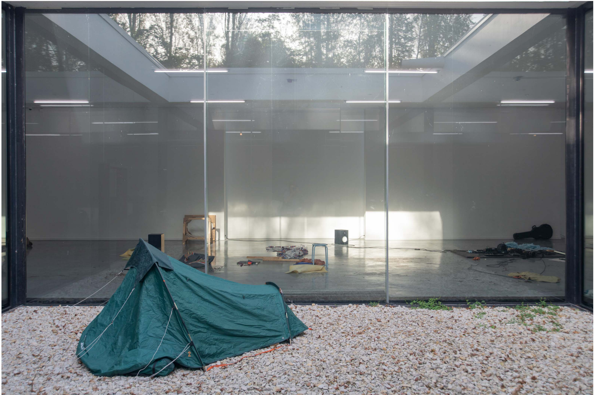
it is part XLII of an assemblage or: the art of noticing, 2023 presentation of 'autumn academy', Museum Dhondt-Dhaenens, Sint-Martens Latem