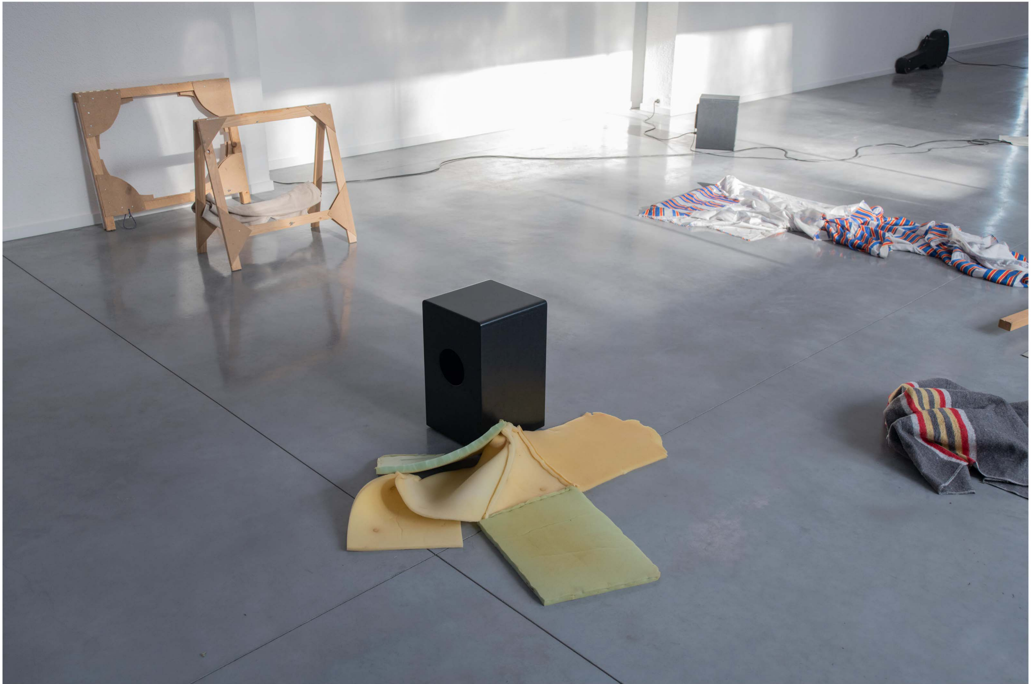
it is part XLII of an assemblage or: the art of noticing, 2023 presentation of 'autumn academy', Museum Dhondt-Dhaenens, Sint-Martens Latem