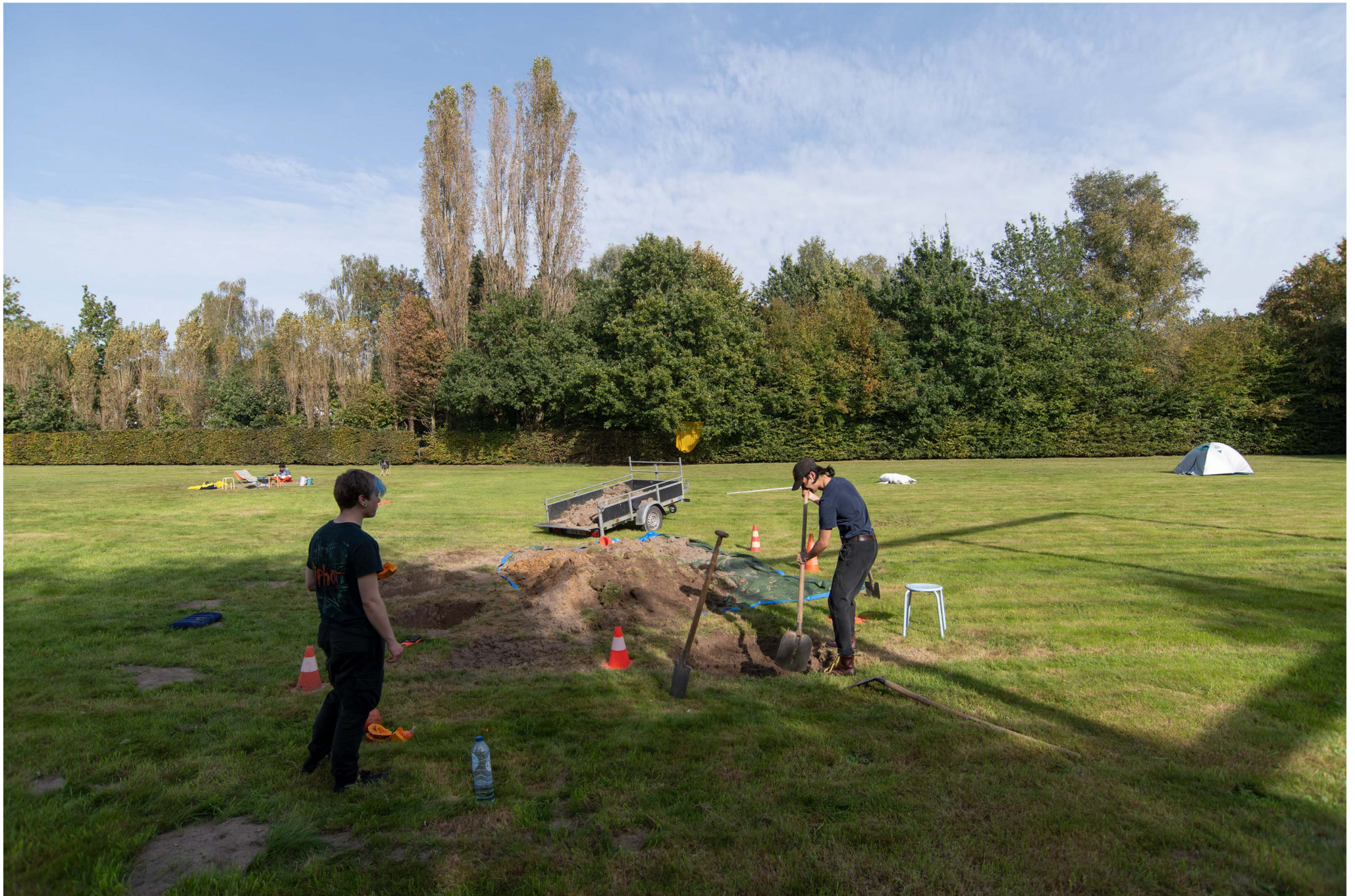
it is part XLII of an assemblage or: the art of noticing, 2023 presentation of 'autumn academy', Museum Dhondt-Dhaenens, Sint-Martens Latem