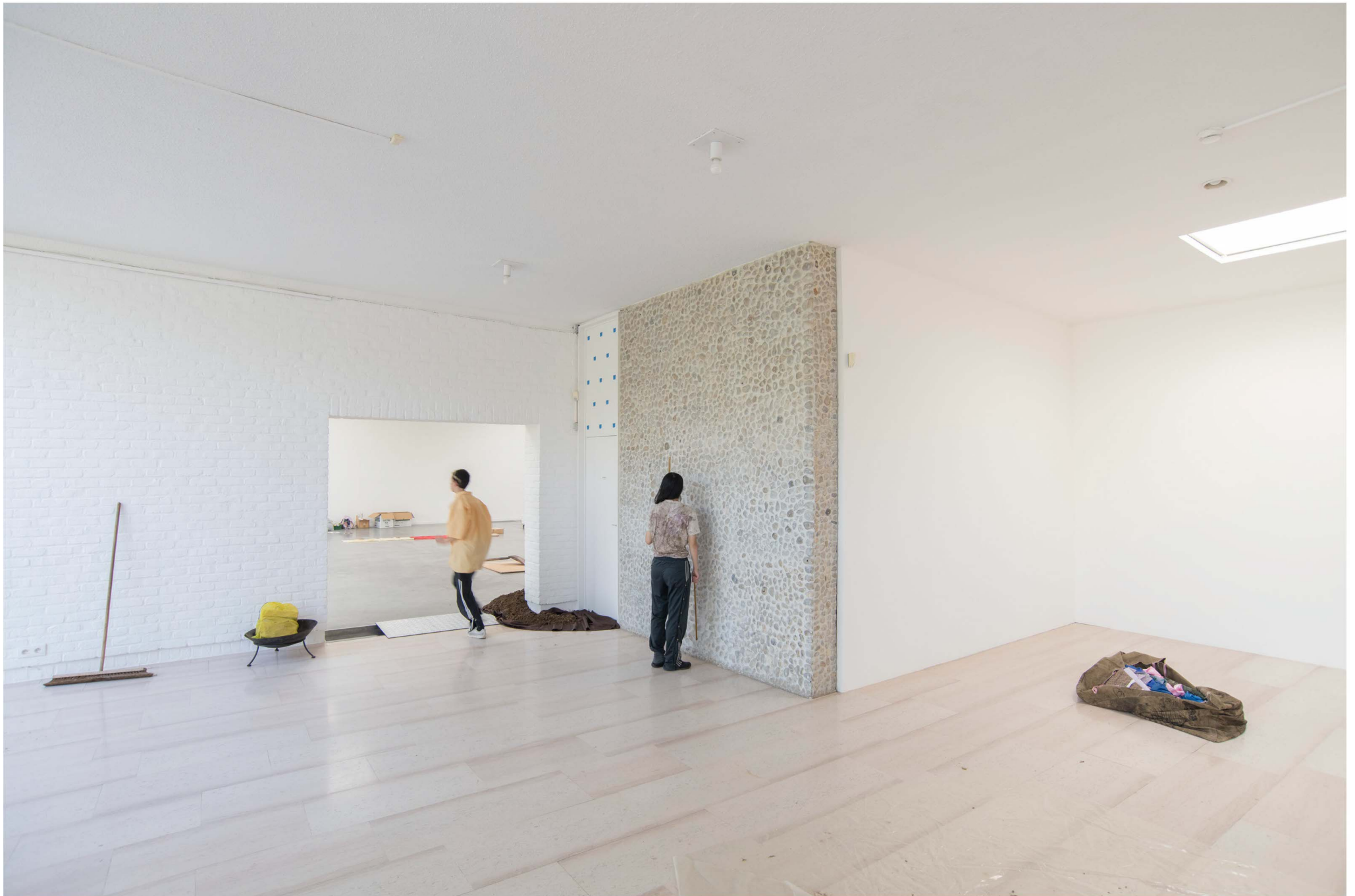
it is part XLII of an assemblage or: the art of noticing, 2023 presentation of 'autumn academy', Museum Dhondt-Dhaenens, Sint-Martens Latem