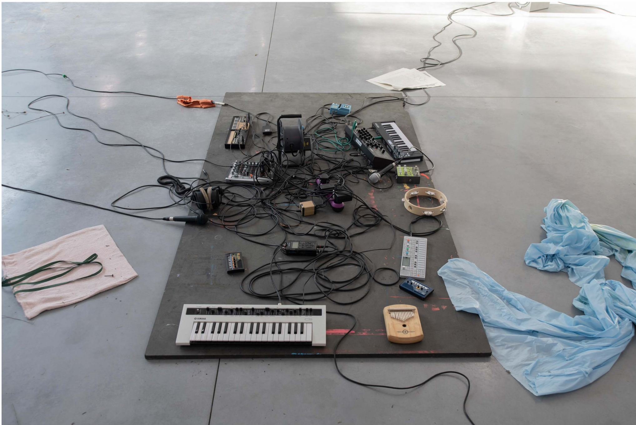
it is part XLII of an assemblage or: the art of noticing, 2023 presentation of 'autumn academy', Museum Dhondt-Dhaenens, Sint-Martens Latem