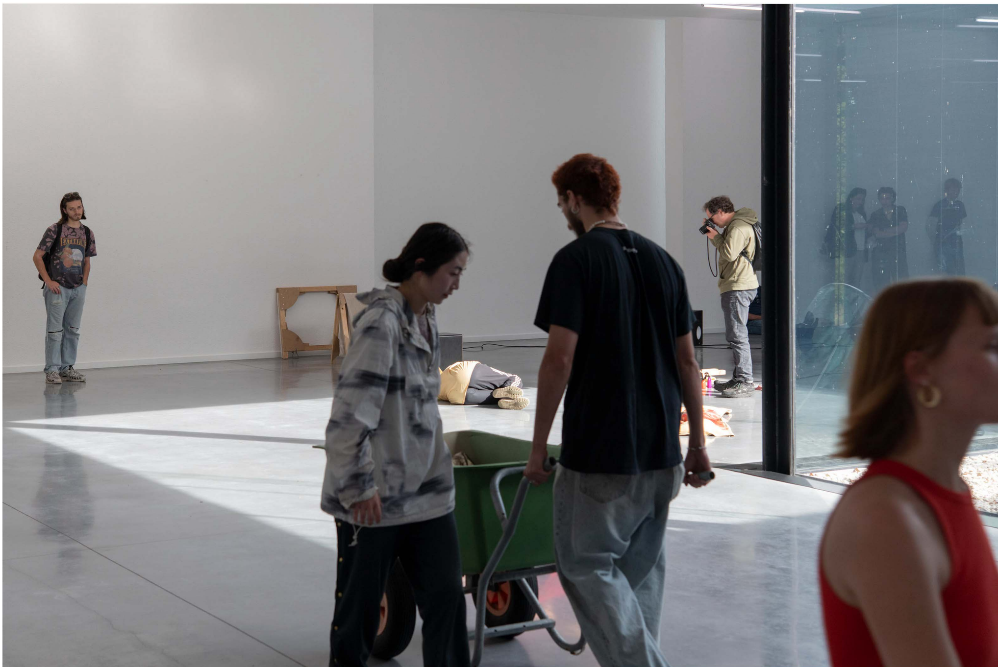
it is part XLII of an assemblage or: the art of noticing, 2023 presentation of 'autumn academy', Museum Dhondt-Dhaenens, Sint-Martens Latem