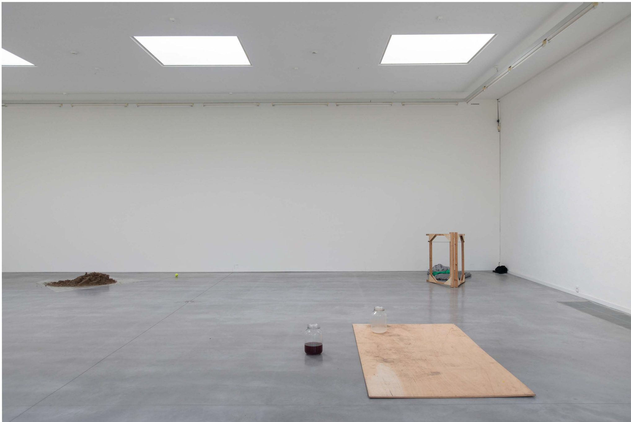
it is part XLII of an assemblage or: the art of noticing, 2023 presentation of 'autumn academy', Museum Dhondt-Dhaenens, Sint-Martens Latem