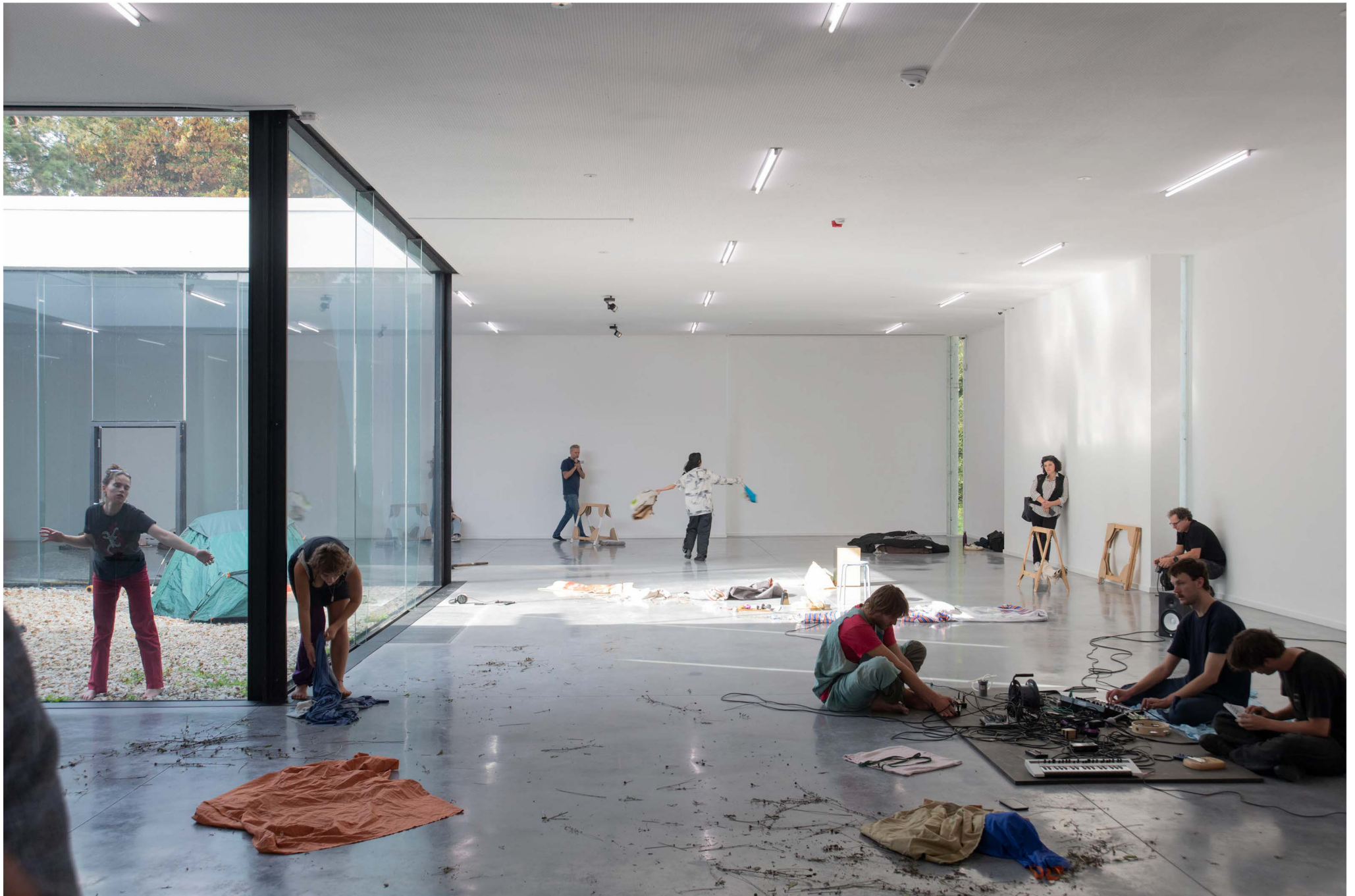
it is part XLII of an assemblage or: the art of noticing, 2023 presentation of 'autumn academy', Museum Dhondt-Dhaenens, Sint-Martens Latem