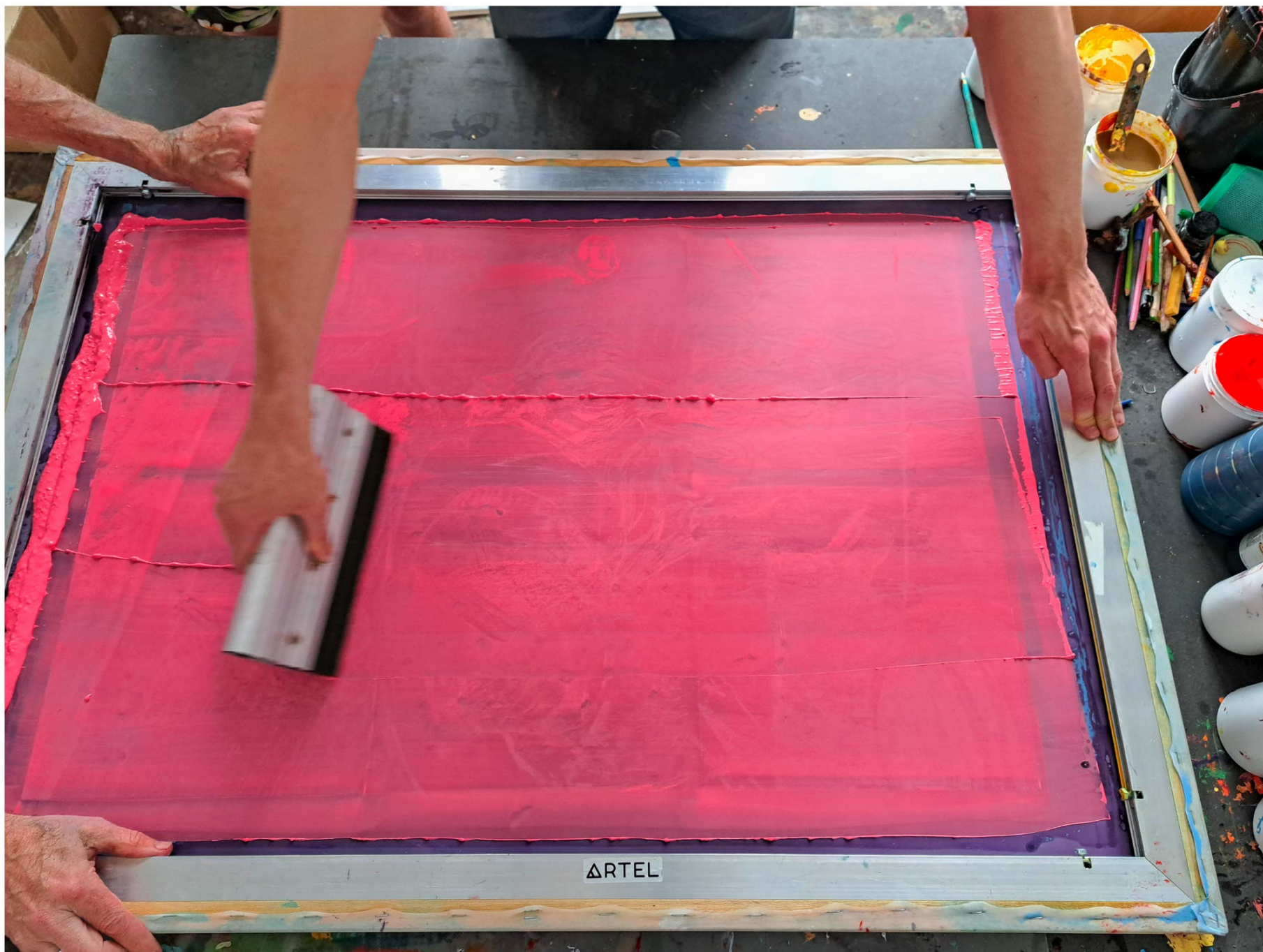
it is part XXXVI najpatta001 or: lust for life, 2023 studio documentation