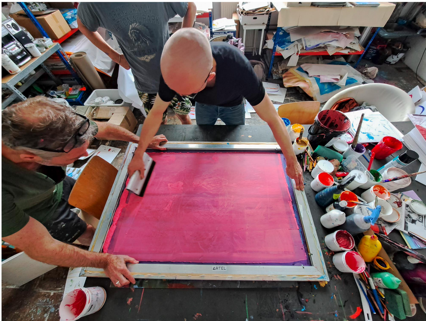
it is part XXXVI naipatta001 or: lust for life, 2023 studio documentation