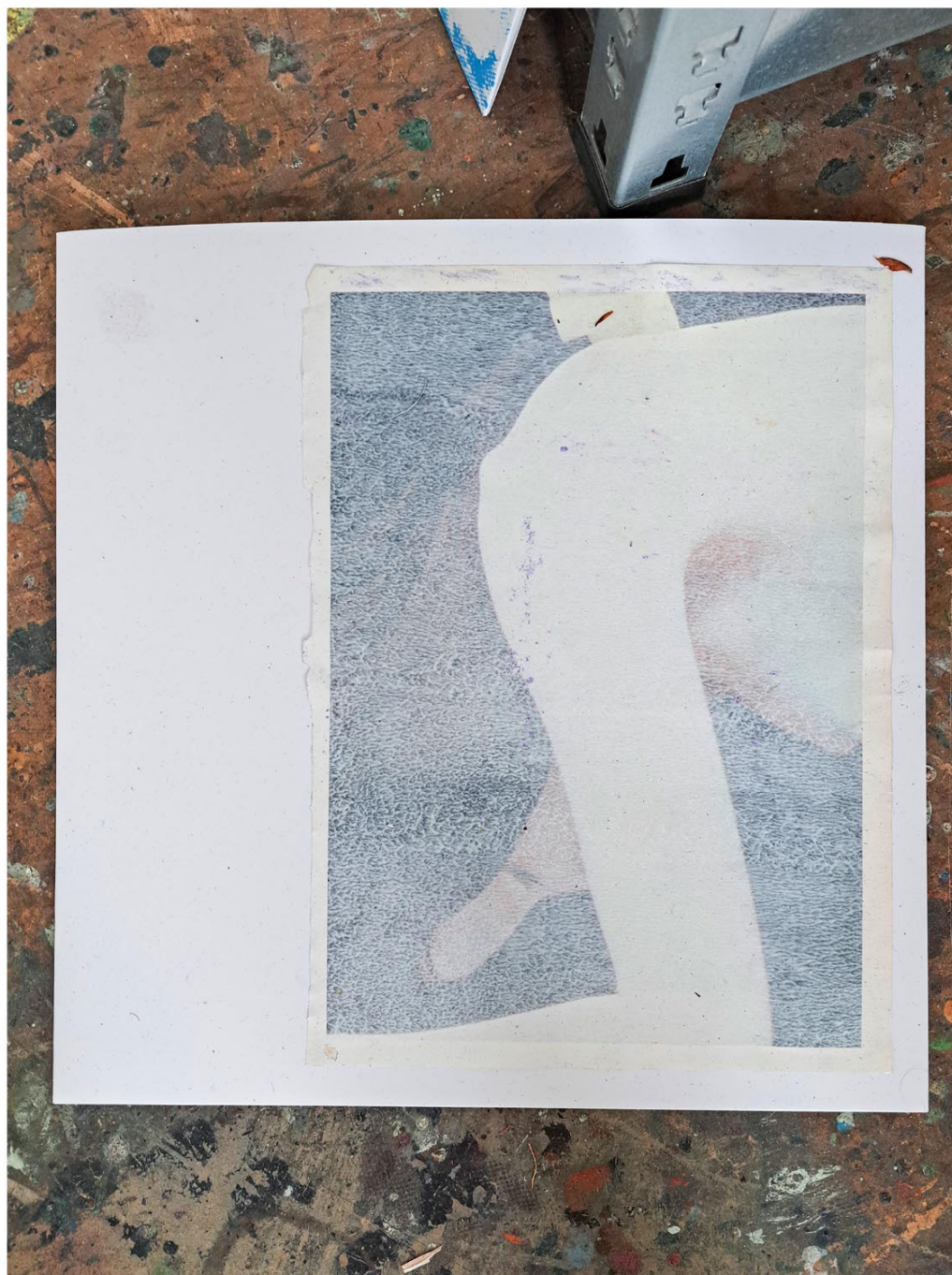
it is part XXXVI najpatta001 or: lust for life, 2023 studio documentation