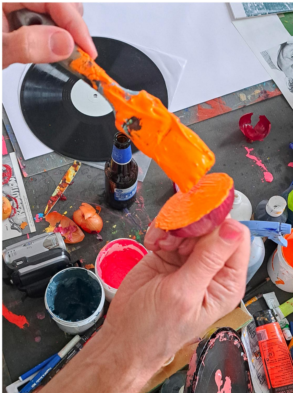
it is part XXXVI naipatta001 or: lust for life, 2023 studio documentation