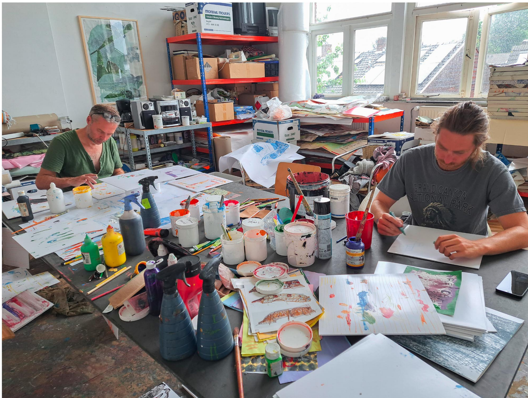
it is part XXXVI najpatta001 or: lust for life, 2023 studio documentation