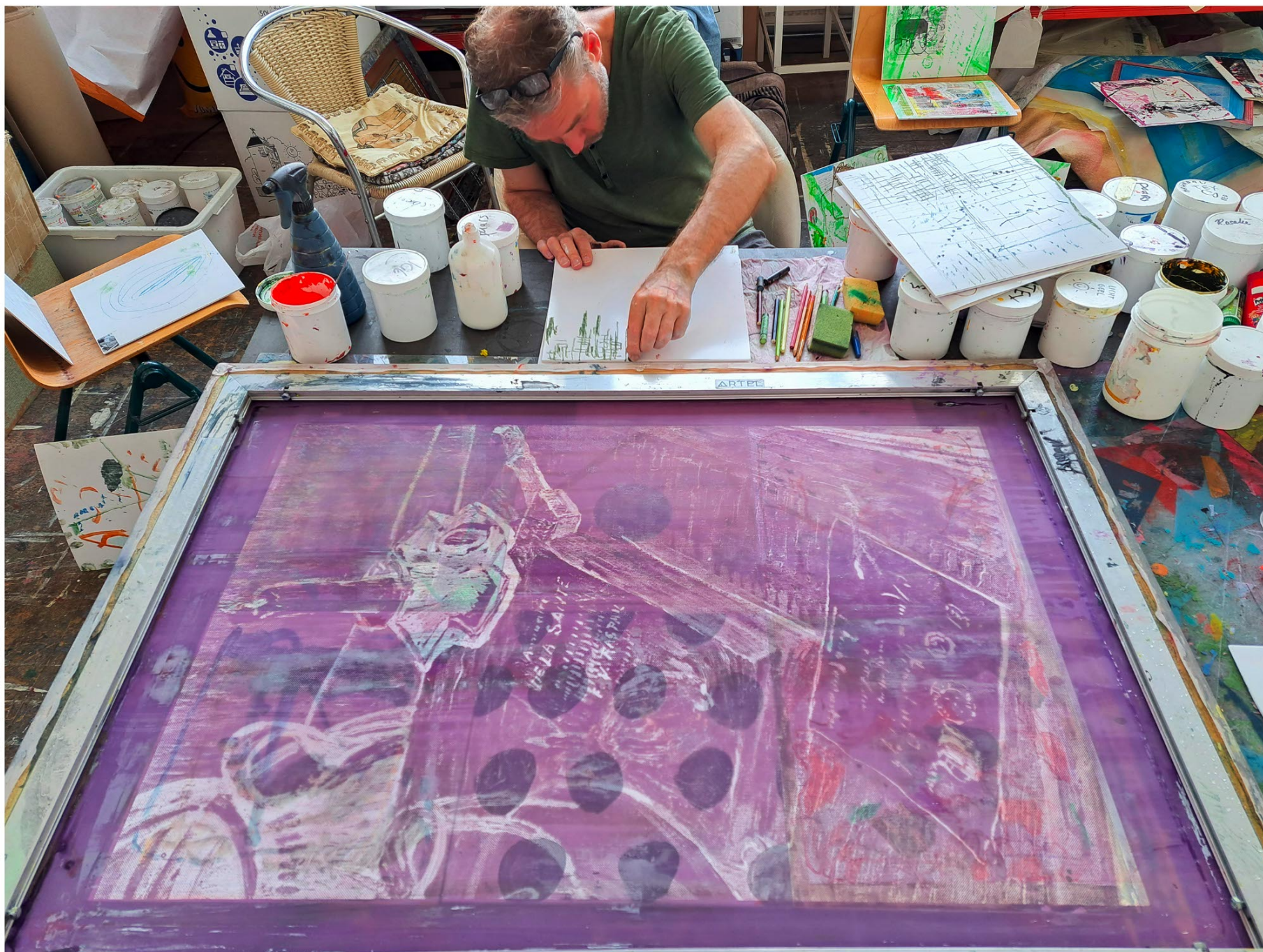
it is part XXXVI naipatta001 or: lust for life, 2023 studio documentation