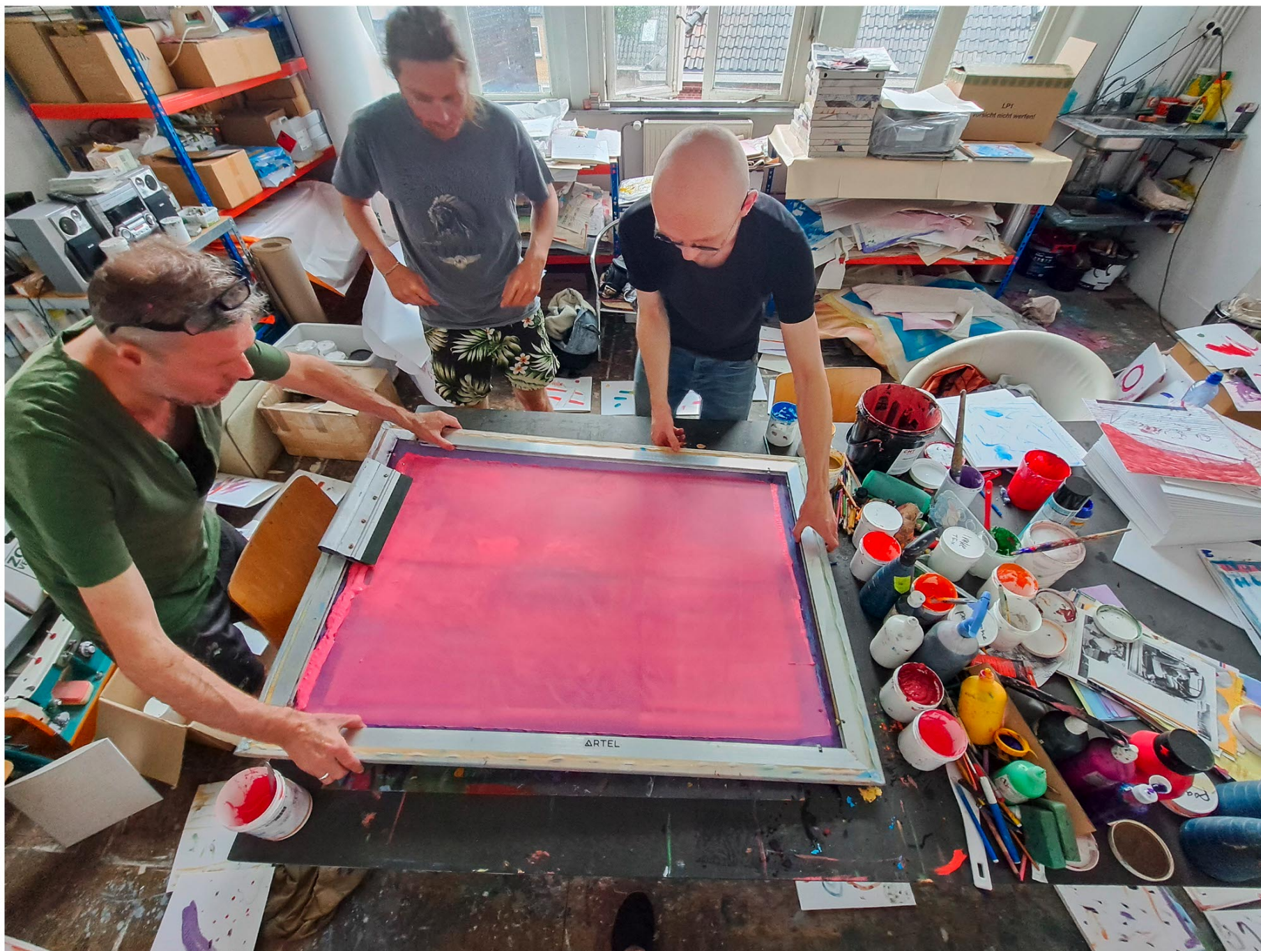
it is part XXXVI najpatta001 or: lust for life, 2023 studio documentation