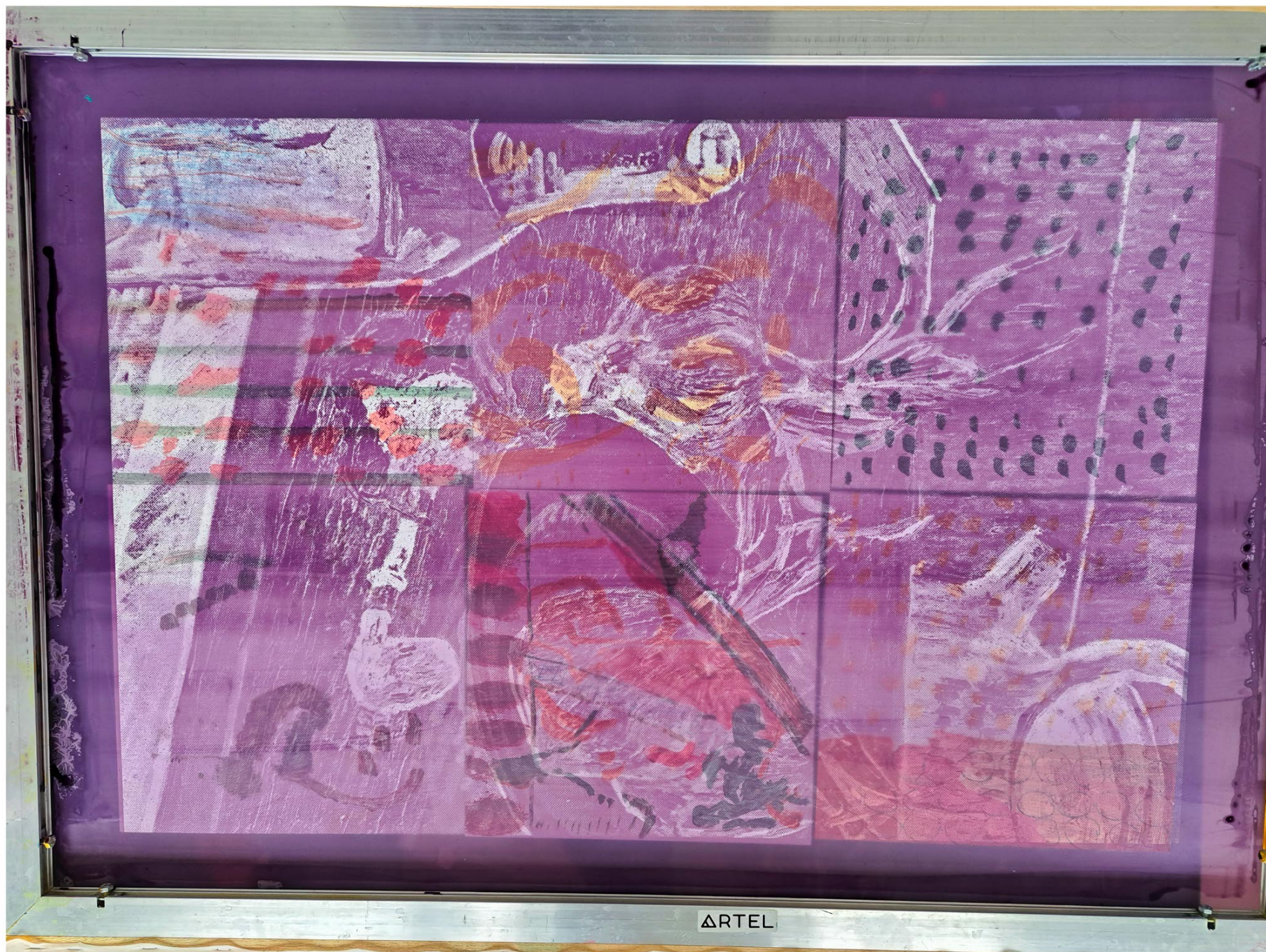
it is part XXXVI najpatta001 or: lust for life, 2023 studio documentation