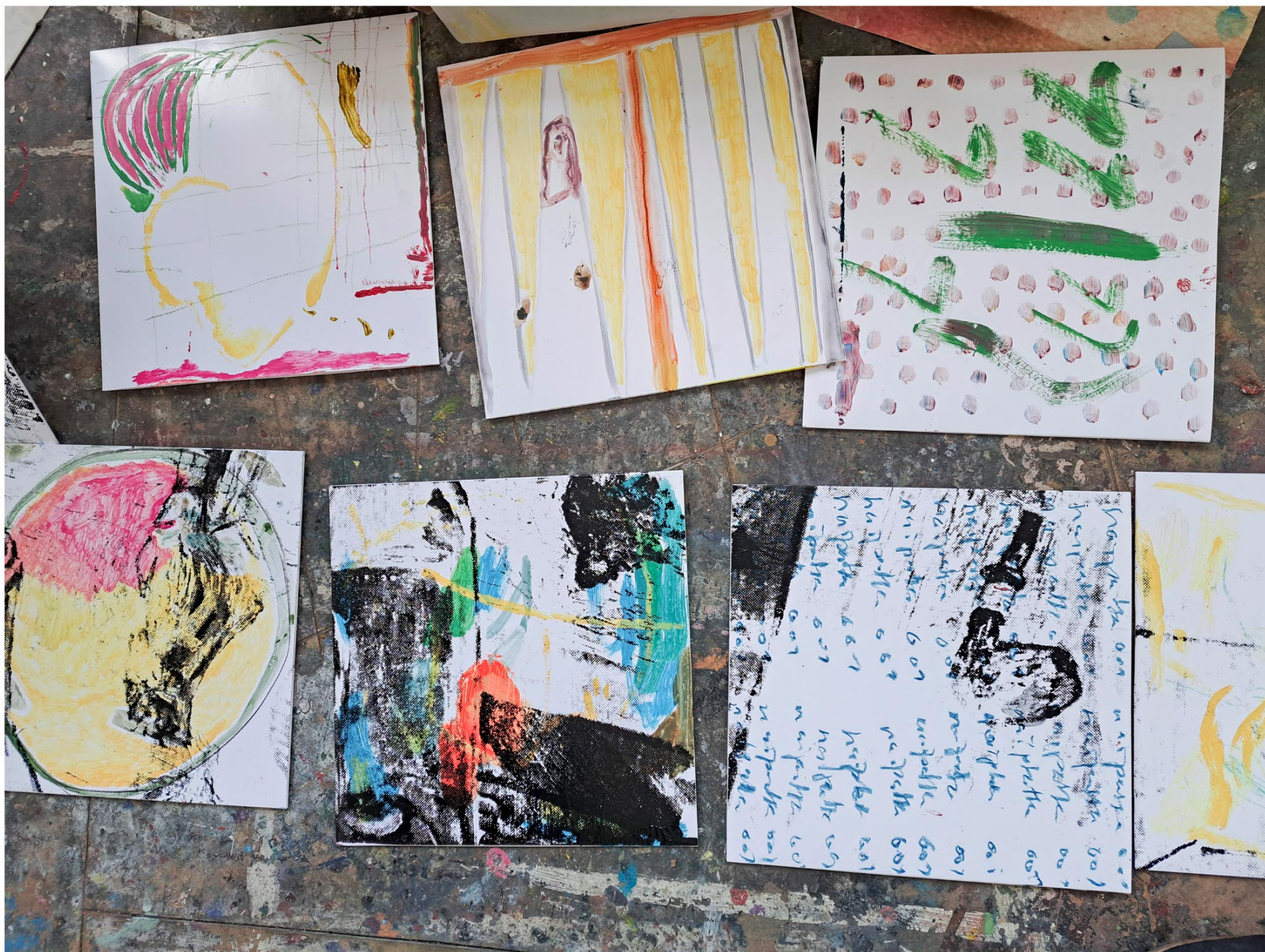
it is part XXXVI najpatta001 or: lust for life, 2023 studio documentation