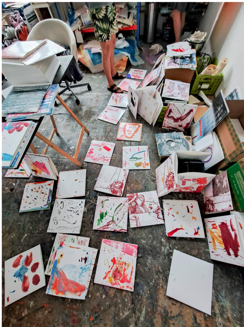
it is part XXXVI naipatta001 or: lust for life, 2023 studio documentation