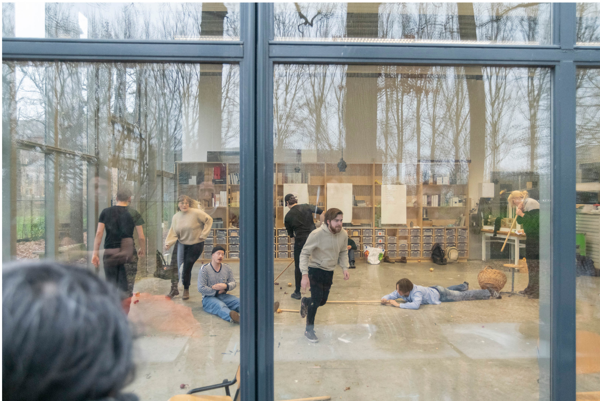
It is part XXVII of an ensemble, and this ensemble is no longer necessarily ceremonial, 2021 workshop AKV St. Joost, Breda