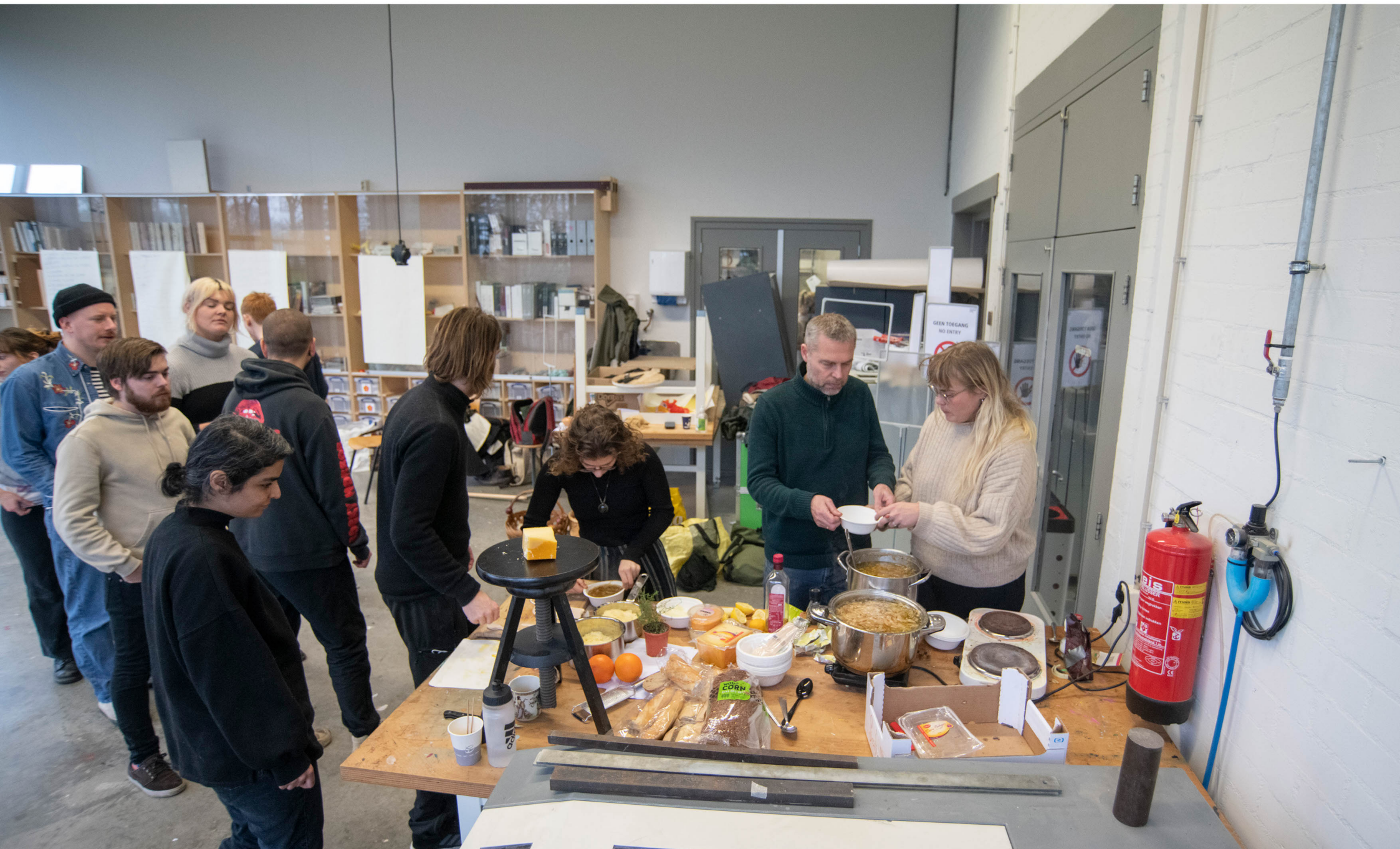
It is part XXVII of an ensemble, and this ensemble is no longer necessarily ceremonial, 2021 workshop AKV St. Joost, Breda