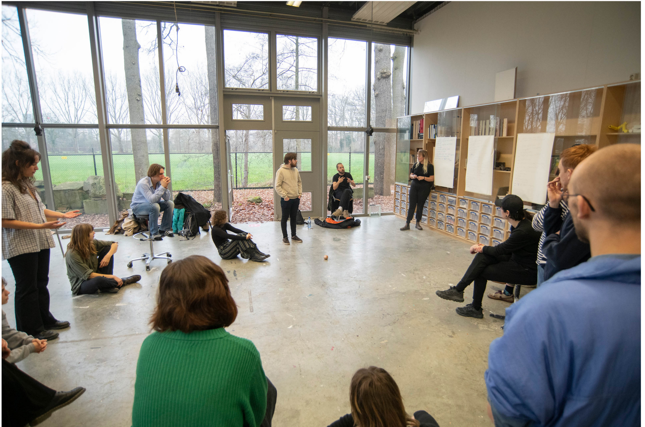
It is part XXVII of an ensemble, and this ensemble is no longer necessarily ceremonial, 2021 workshop AKV St. Joost, Breda