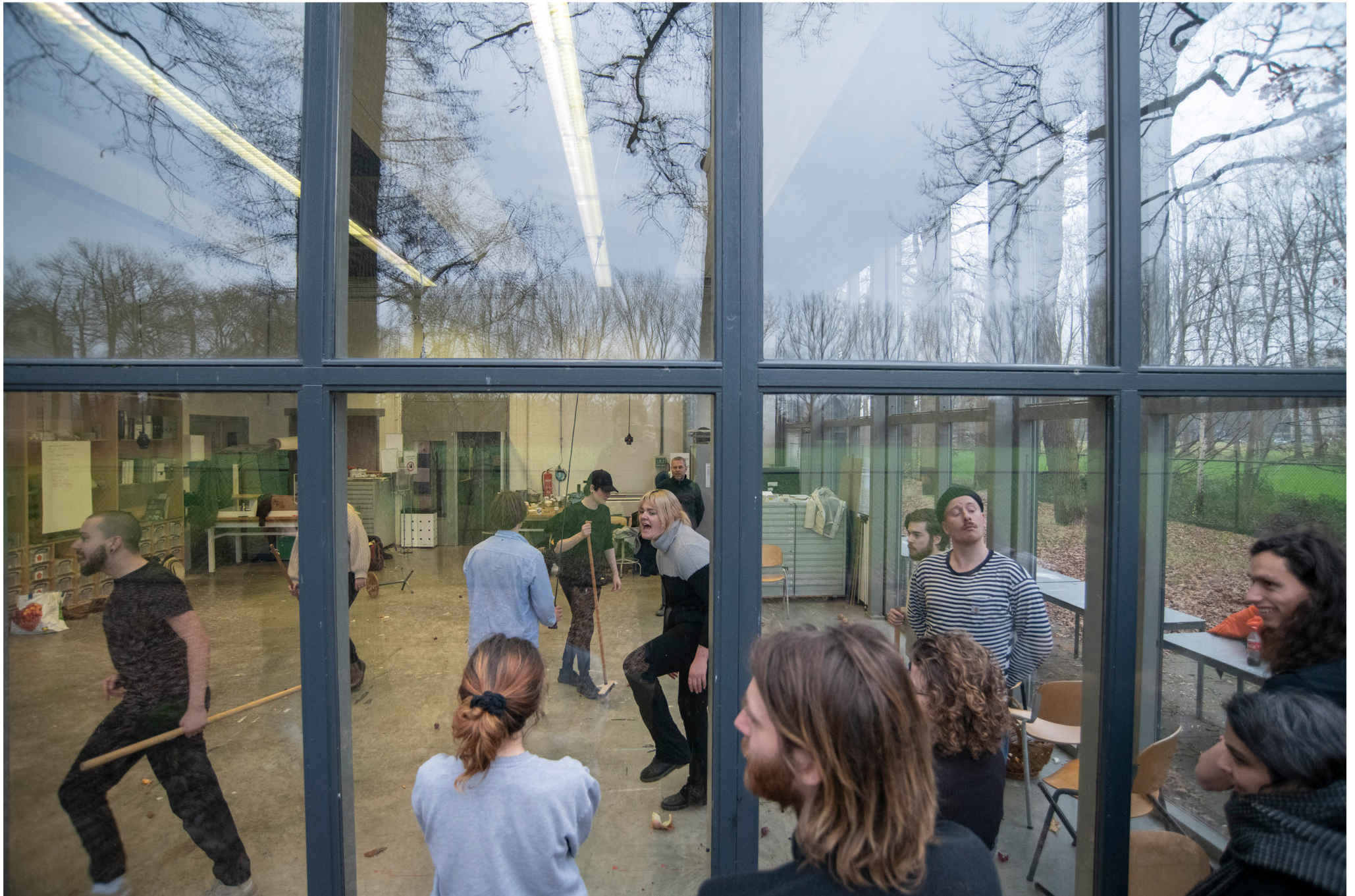
It is part XXVII of an ensemble, and this ensemble is no longer necessarily ceremonial, 2021 workshop AKV St. Joost, Breda