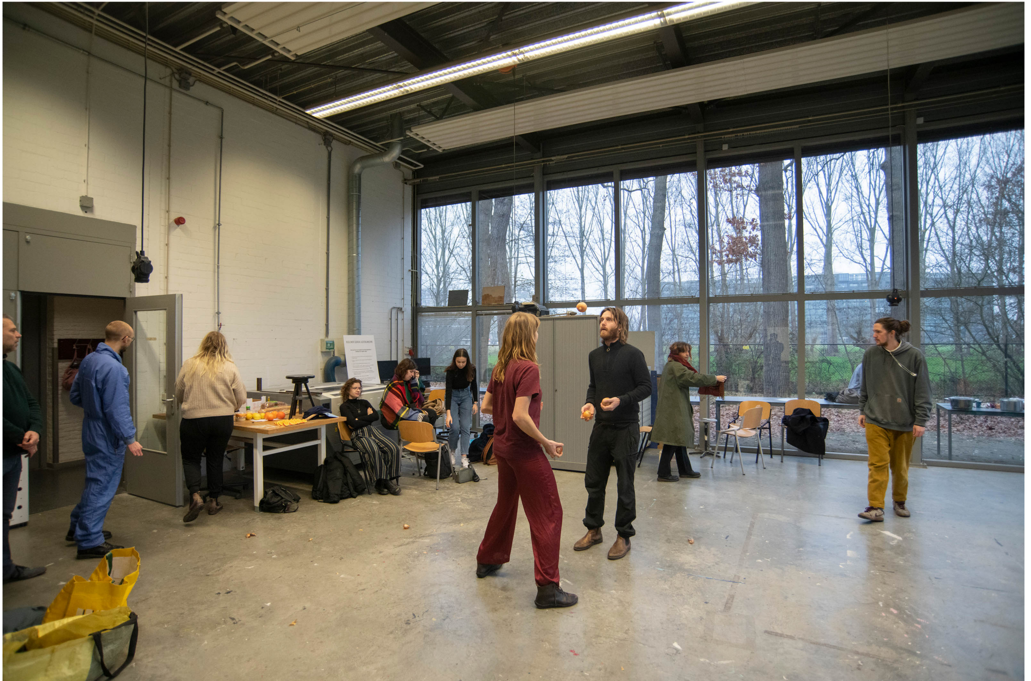
It is part XXVII of an ensemble, and this ensemble is no longer necessarily ceremonial, 2021 workshop AKV St. Joost, Breda