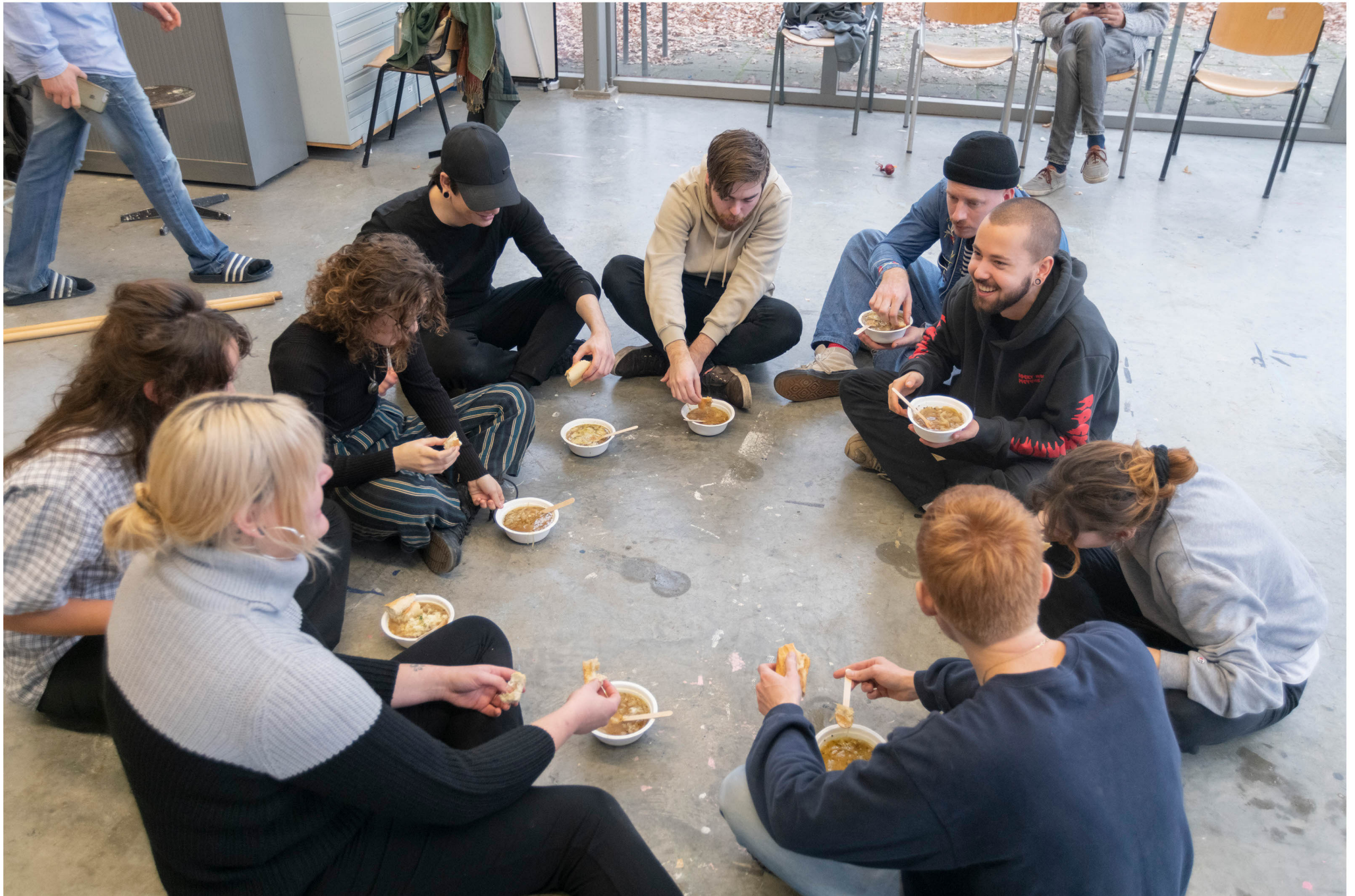
It is part XXVII of an ensemble, and this ensemble is no longer necessarily ceremonial, 2021 workshop AKV St. Joost, Breda