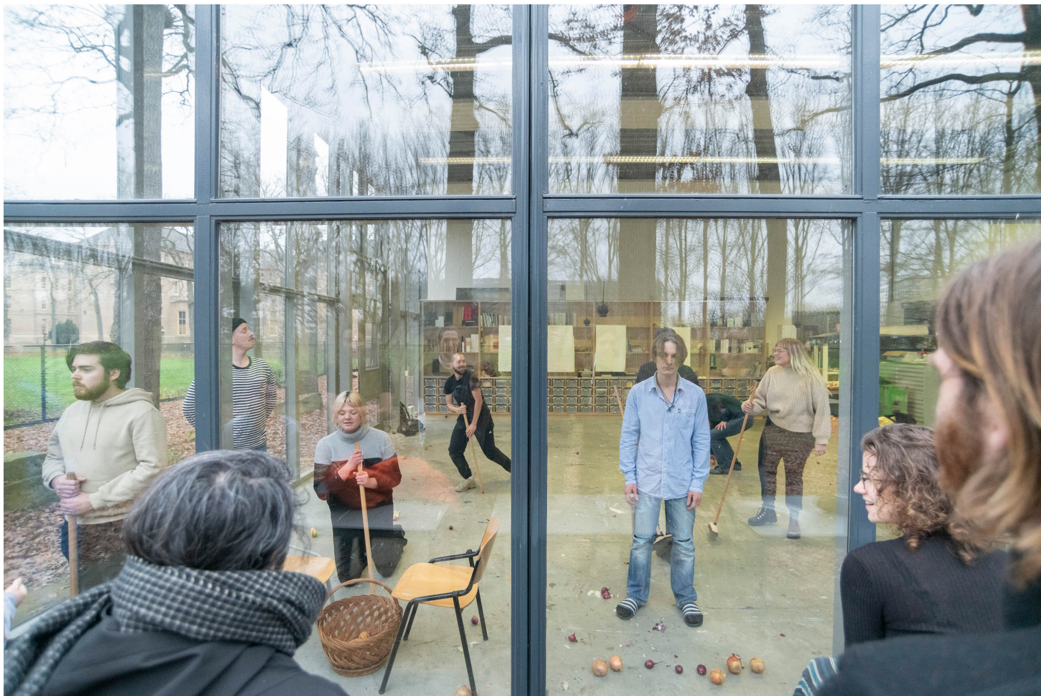
It is part XXVII of an ensemble, and this ensemble is no longer necessarily ceremonial, 2021 workshop AKV St. Joost, Breda