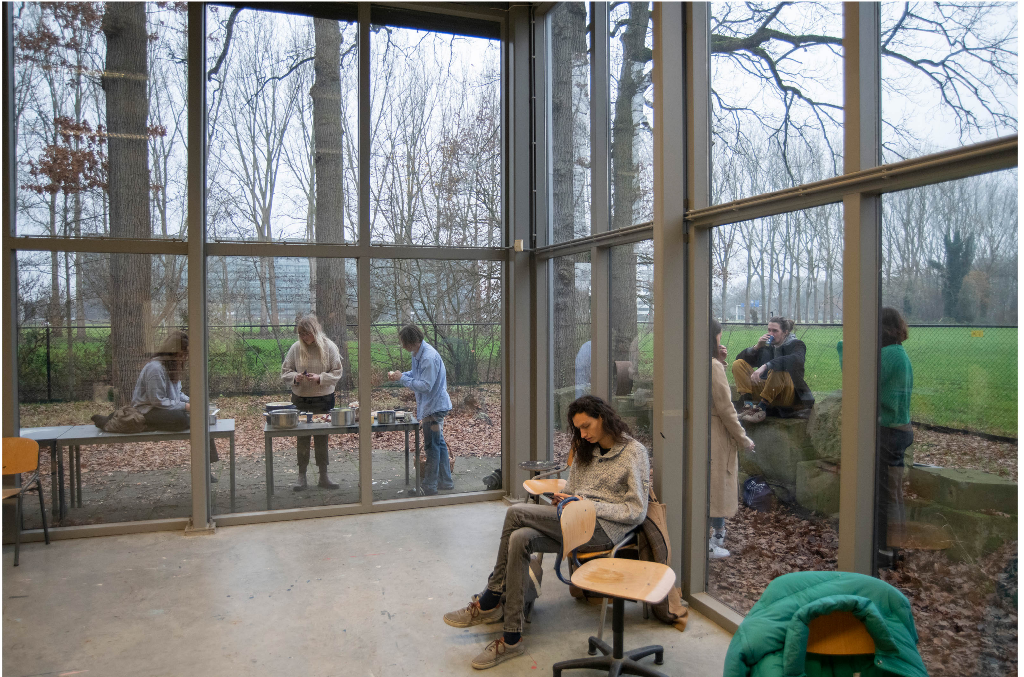
It is part XXVII of an ensemble, and this ensemble is no longer necessarily ceremonial, 2021 workshop AKV St. Joost, Breda