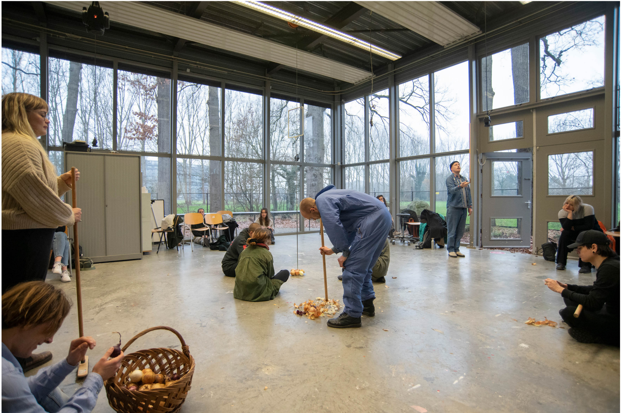
It is part XXVII of an ensemble, and this ensemble is no longer necessarily ceremonial, 2021 workshop AKV St. Joost, Breda