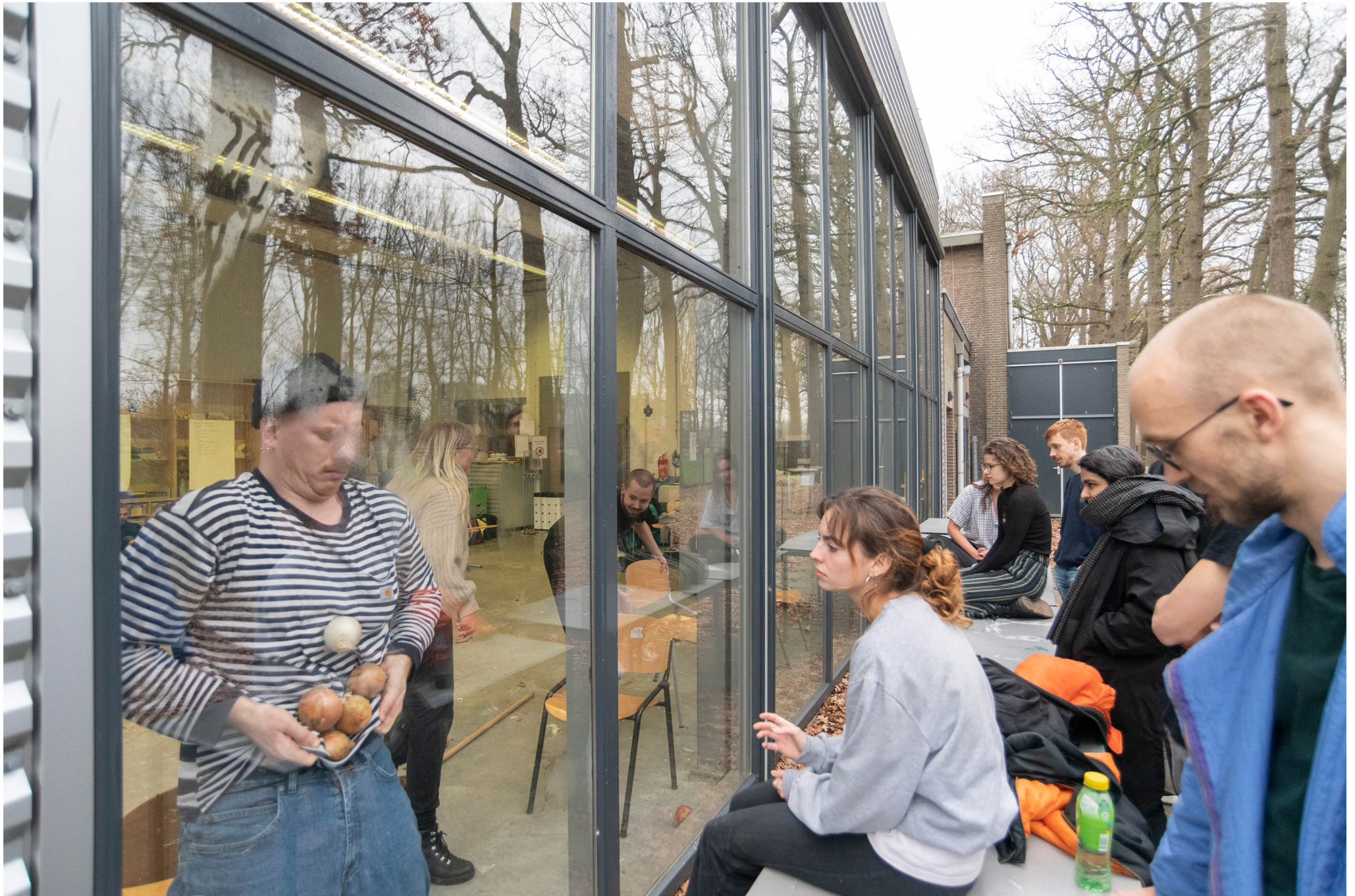
It is part XXVII of an ensemble, and this ensemble is no longer necessarily ceremonial, 2021 workshop AKV St. Joost, Breda