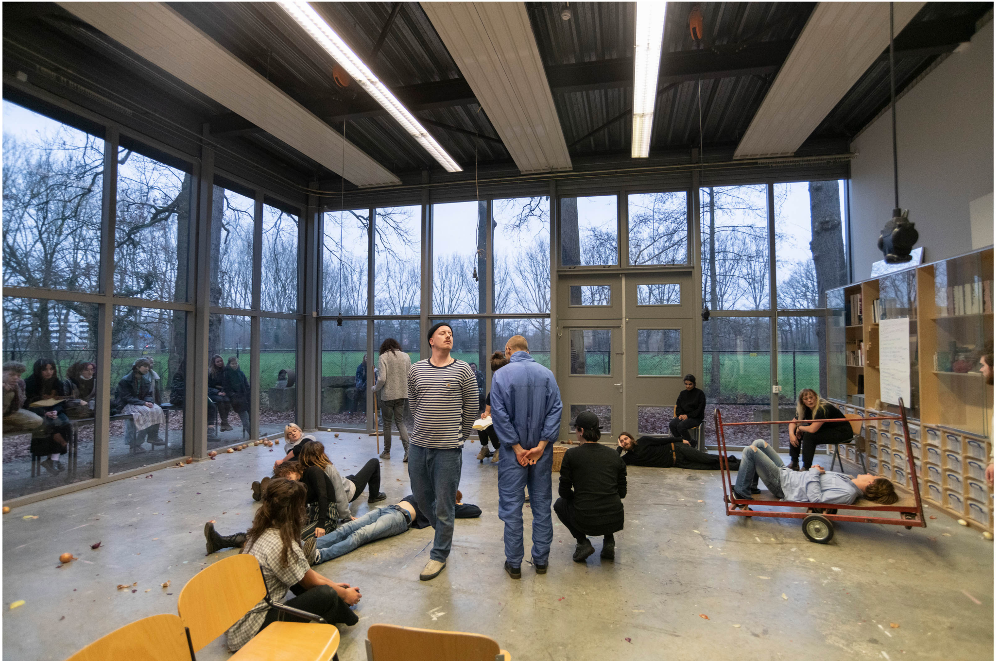
It is part XXVII of an ensemble, and this ensemble is no longer necessarily ceremonial, 2021 workshop AKV St. Joost, Breda