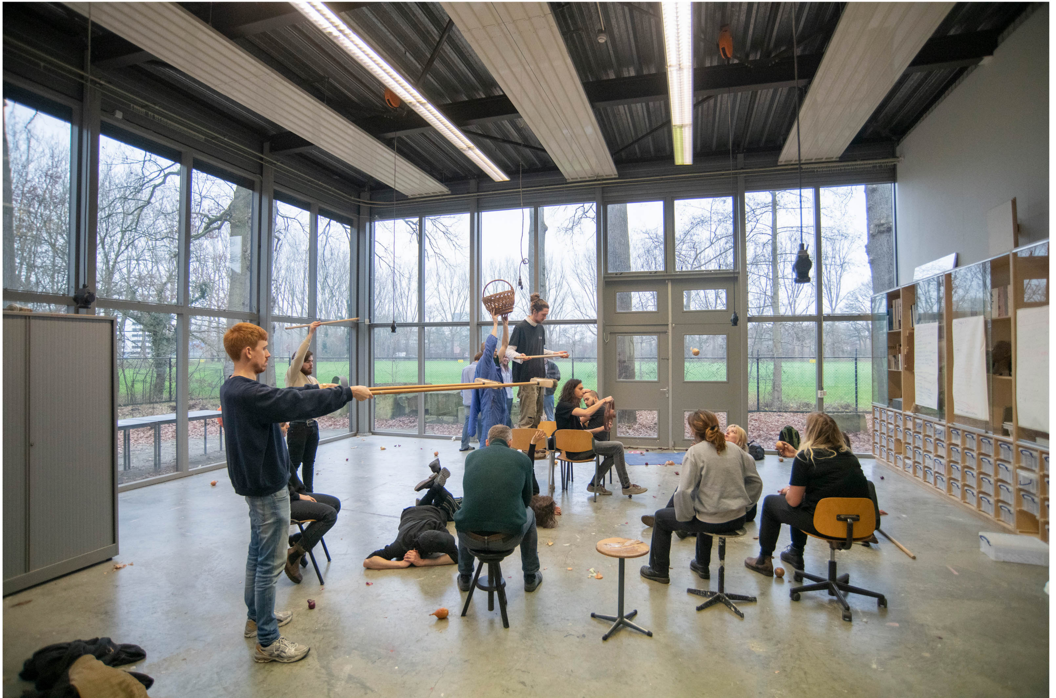
It is part XXVII of an ensemble, and this ensemble is no longer necessarily ceremonial, 2021 workshop AKV St. Joost, Breda