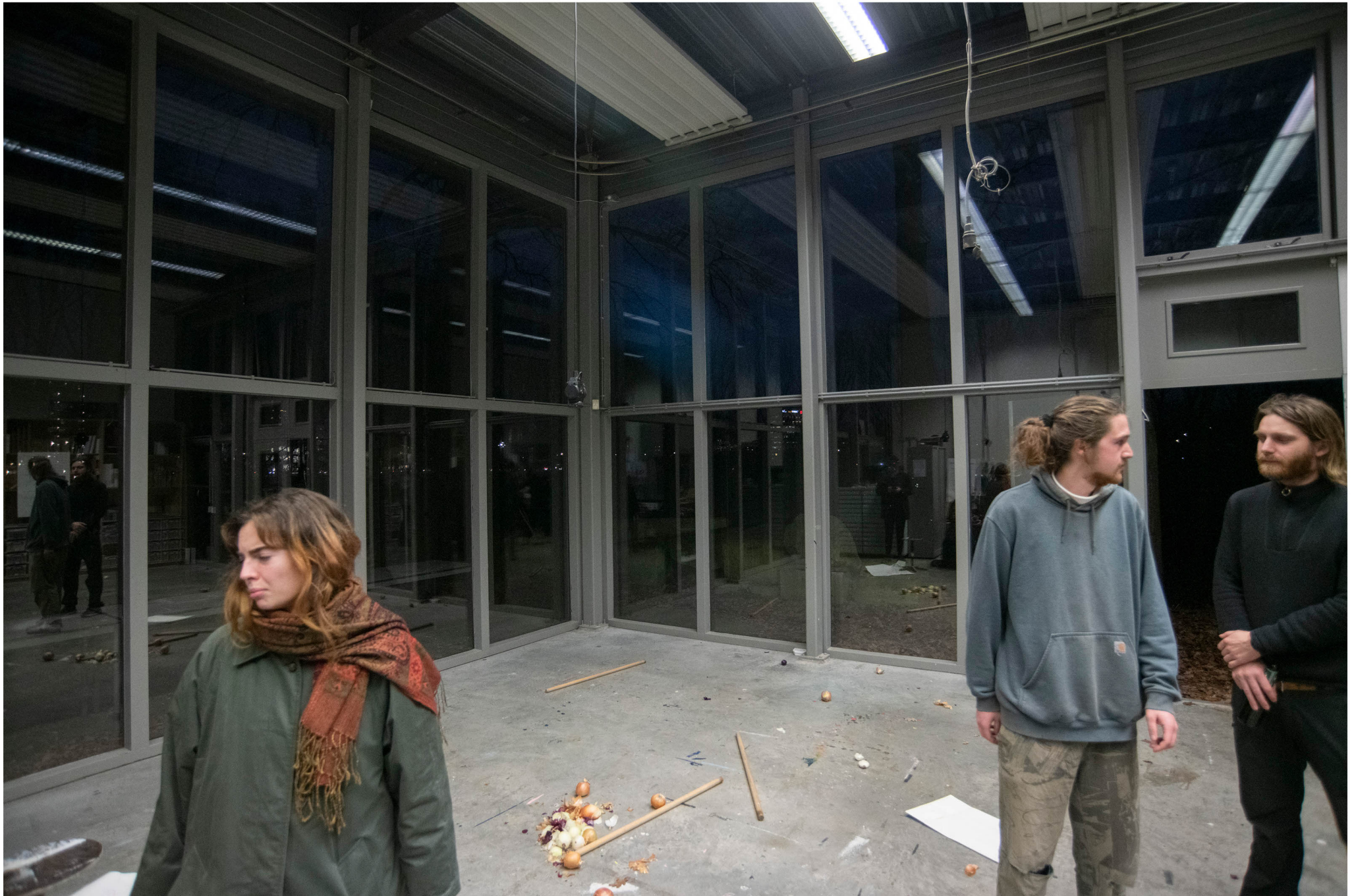
It is part XXVII of an ensemble, and this ensemble is no longer necessarily ceremonial, 2021 workshop AKV St. Joost, Breda