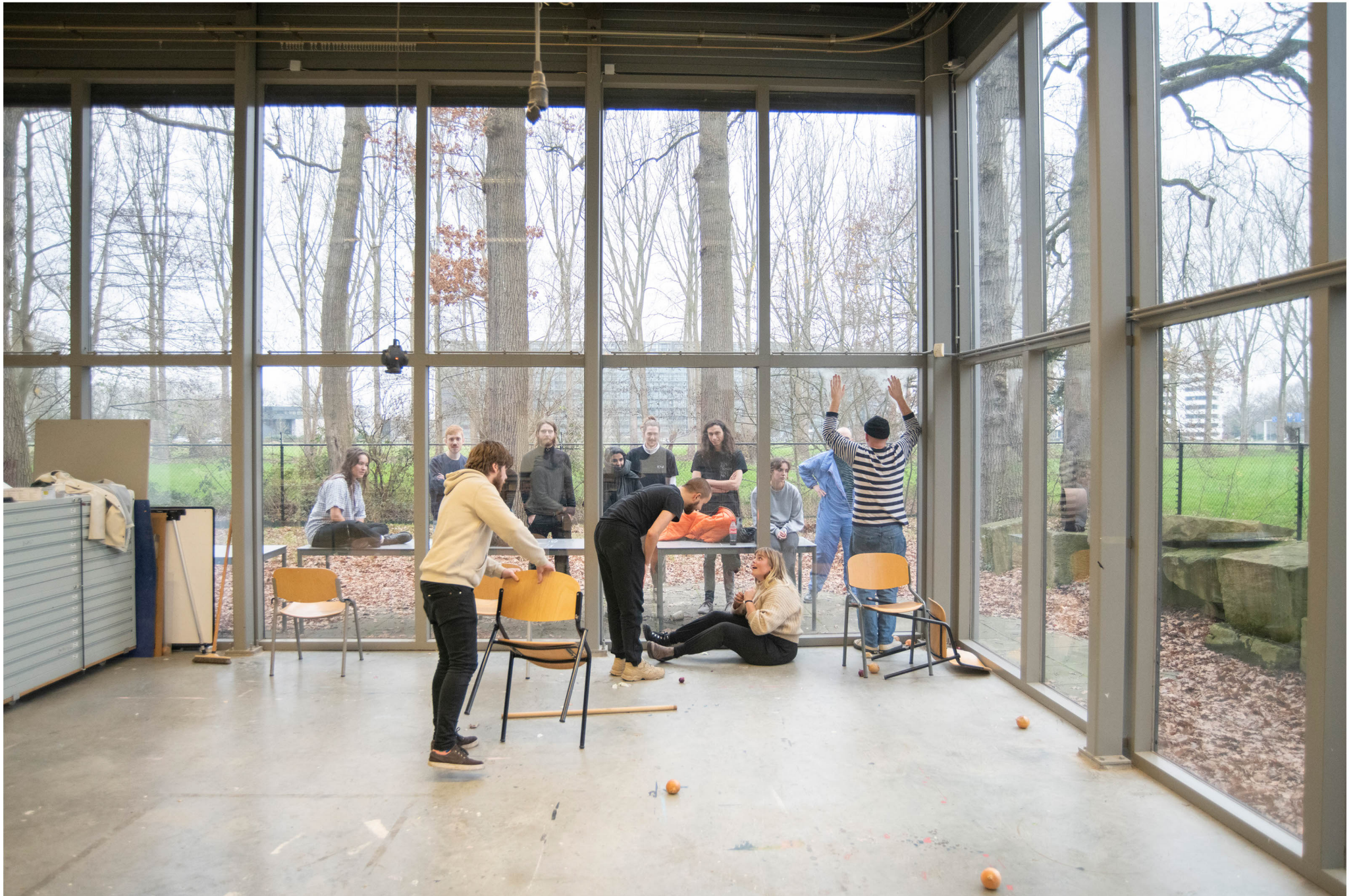
It is part XXVII of an ensemble, and this ensemble is no longer necessarily ceremonial, 2021 workshop AKV St. Joost, Breda