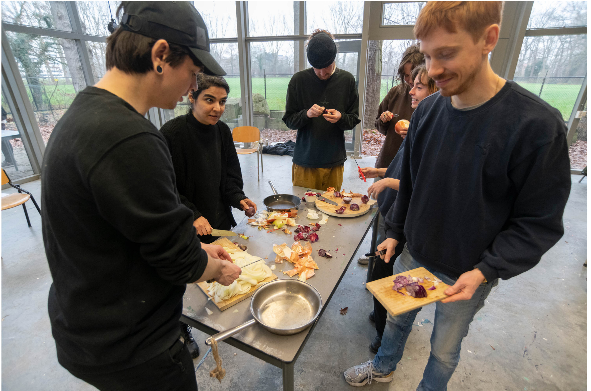
It is part XXVII of an ensemble, and this ensemble is no longer necessarily ceremonial, 2021 workshop AKV St. Joost, Breda