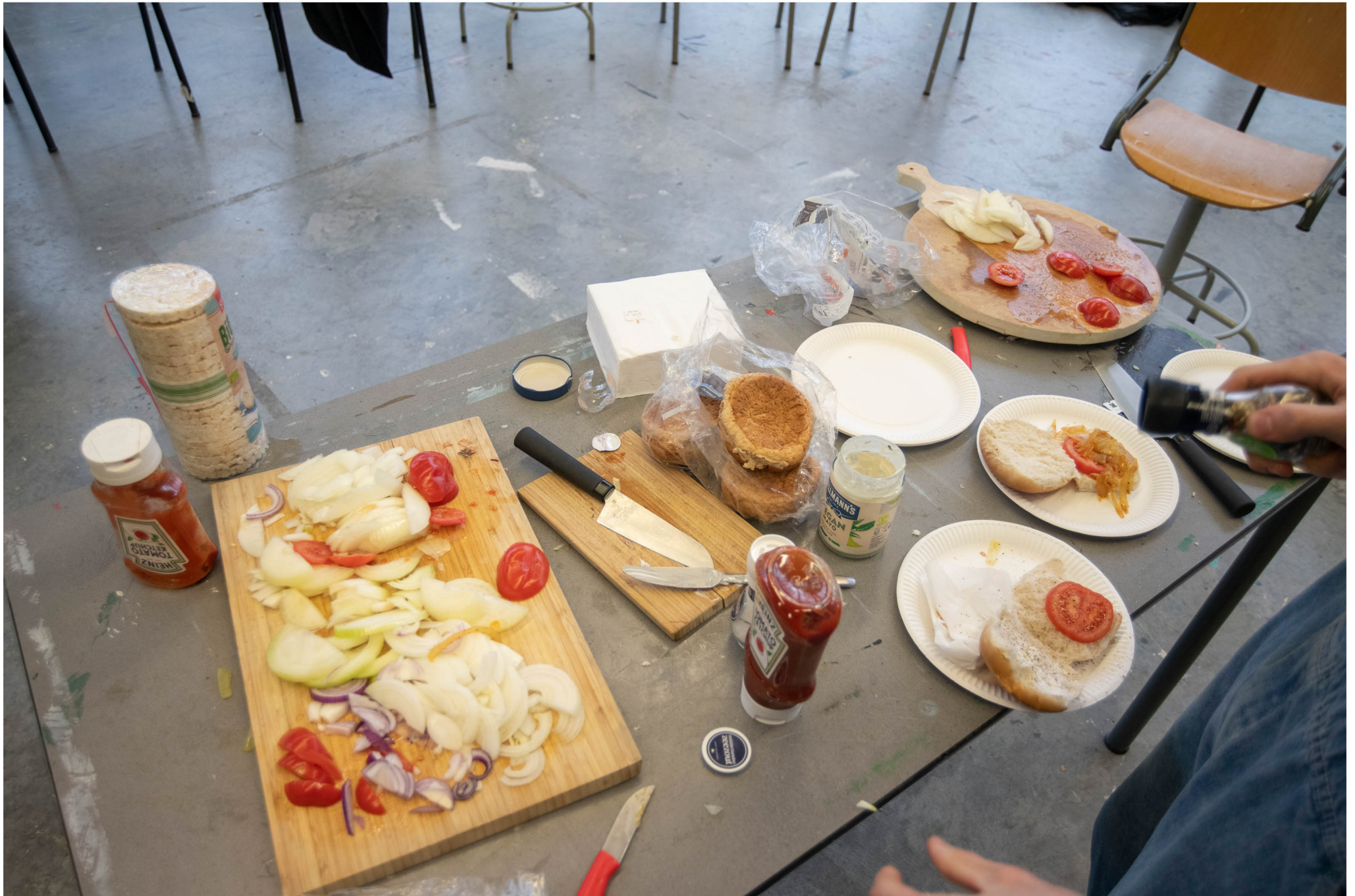
It is part XXVII of an ensemble, and this ensemble is no longer necessarily ceremonial, 2021 workshop AKV St. Joost, Breda