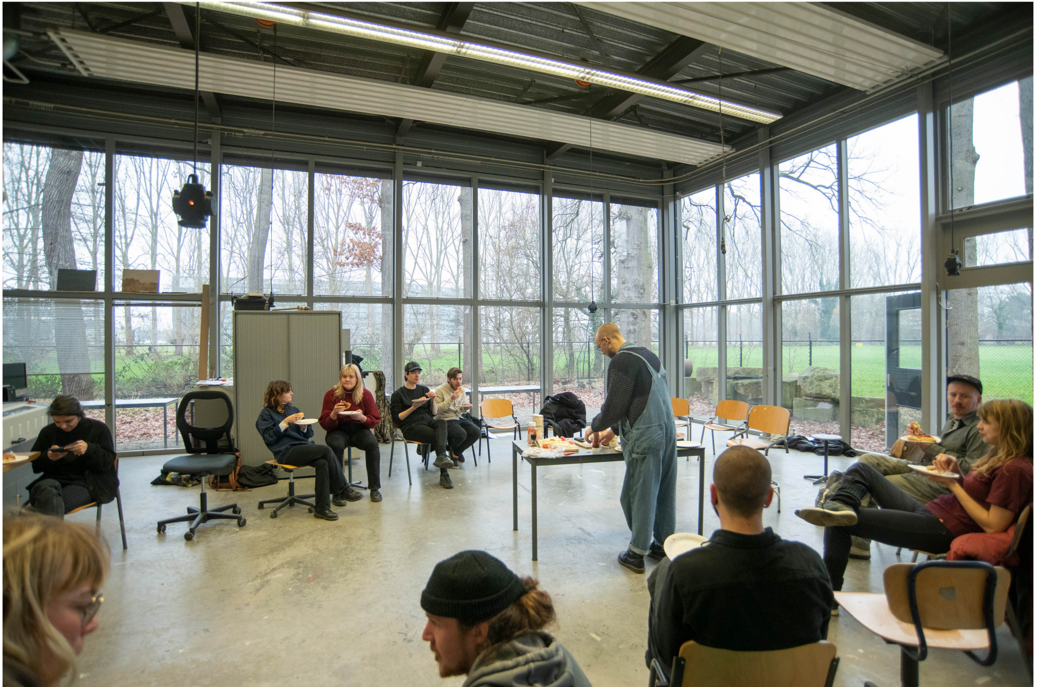
It is part XXVII of an ensemble, and this ensemble is no longer necessarily ceremonial, 2021 workshop AKV St. Joost, Breda