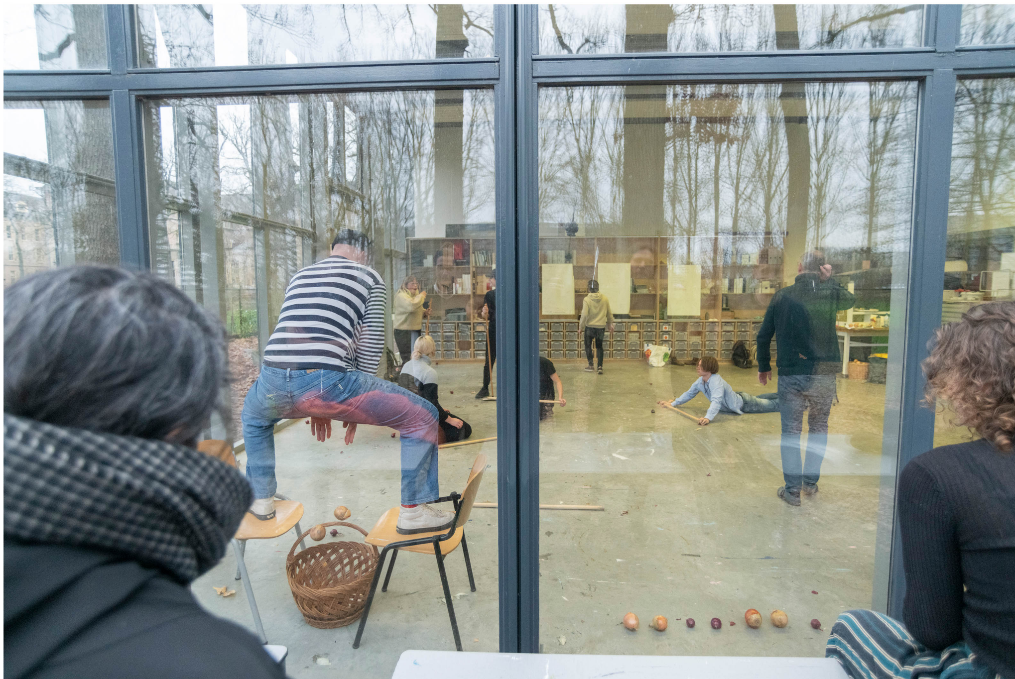
It is part XXVII of an ensemble, and this ensemble is no longer necessarily ceremonial, 2021 workshop AKV St. Joost, Breda