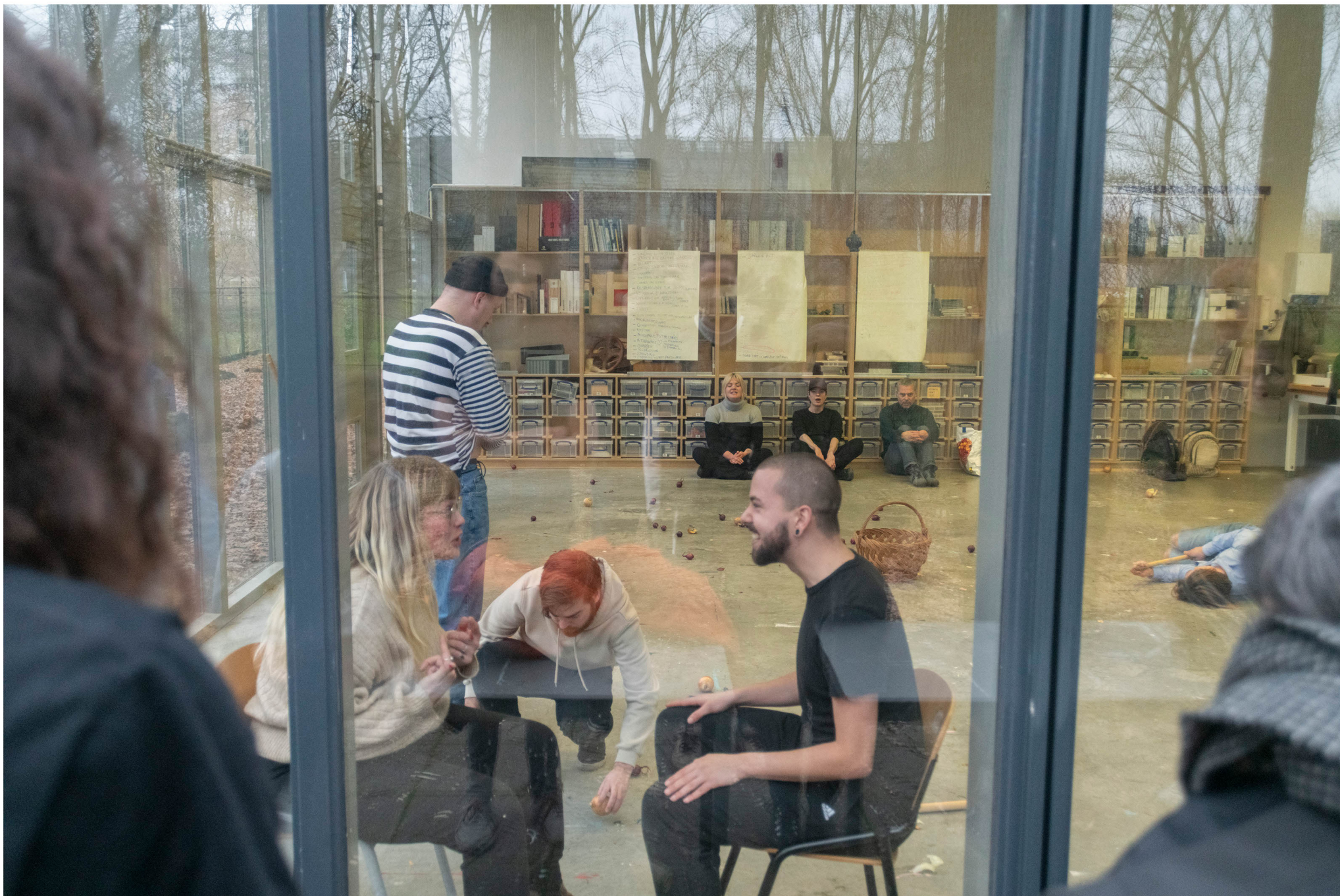
It is part XXVII of an ensemble, and this ensemble is no longer necessarily ceremonial, 2021 workshop AKV St. Joost, Breda