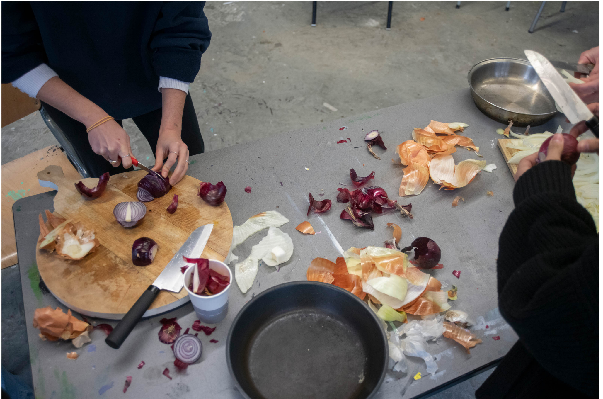
It is part XXVII of an ensemble, and this ensemble is no longer necessarily ceremonial, 2021 workshop AKV St. Joost, Breda