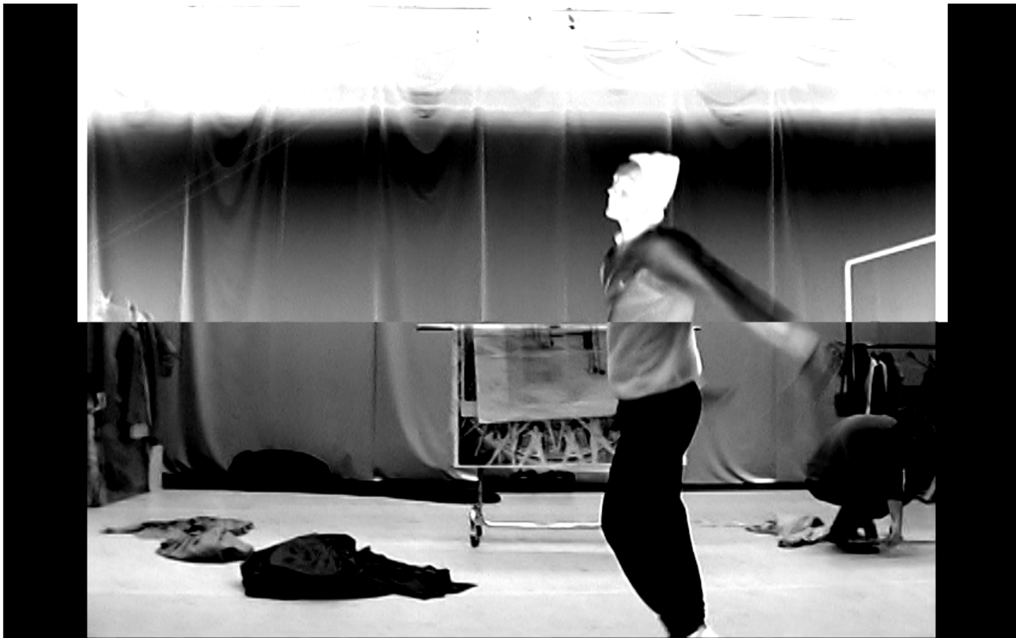
It is part II of an ensemble, and this ensemble is no longer necessarily ceremonial, 2019