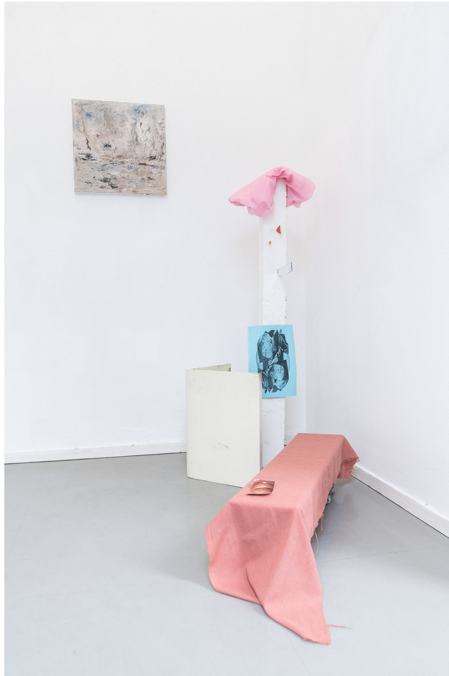
It is part II of an ensemble, and this ensemble is no longer necessarily ceremonial , 2019 installation view Support Structures , former Gallery Kokon, Tilburg