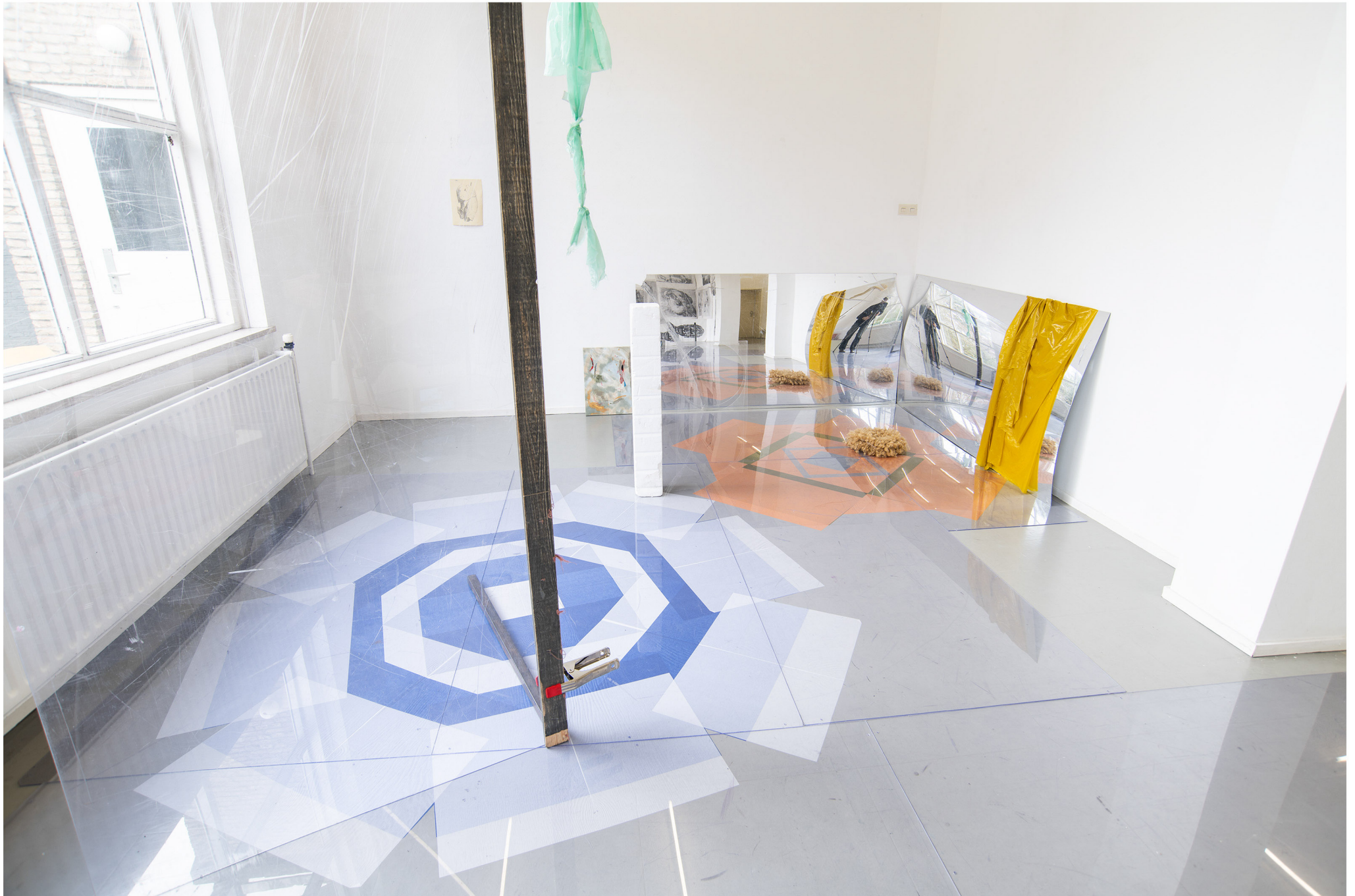
It is part II of an ensemble, and this ensemble is no longer necessarily ceremonial, 2019 installation view Support Structures , former Gallery Kokon, Tilburg