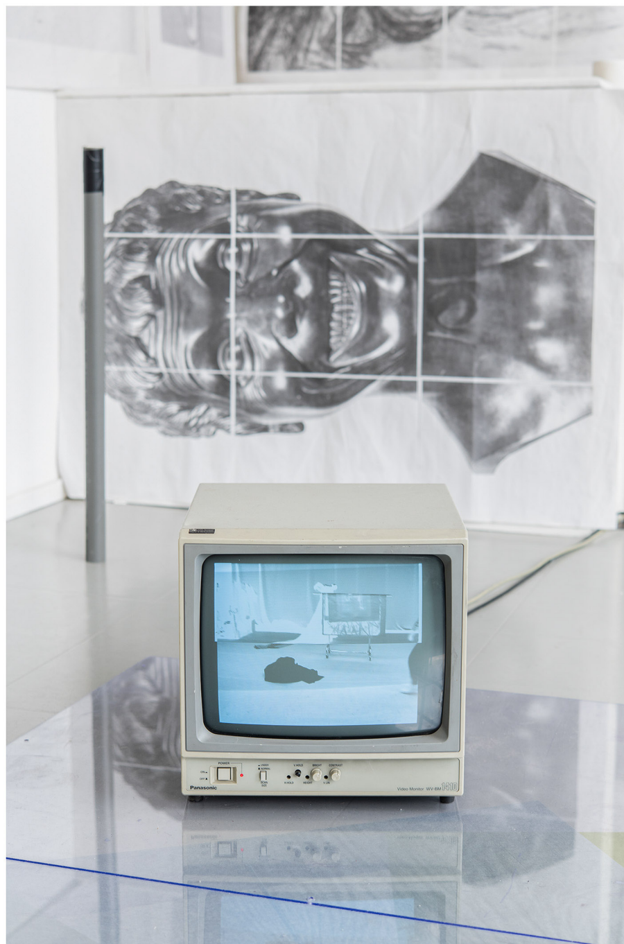
It is part II of an ensemble, and this ensemble is no longer necessarily ceremonial, 2019 installation view Support Structures , former Gallery Kokon, Tilburg