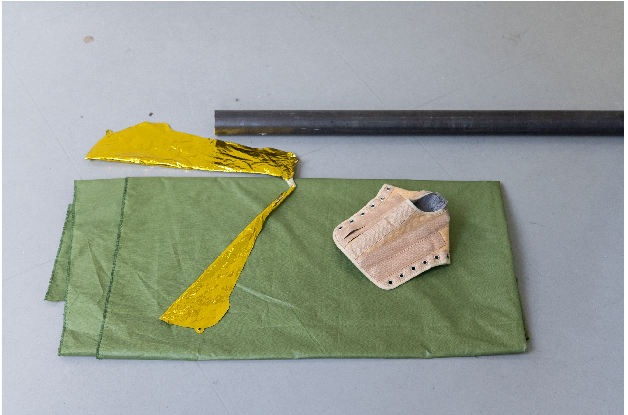
It is part II of an ensemble, and this ensemble is no longer necessarily ceremonial, 2019 installation view Support Structures , former Gallery Kokon, Tilburg