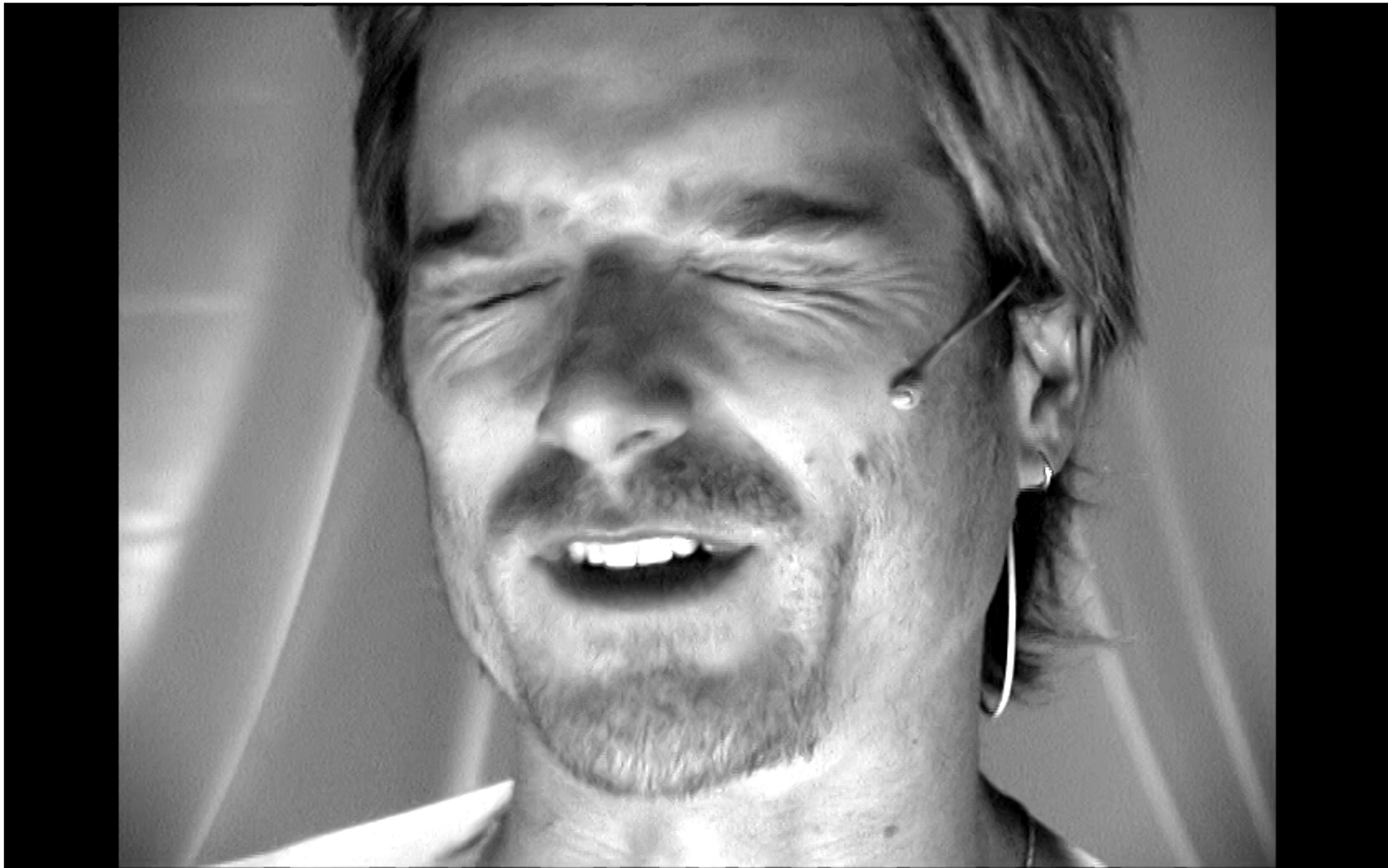
It is part II of an ensemble, and this ensemble is no longer necessarily ceremonial, 2019 videostill Support Structures , former Gallery Kokon, Tilburg