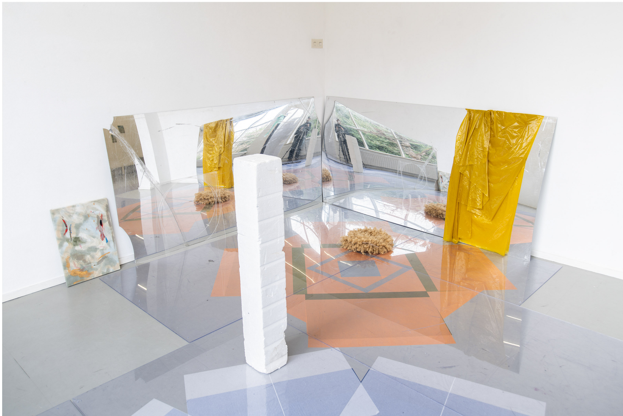
It is part II of an ensemble, and this ensemble is no longer necessarily ceremonial, 2019 installation view Support Structures , former Gallery Kokon, Tilburg