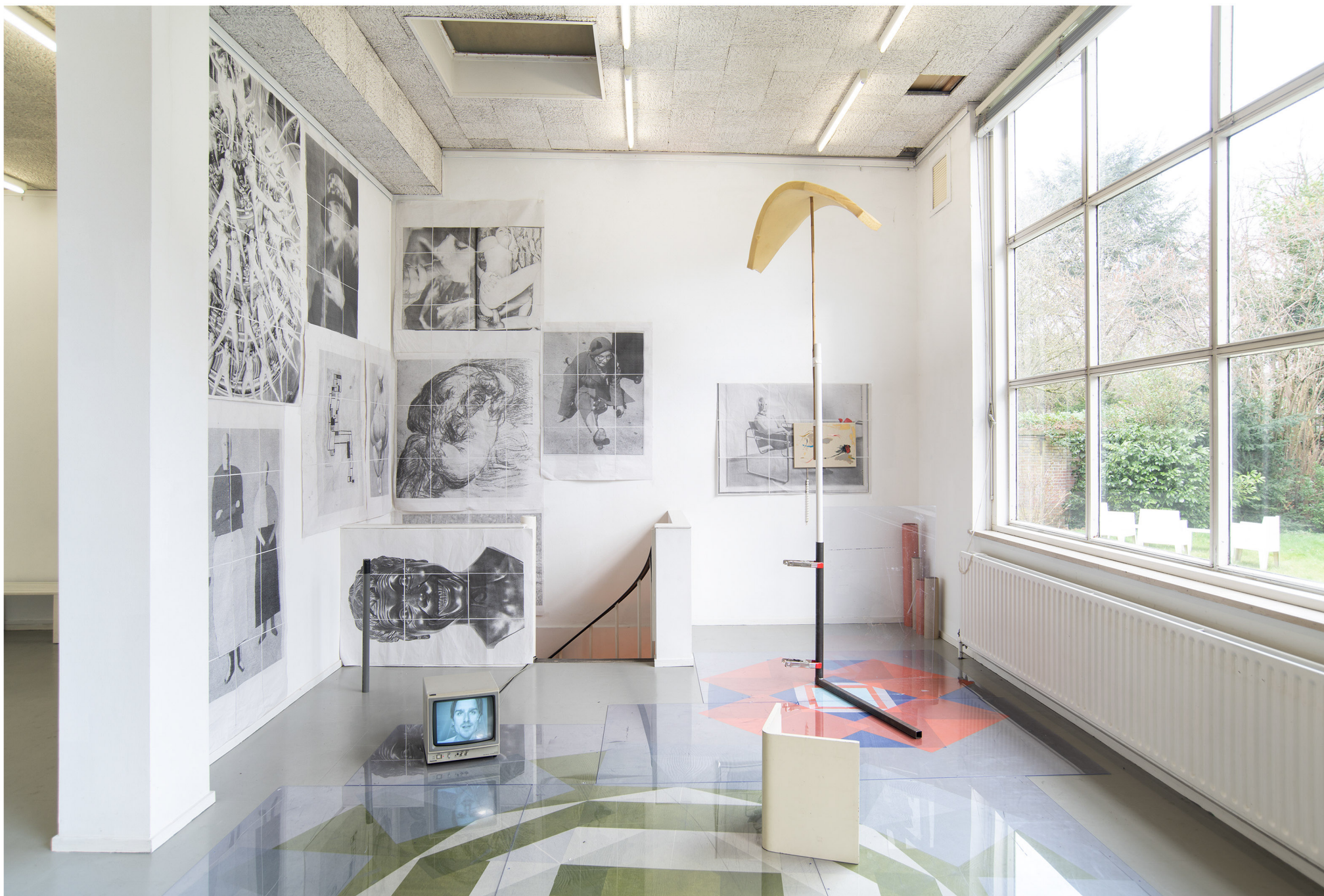
It is part II of an ensemble, and this ensemble is no longer necessarily ceremonial, 2019 installation view Support Structures, former Gallery Kokon, Tilburg