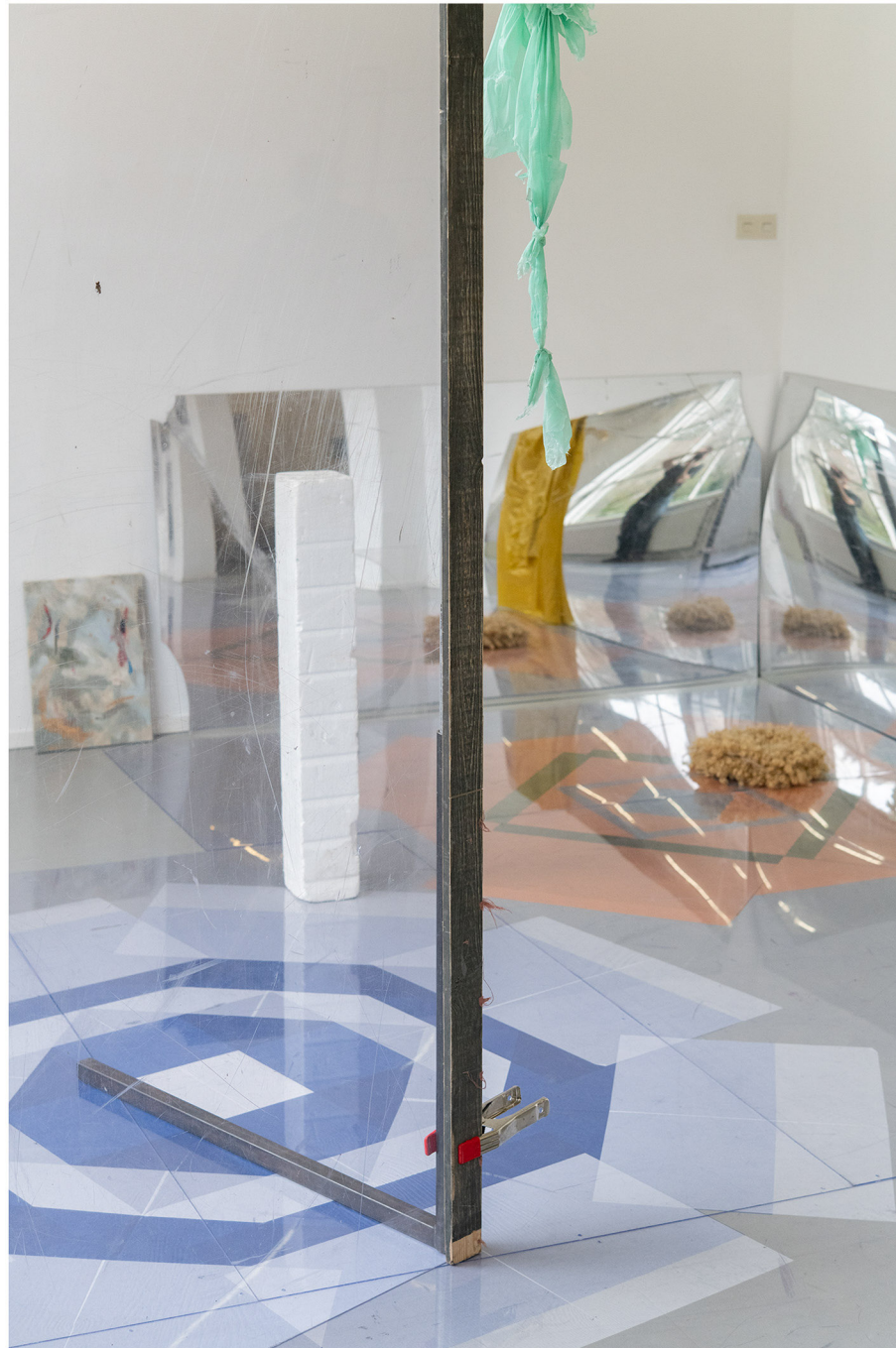
It is part II of an ensemble, and this ensemble is no longer necessarily ceremonial , 2019 installation view Support Structures , former Gallery Kokon, Tilburg