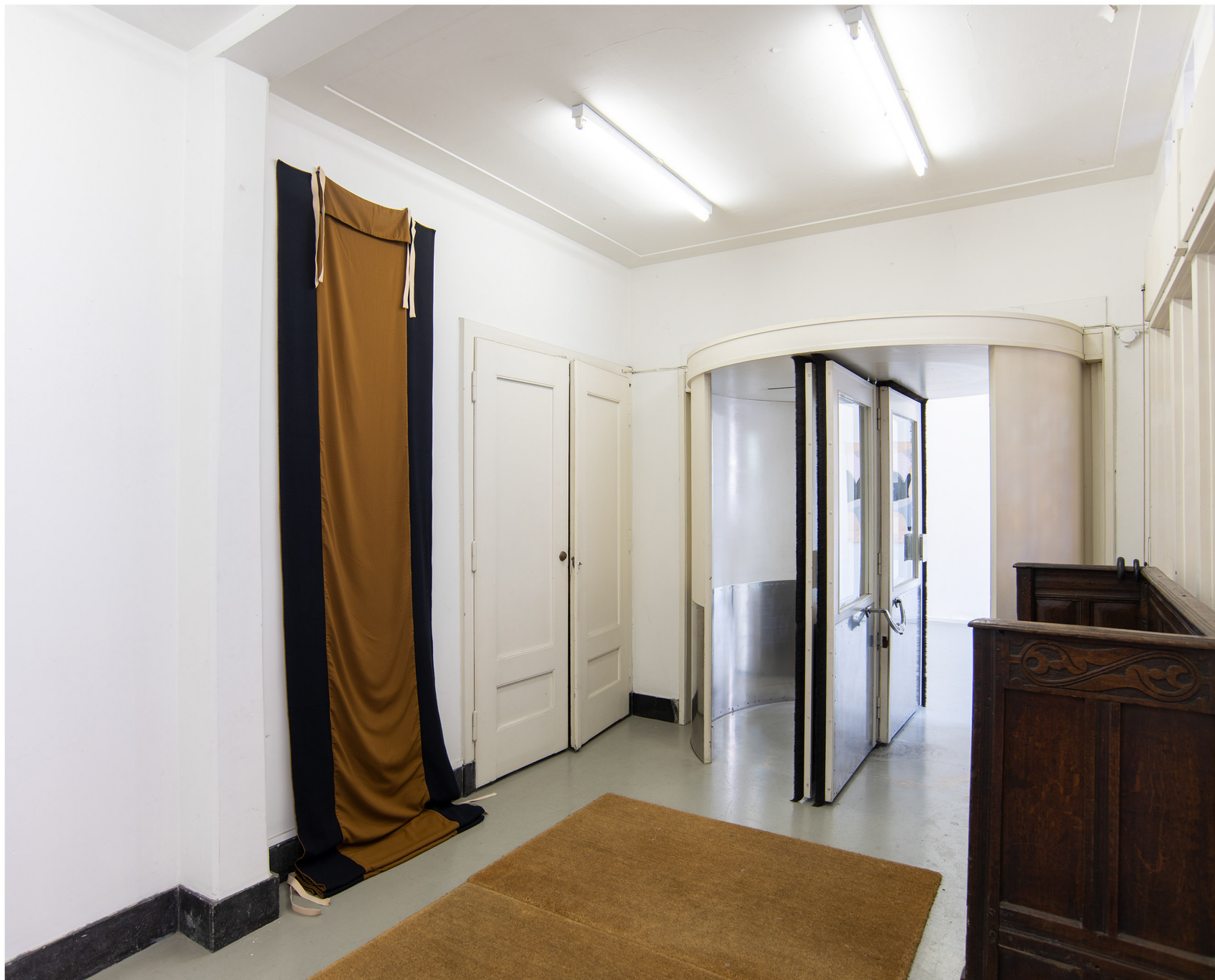
It is part II of an ensemble, and this ensemble is no longer necessarily ceremonial, 2019 installation view Support Structures , former Gallery Kokon, Tilburg