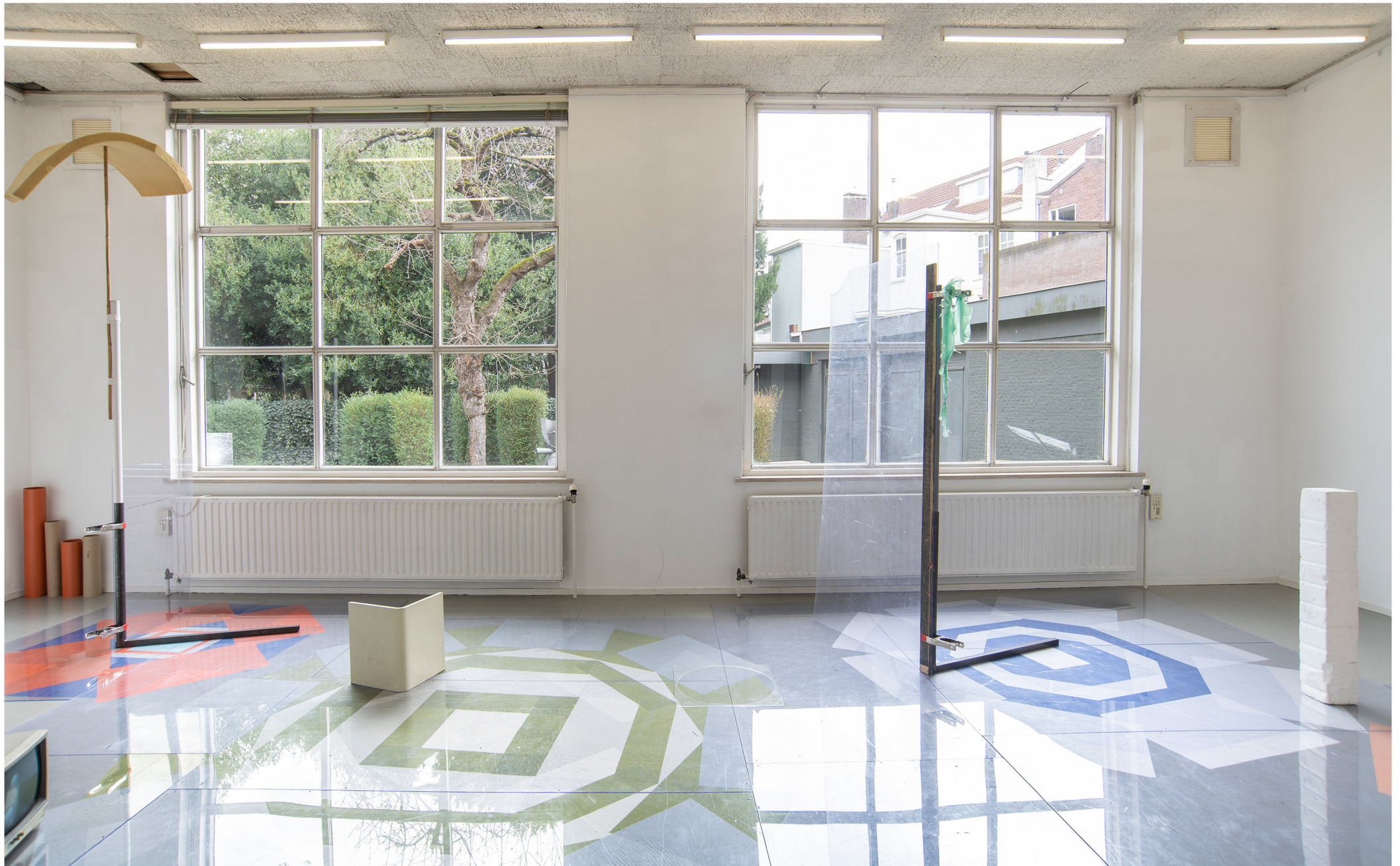
It is part II of an ensemble, and this ensemble is no longer necessarily ceremonial, 2019 installation view Support Structures, former Gallery Kokon, Tilburg