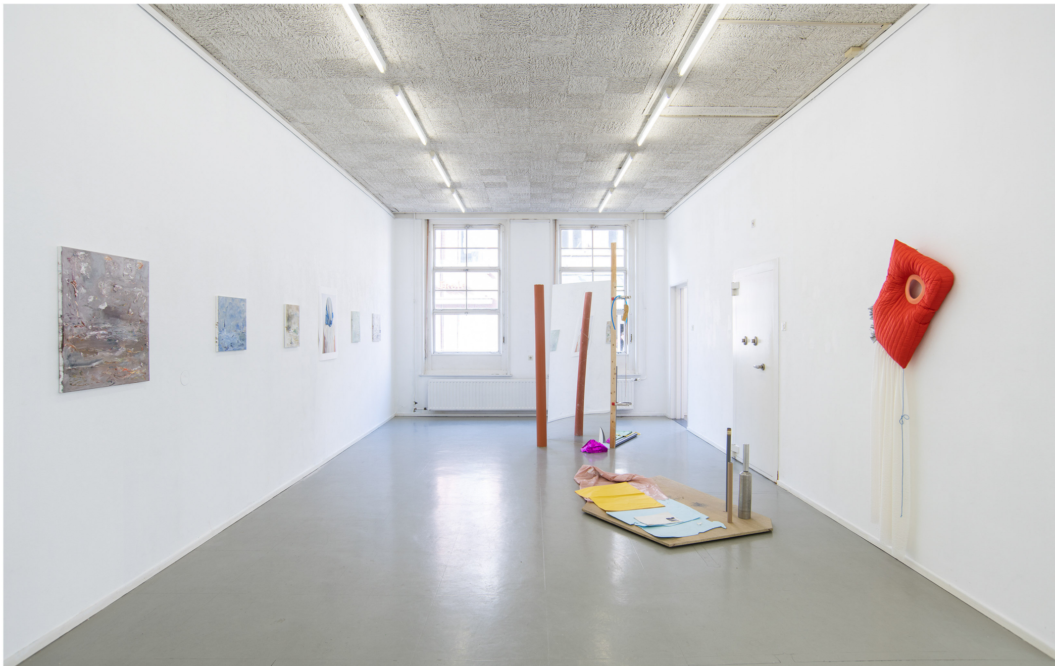
It is part II of an ensemble, and this ensemble is no longer necessarily ceremonial, 2019 installation view Support Structures , former Gallery Kokon, Tilburg