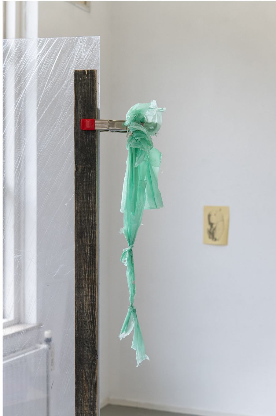
It is part II of an ensemble, and this ensemble is no longer necessarily ceremonial, 2019 installation view Support Structures , former Gallery Kokon, Tilburg