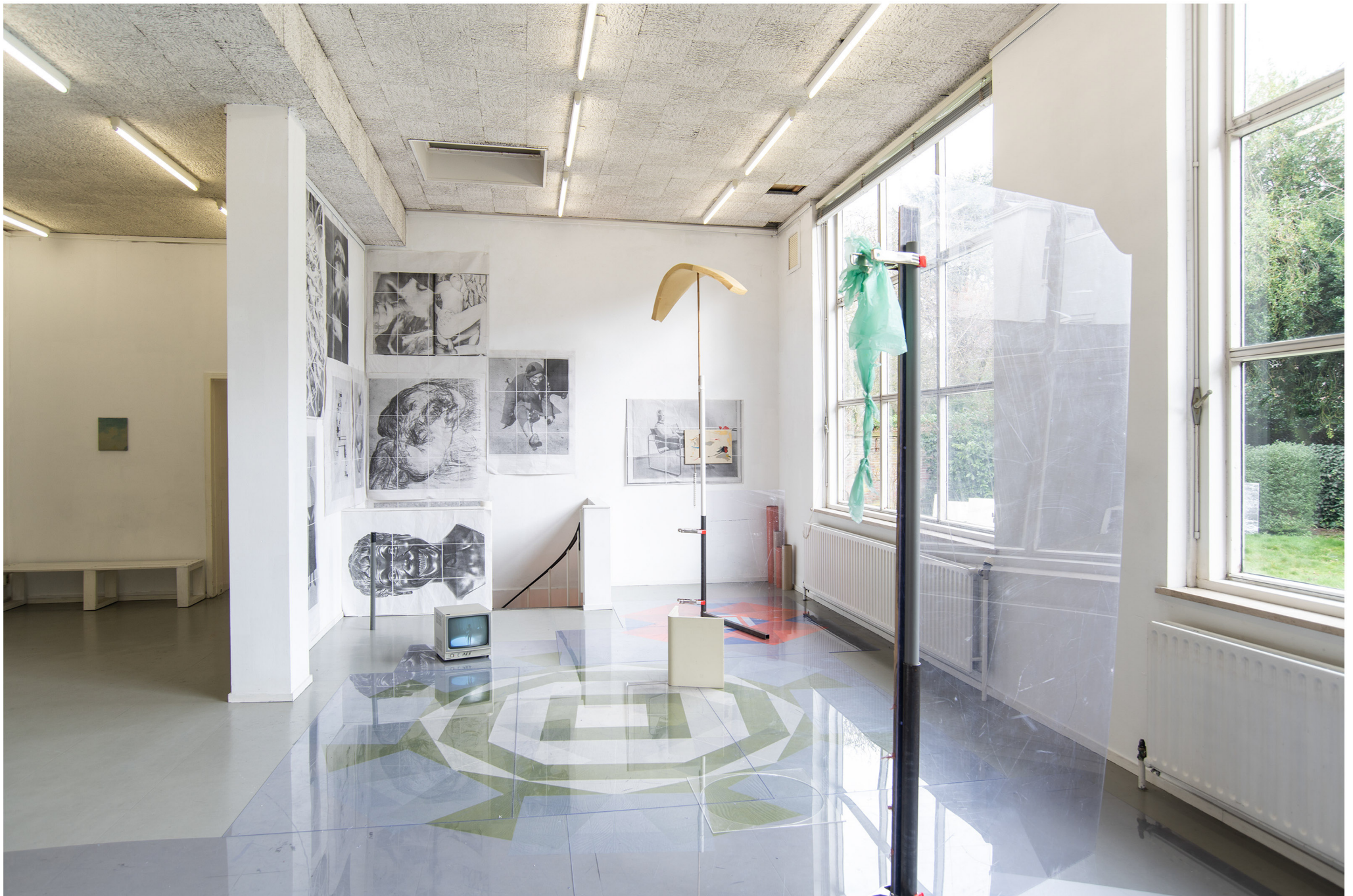
It is part II of an ensemble, and this ensemble is no longer necessarily ceremonial, 2019 installation view Support Structures , former Gallery Kokon, Tilburg