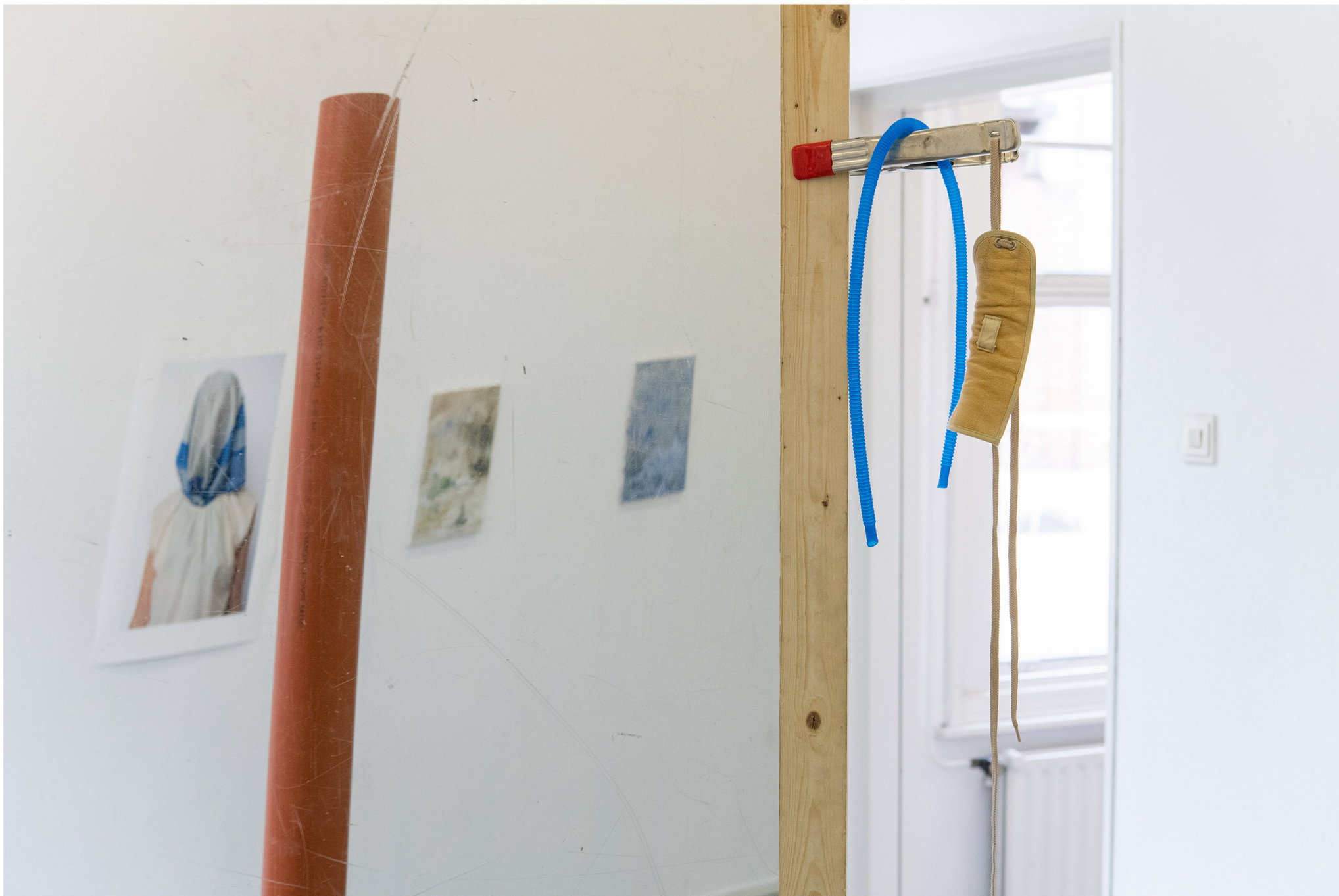
It is part II of an ensemble, and this ensemble is no longer necessarily ceremonial, 2019 installation view Support Structures , former Gallery Kokon, Tilburg