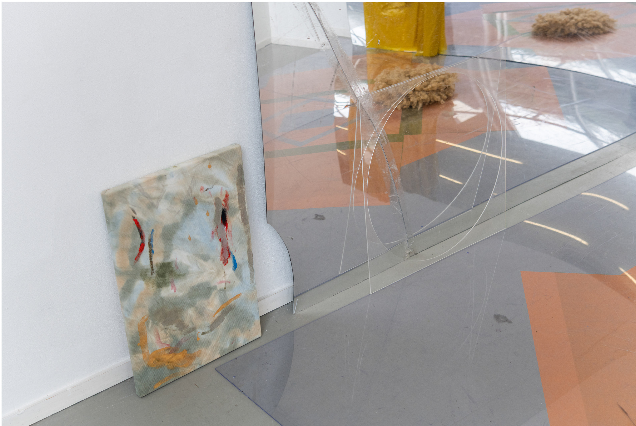
It is part II of an ensemble, and this ensemble is no longer necessarily ceremonial, 2019 installation view Support Structures , former Gallery Kokon, Tilburg