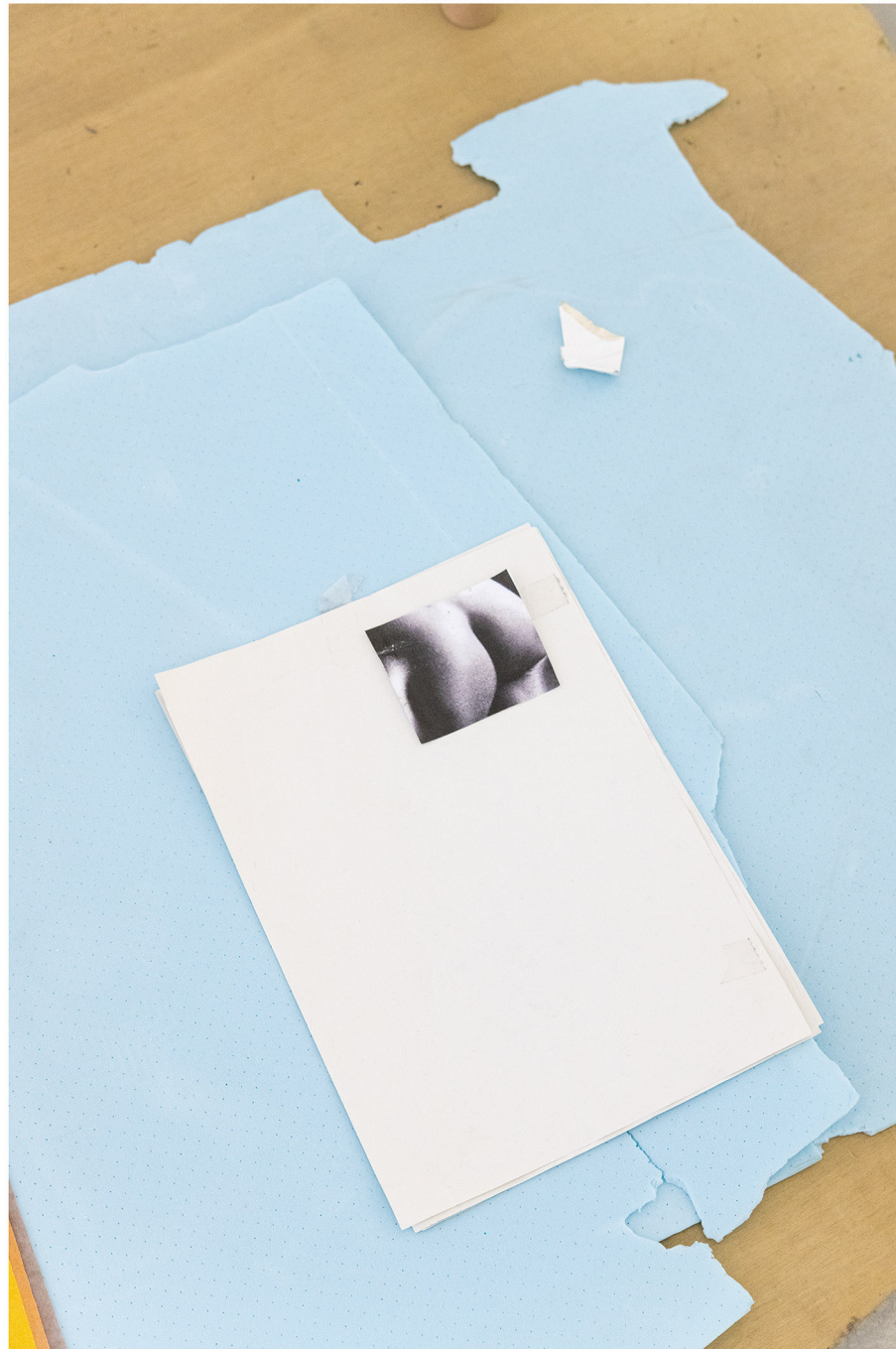
It is part II of an ensemble, and this ensemble is no longer necessarily ceremonial , 2019 installation view Support Structures , former Gallery Kokon, Tilburg