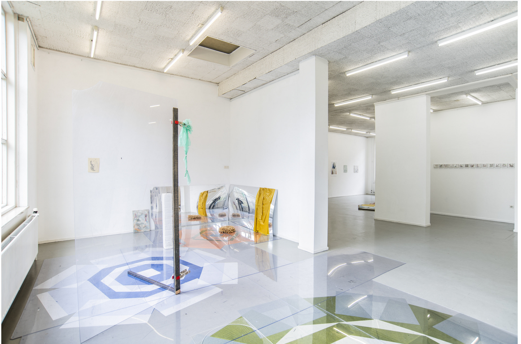
It is part II of an ensemble, and this ensemble is no longer necessarily ceremonial, 2019 installation view Support Structures , former Gallery Kokon, Tilburg