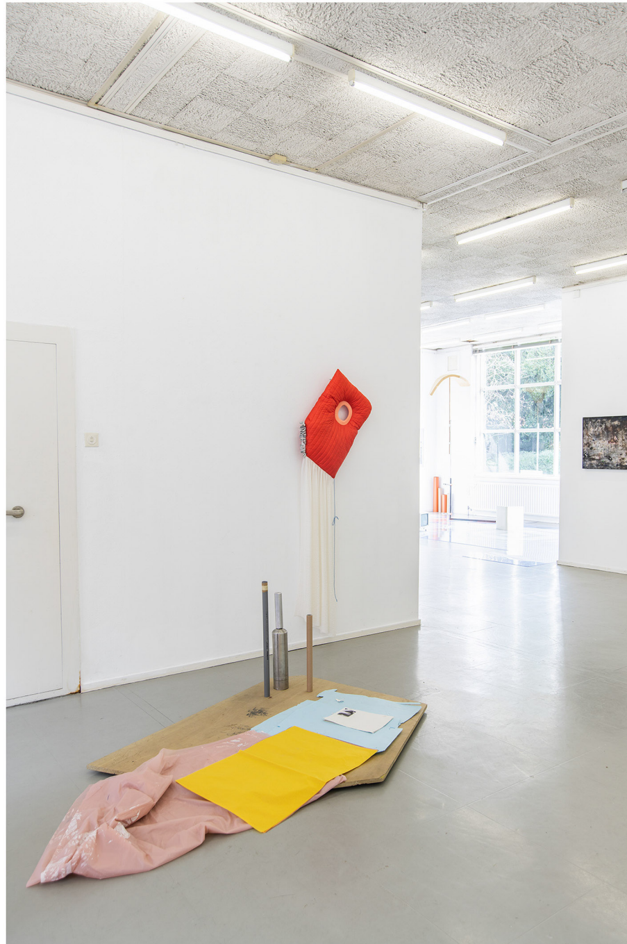
It is part II of an ensemble, and this ensemble is no longer necessarily ceremonial, 2019 installation view Support Structures, former Gallery Kokon, Tilburg