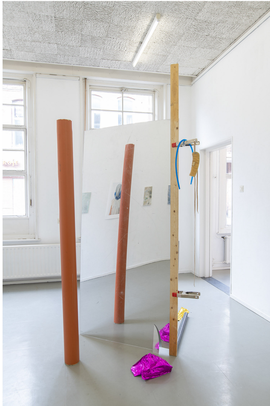
It is part II of an ensemble, and this ensemble is no longer necessarily ceremonial, 2019 installation view Support Structures , former Gallery Kokon, Tilburg