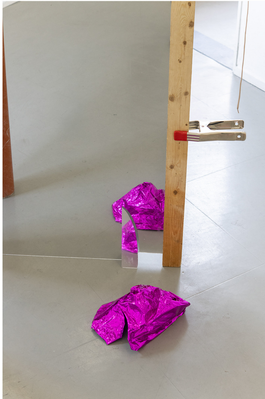
It is part II of an ensemble, and this ensemble is no longer necessarily ceremonial, 2019 installation view Support Structures , former Gallery Kokon, Tilburg