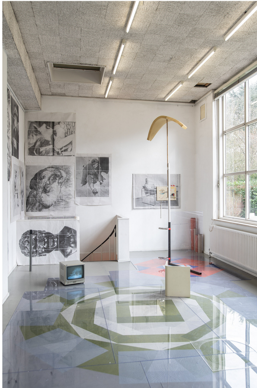
It is part II of an ensemble, and this ensemble is no longer necessarily ceremonial, 2019 installation view Support Structures, former Gallery Kokon, Tilburg