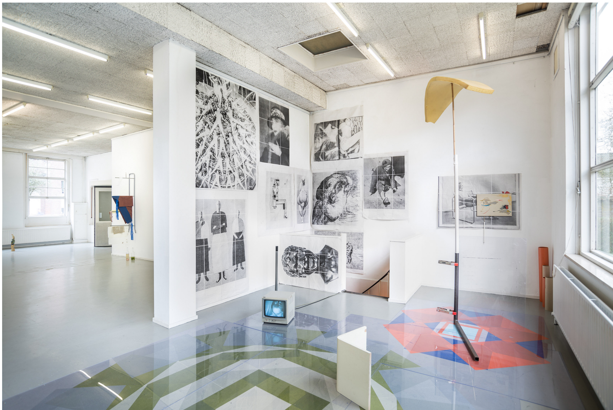
It is part II of an ensemble, and this ensemble is no longer necessarily ceremonial, 2019 installation view Support Structures , former Gallery Kokon, Tilburg