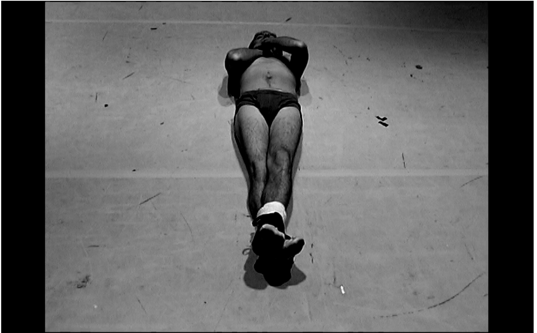
It is part II of an ensemble, and this ensemble is no longer necessarily ceremonial, 2019 videostill Support Structures , former Gallery Kokon, Tilburg