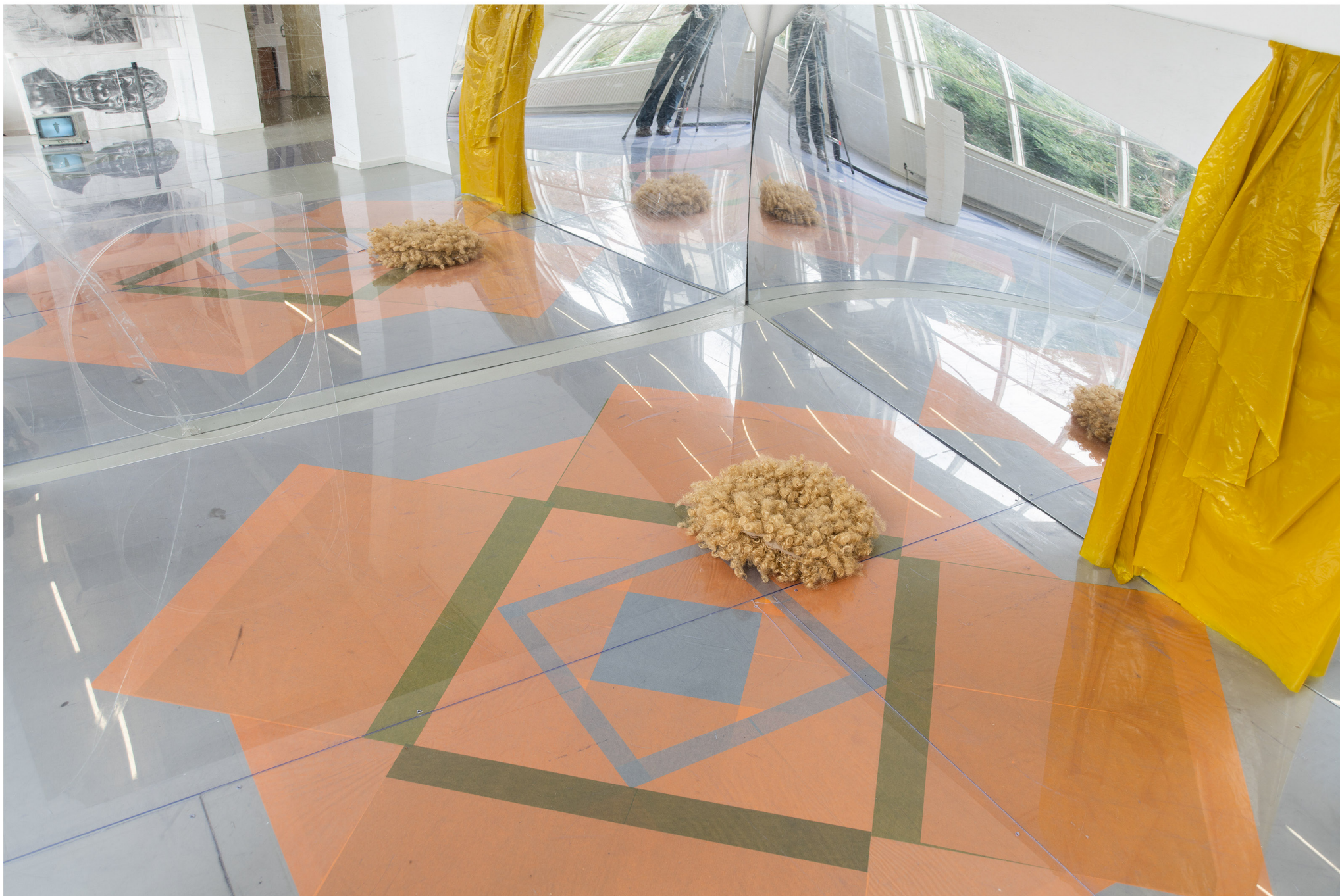
It is part II of an ensemble, and this ensemble is no longer necessarily ceremonial, 2019 installation view Support Structures , former Gallery Kokon, Tilburg