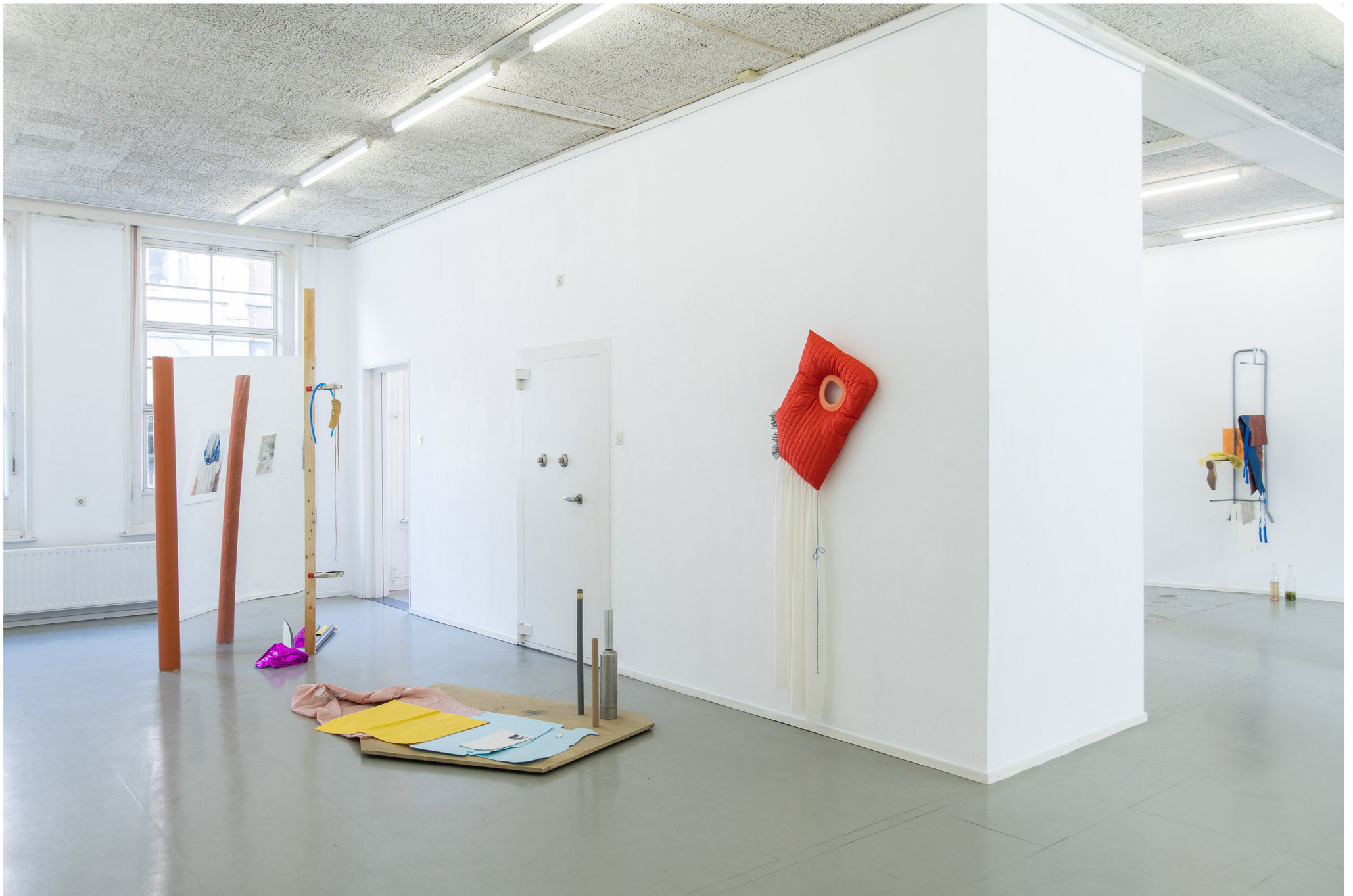
It is part II of an ensemble, and this ensemble is no longer necessarily ceremonial, 2019 installation view Support Structures , former Gallery Kokon, Tilburg