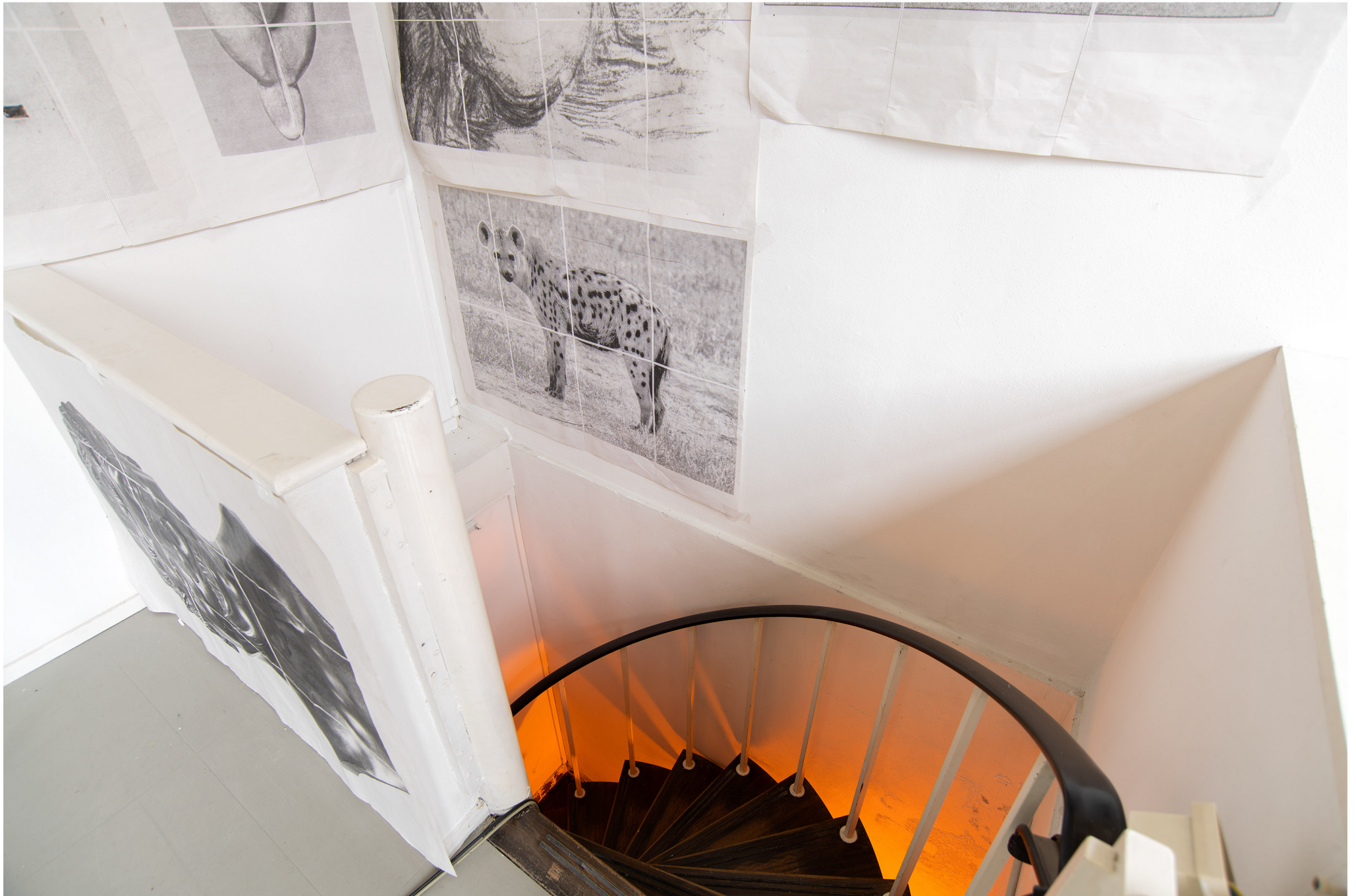
It is part II of an ensemble, and this ensemble is no longer necessarily ceremonial, 2019 installation view Support Structures , former Gallery Kokon, Tilburg