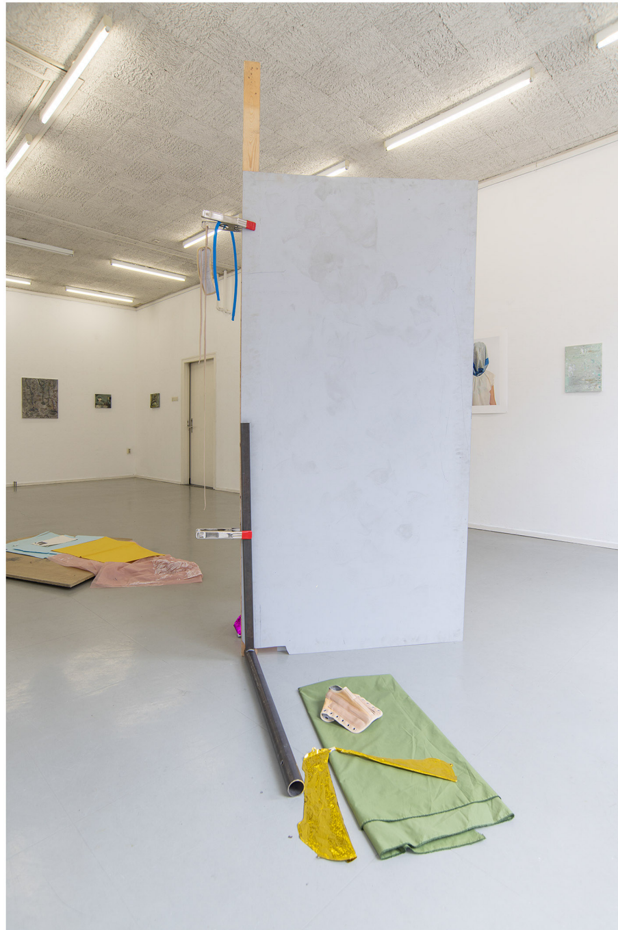
It is part II of an ensemble, and this ensemble is no longer necessarily ceremonial, 2019 installation view Support Structures, former Gallery Kokon, Tilburg