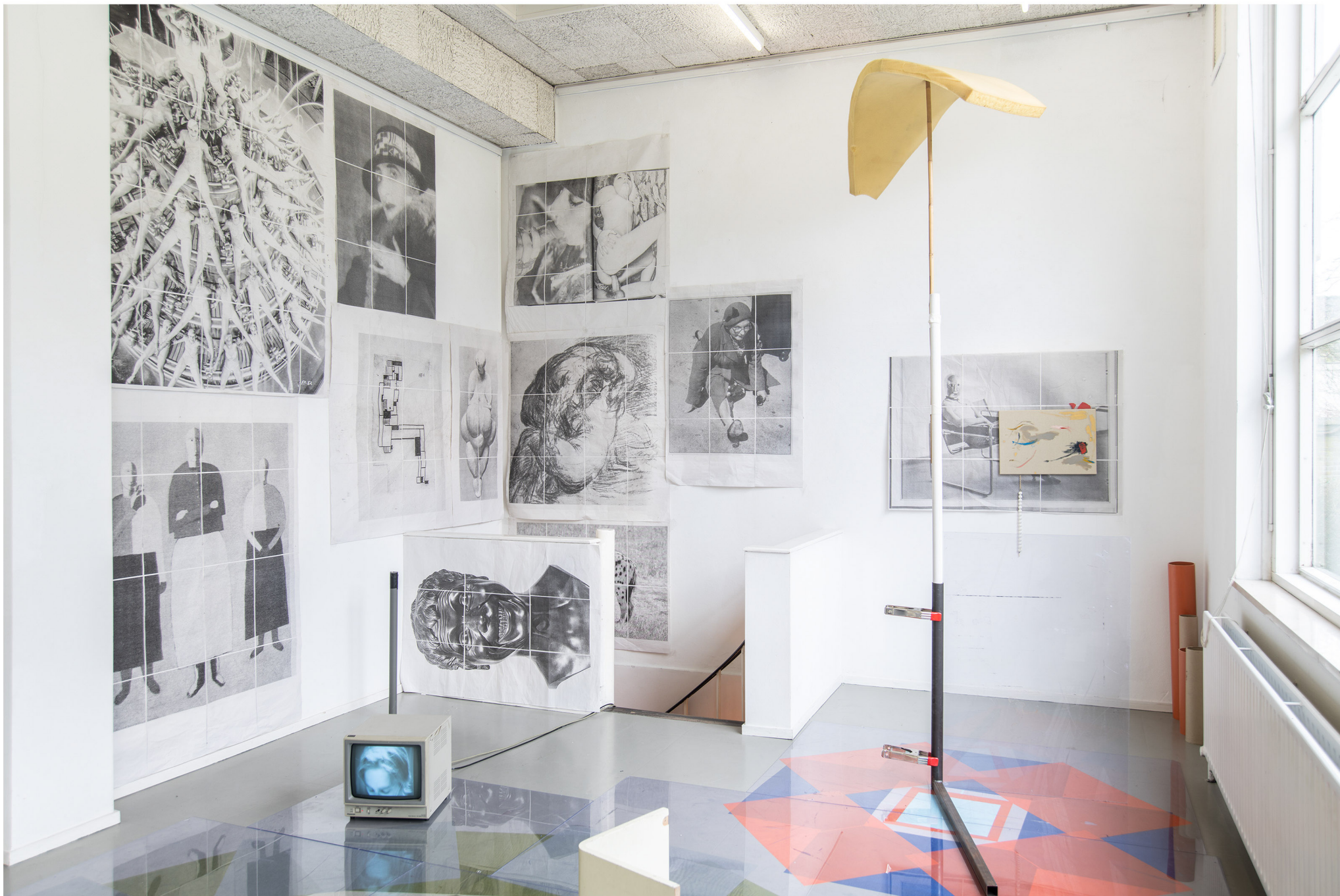
It is part II of an ensemble, and this ensemble is no longer necessarily ceremonial, 2019 installation view Support Structures, former Gallery Kokon, Tilburg