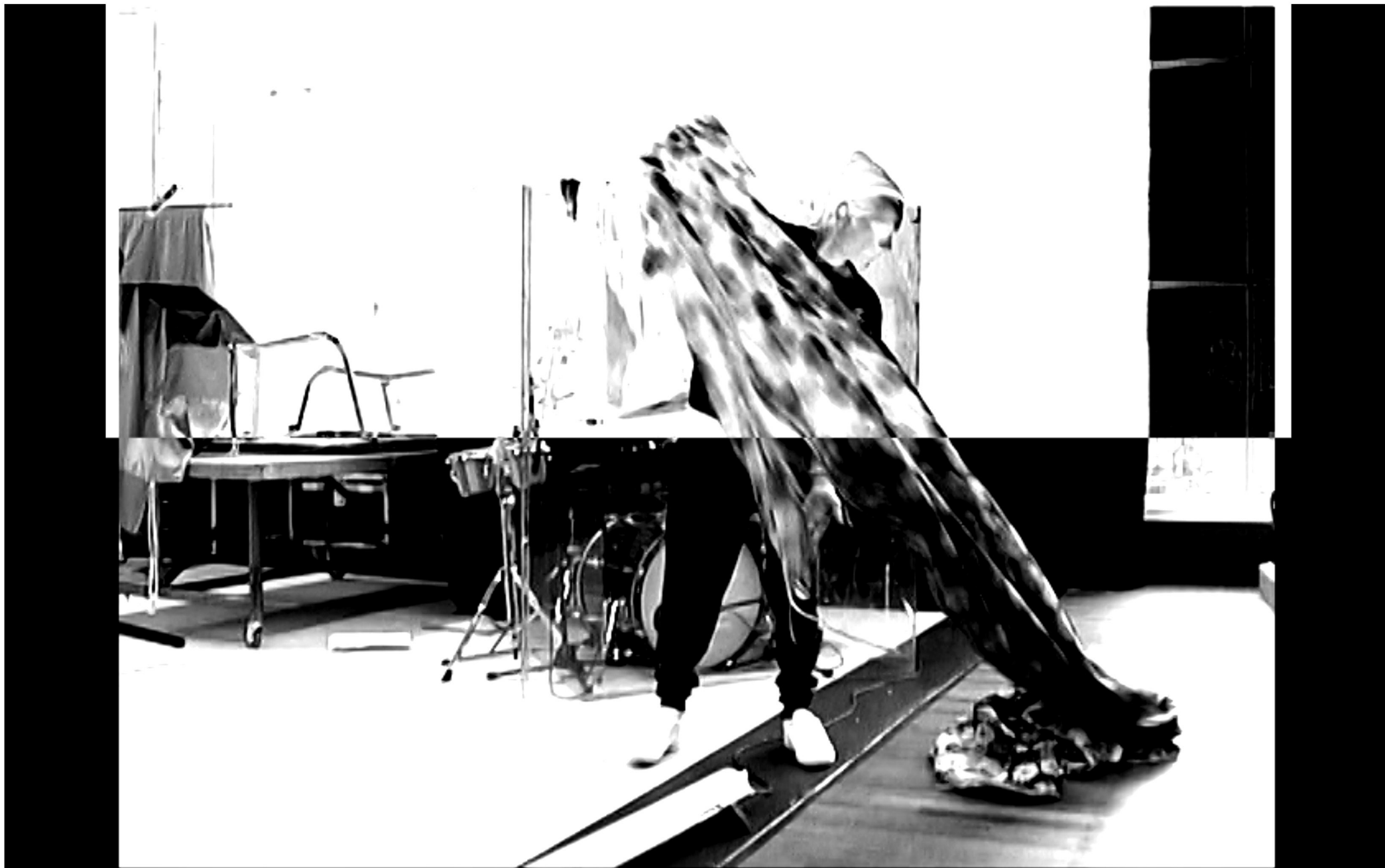
It is part II of an ensemble, and this ensemble is no longer necessarily ceremonial, 2019