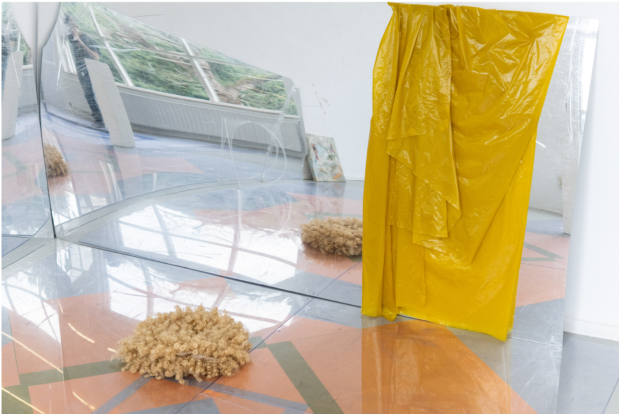
It is part II of an ensemble, and this ensemble is no longer necessarily ceremonial, 2019 installation view Support Structures , former Gallery Kokon, Tilburg