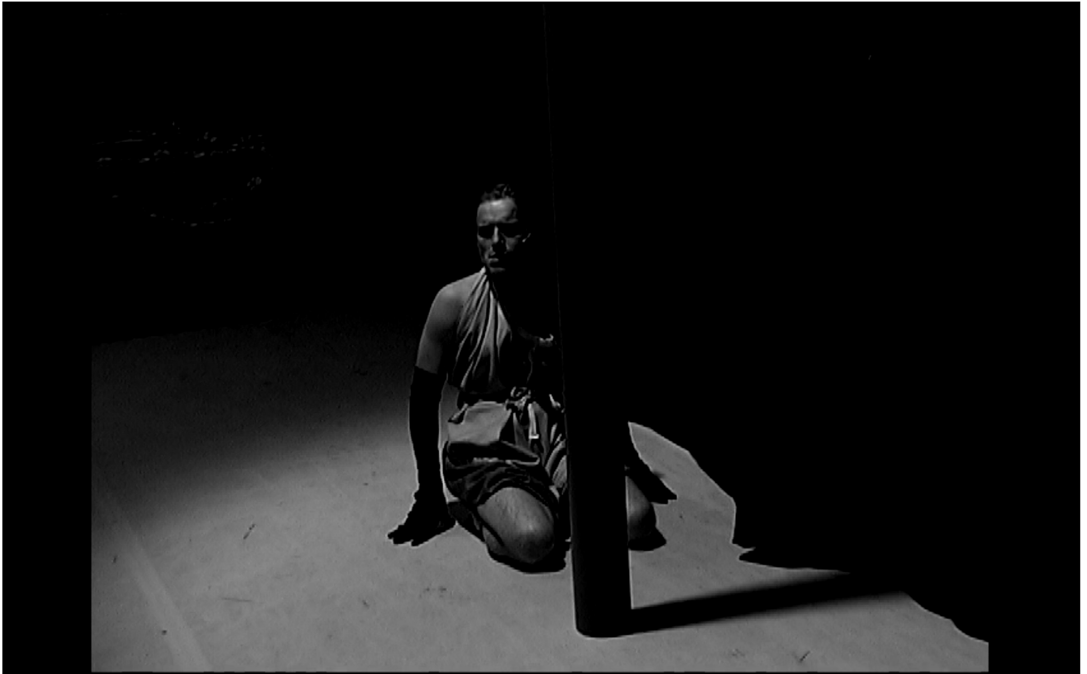
It is part II of an ensemble, and this ensemble is no longer necessarily ceremonial, 2019