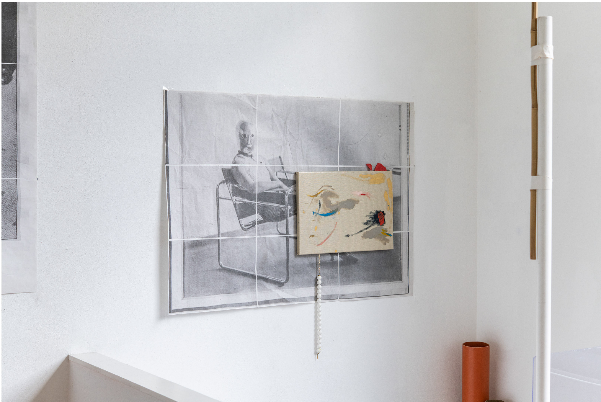
It is part II of an ensemble, and this ensemble is no longer necessarily ceremonial, 2019 installation view Support Structures , former Gallery Kokon, Tilburg