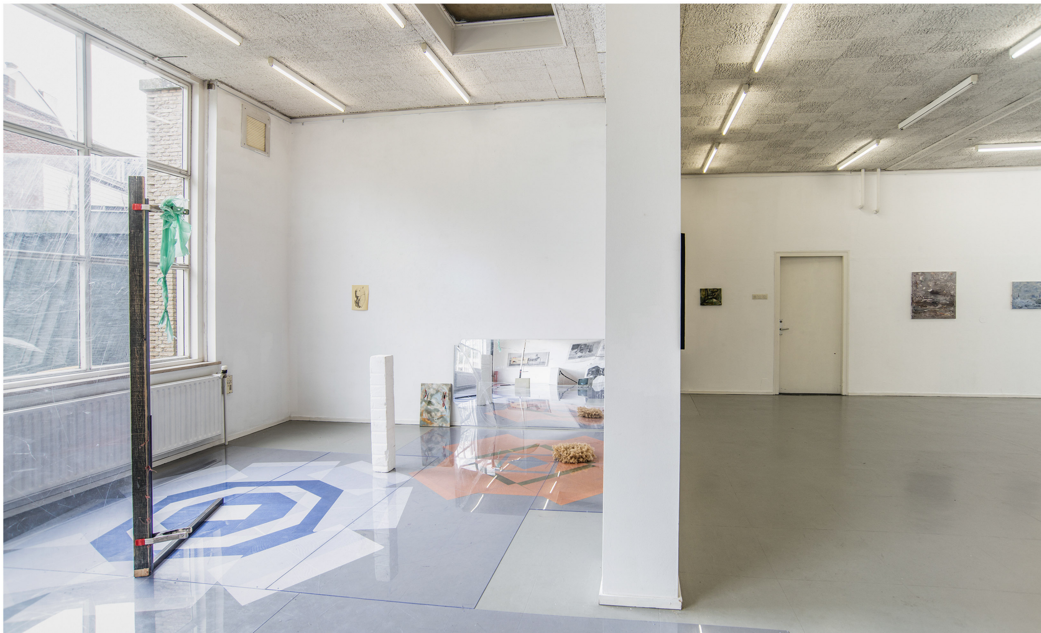
It is part II of an ensemble, and this ensemble is no longer necessarily ceremonial, 2019 installation view Support Structures , former Gallery Kokon, Tilburg